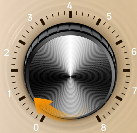
Image: A graphic detailing the 8 variable speeds and pulse function, showing recommended uses for juices, smoothies, milkshakes, purees, and hummus.