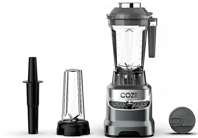
Image: All components of the COZII blender laid out, showing the motor base, large pitcher, to-go cup, and accessories.