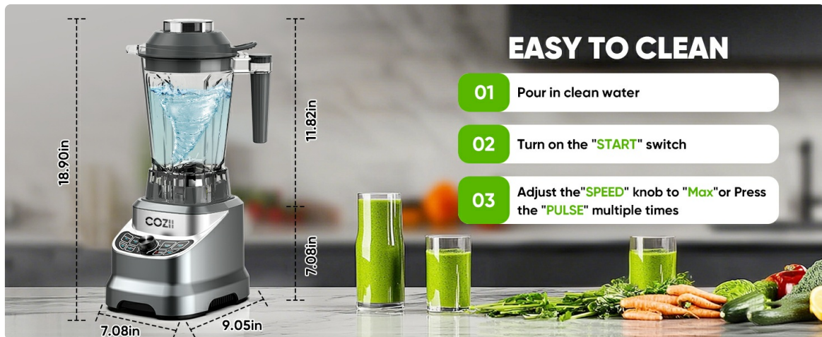
Image: A visual guide showcasing the versatility of the COZII blender for making smoothies, ice cream, frozen drinks, and extracts.