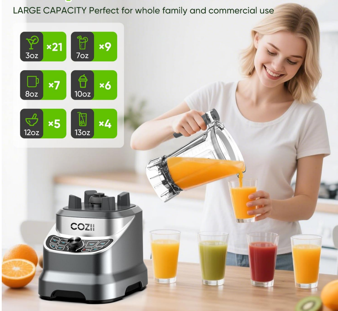
Image: A woman pouring a blended drink from the 64oz pitcher into several glasses, illustrating the blender's large capacity for family use.