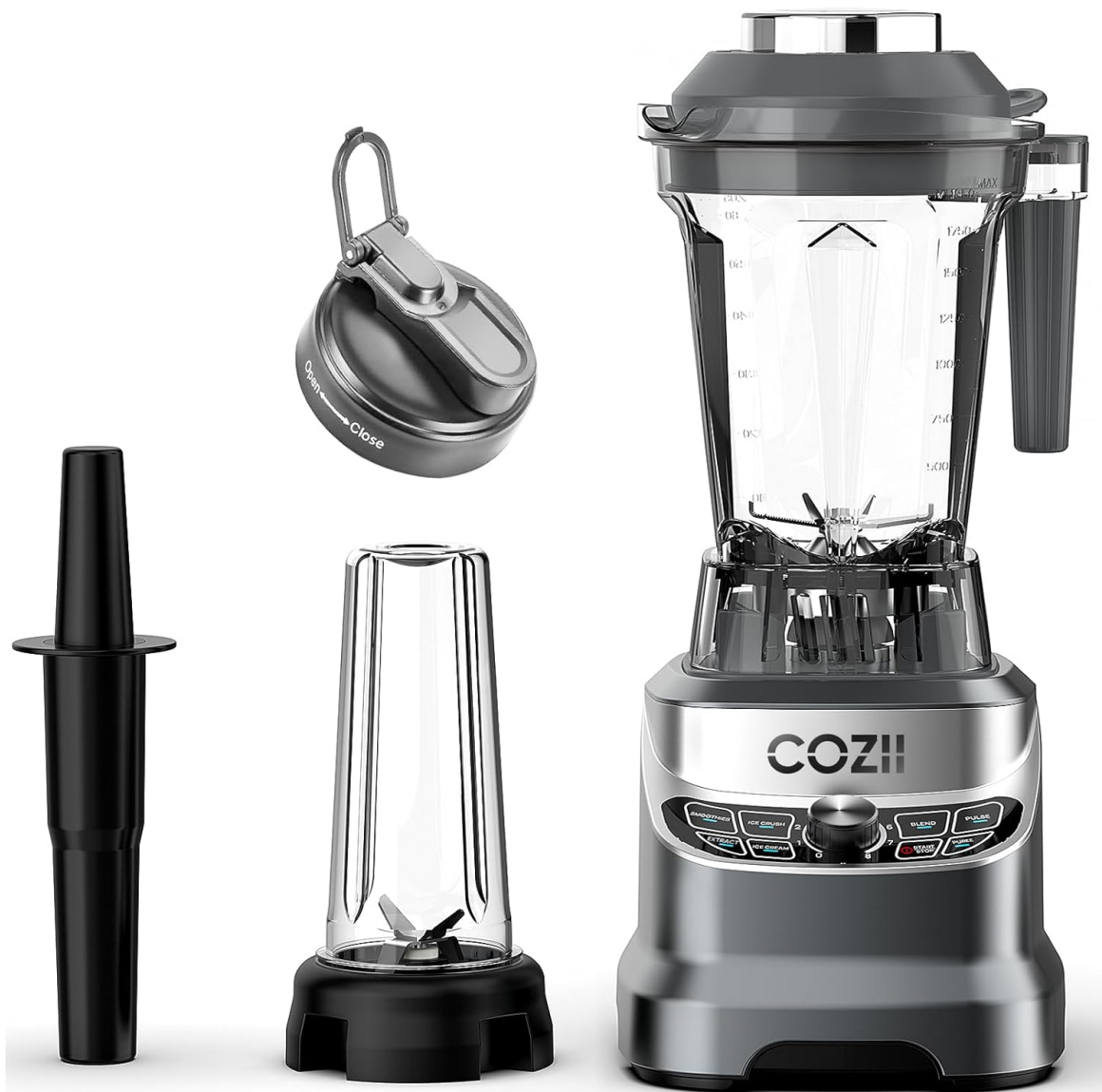
Image: All components of the COZII ZM 5009 Professional Countertop Blender, including the motor base, large pitcher, to-go cup, and tamper.