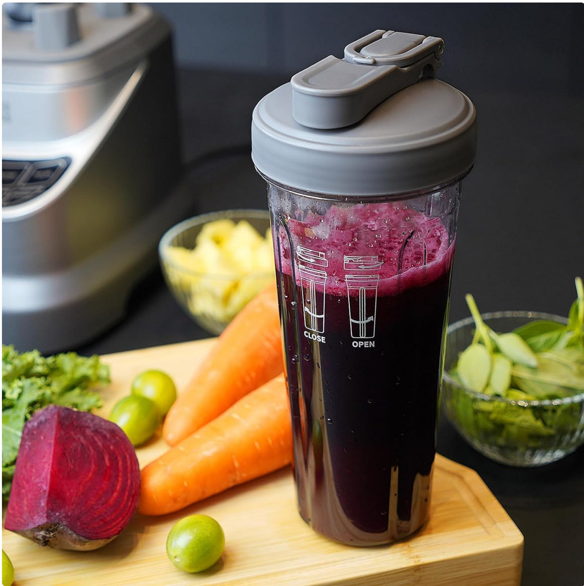
Image: A 21oz to-go cup filled with a vibrant purple smoothie, showcasing its convenience for individual servings.