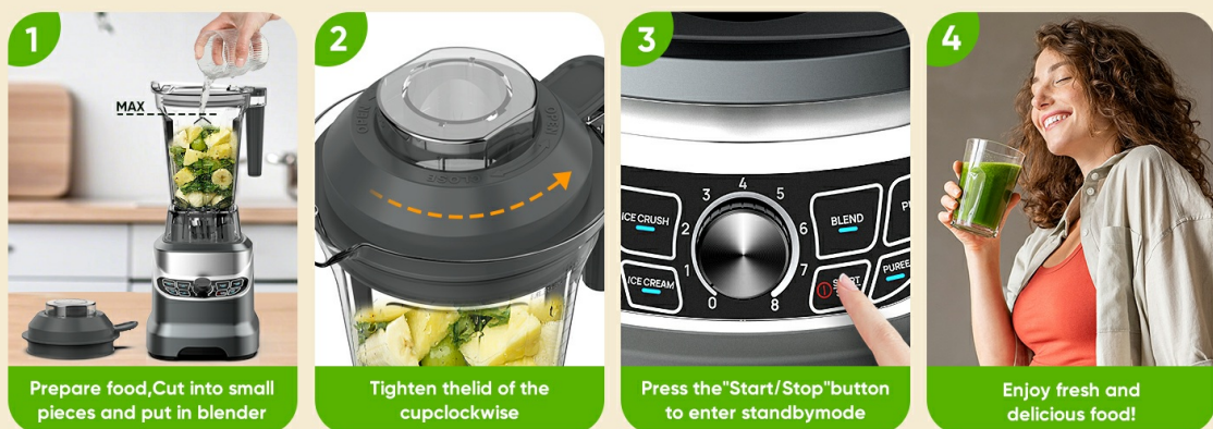
Image: A visual guide demonstrating the four simple steps to use the COZII blender: prepare ingredients, secure the lid, press start, and enjoy.