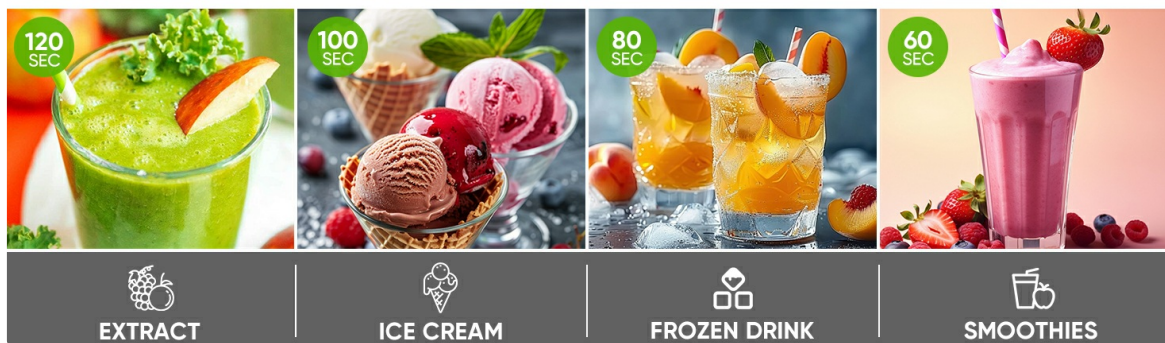
Image: Visual representation of the 7 smart settings and touchscreen control for various blending tasks.

With intelligent programs, you can make milkshake, fruit smoothies, frozen drinks at the touch of a button