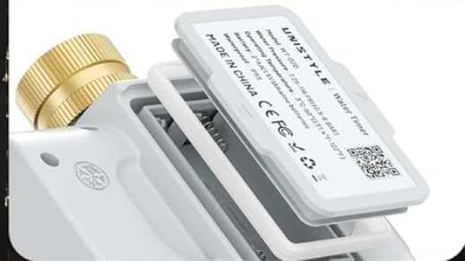
Image: The timer demonstrating its rain delay feature and IP55 waterproof level.