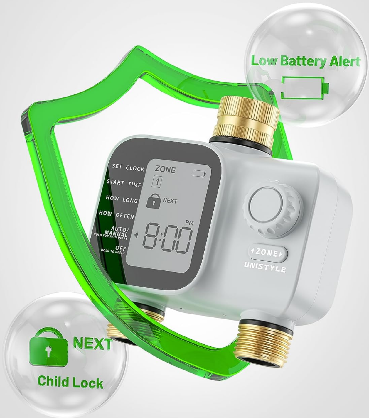
Image: The timer's display indicating low battery and child lock status.

Prevents valve failure, protects your yard, avoids flooding risks and stops surprise water bills