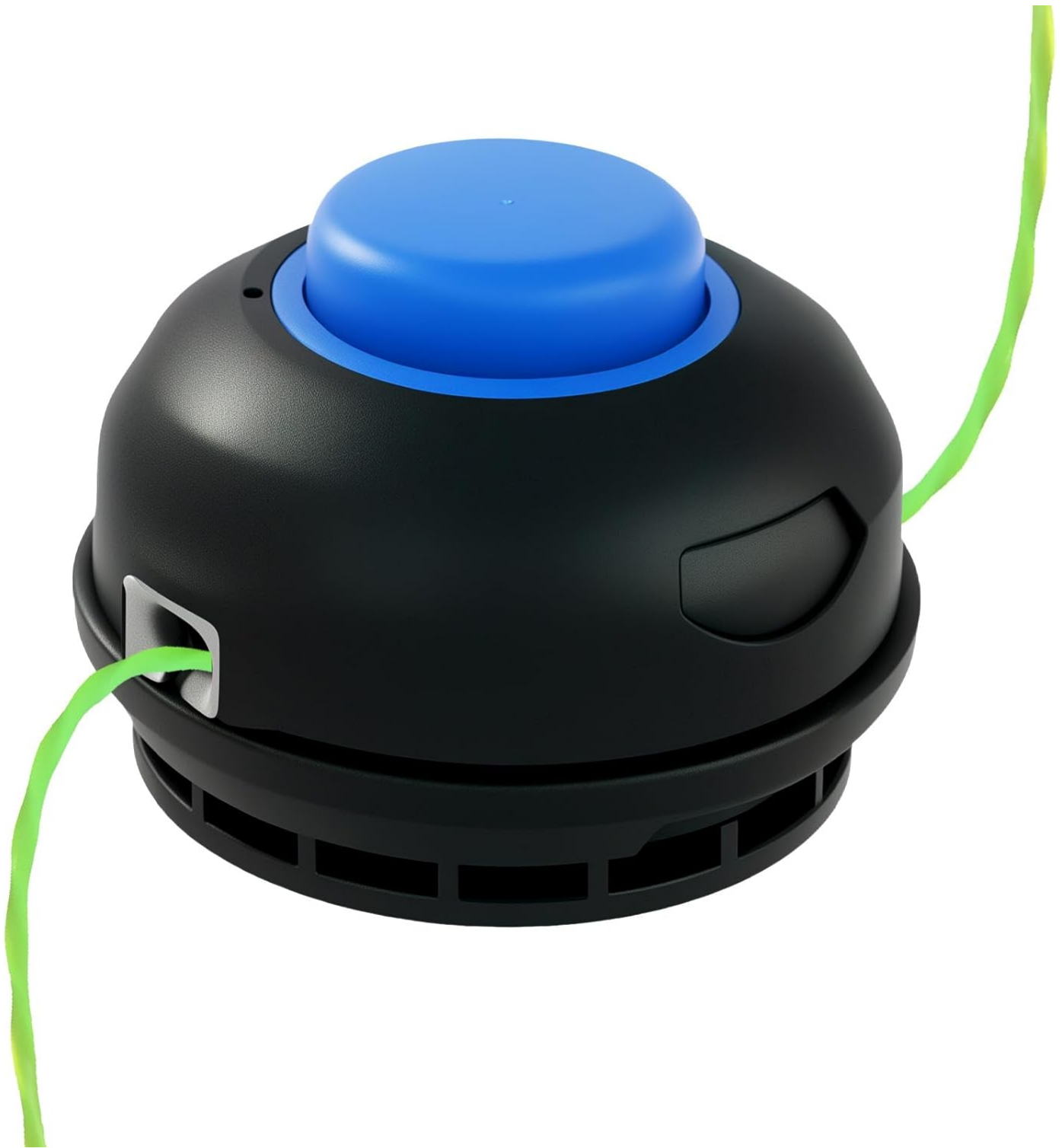
Image: The Thten KST 2224B-03 KLS 124-03 Trimmer Head, featuring a black body with a blue cap and green trimmer line extending from its sides.