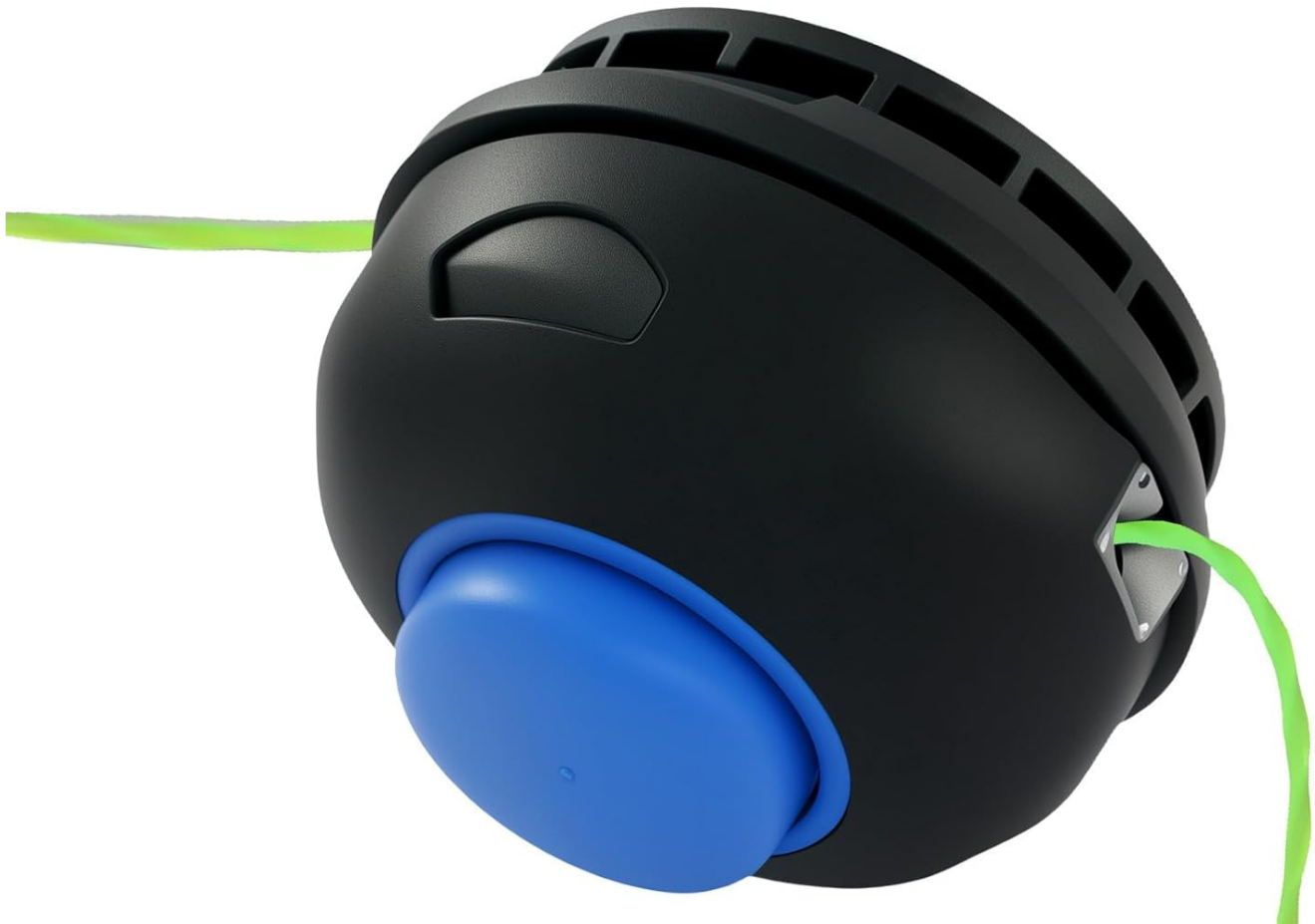
Image: The trimmer head shown with text indicating its compatibility with various Kobalt 24 Volt KST models and item numbers.

Item number: 1157557, 1504979, 1157560, 1137837