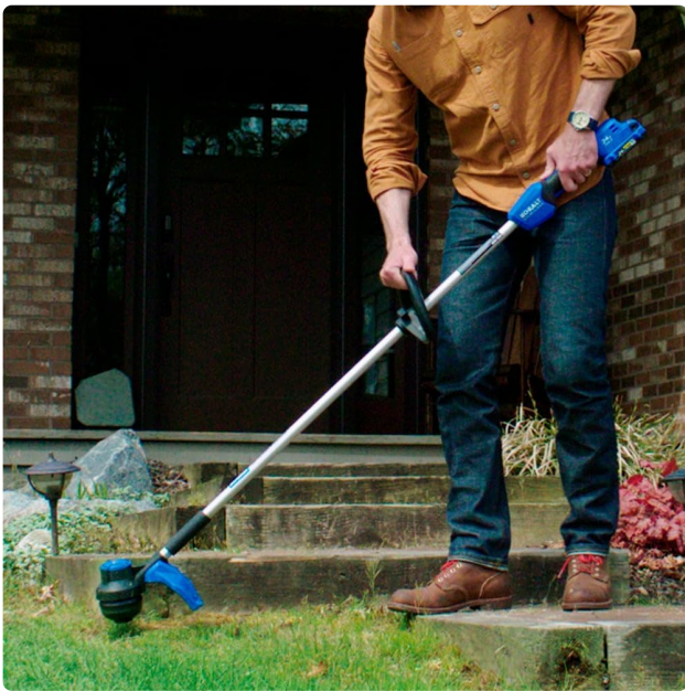
Image: A person operating a string trimmer to cut grass along a pathway next to a house, demonstrating typical use.