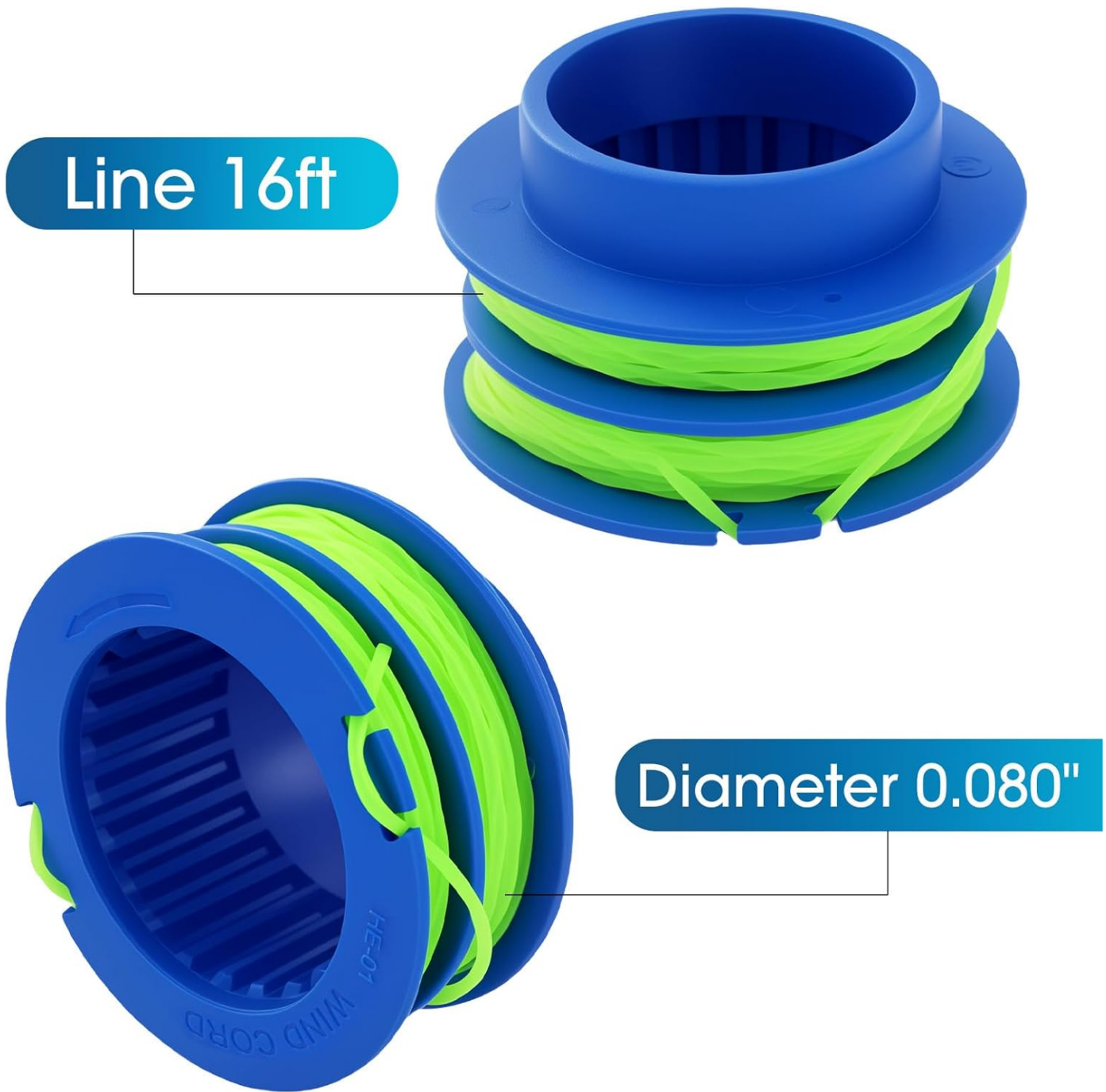
Image: A blue trimmer line spool with green line, indicating a line length of 16 feet and a diameter of 0.080 inches.