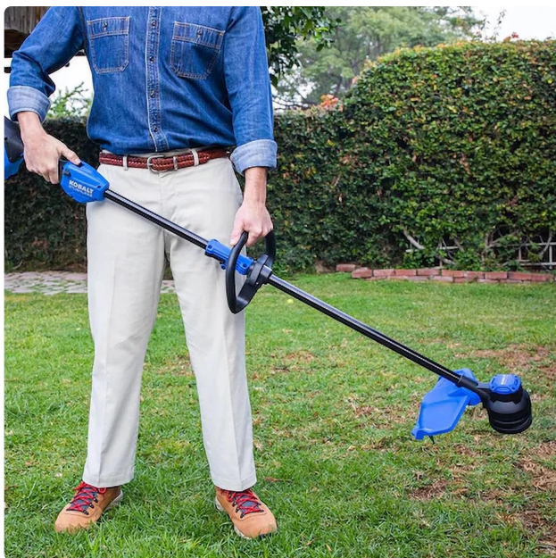
Image: A person using a string trimmer in a garden area, showcasing the product's application in various outdoor spaces.