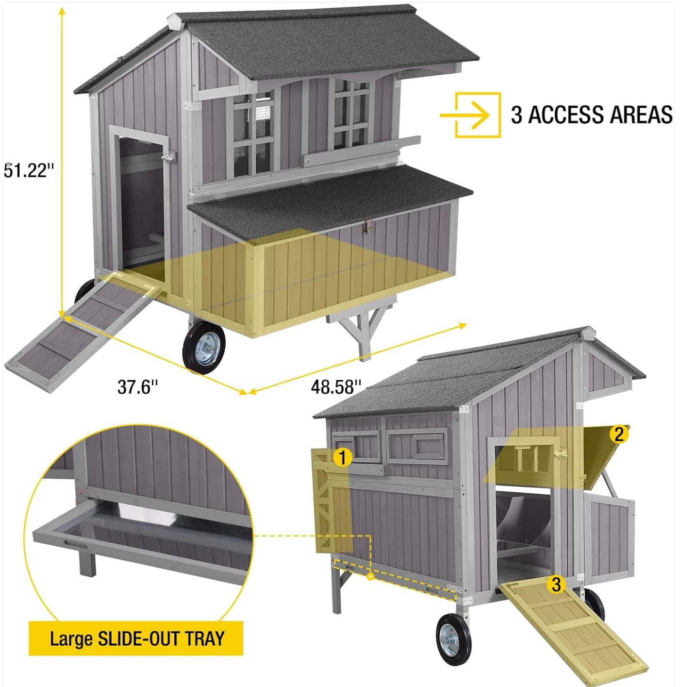
Figure 3: Visual representation of the three main access areas of the coop and the large slide-out tray for convenient cleaning.