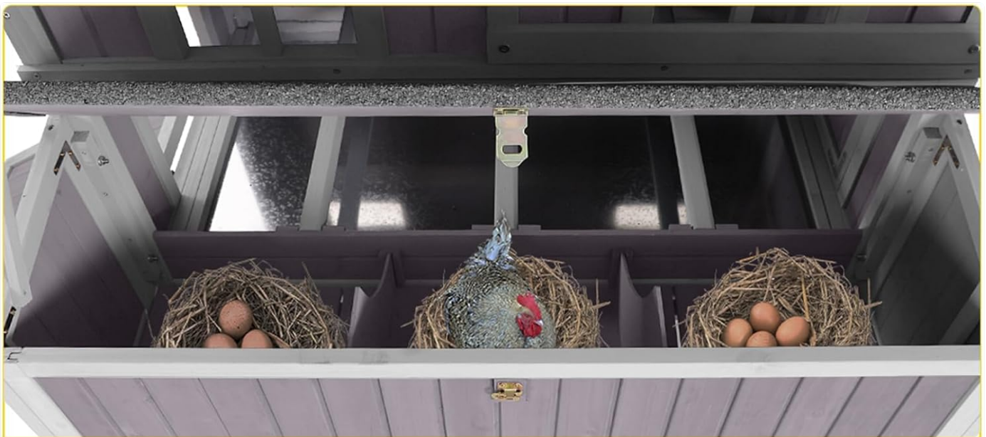
3 Large Nesting Boxes