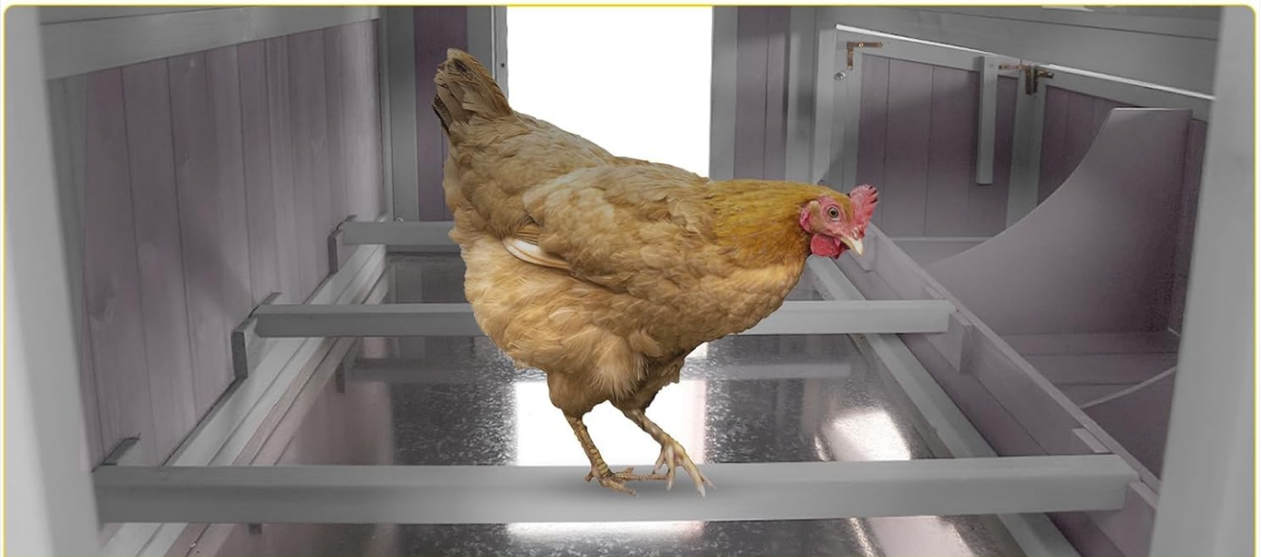
3 Round-Edged Perches