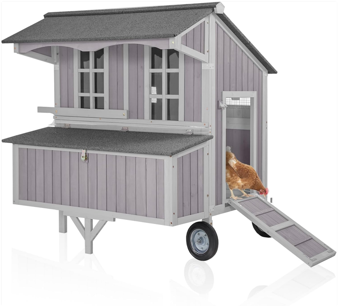
Figure 1: Overview of the Aivituvn Chicken Coop AIR96, showcasing its design and features like the ramp and wheels.