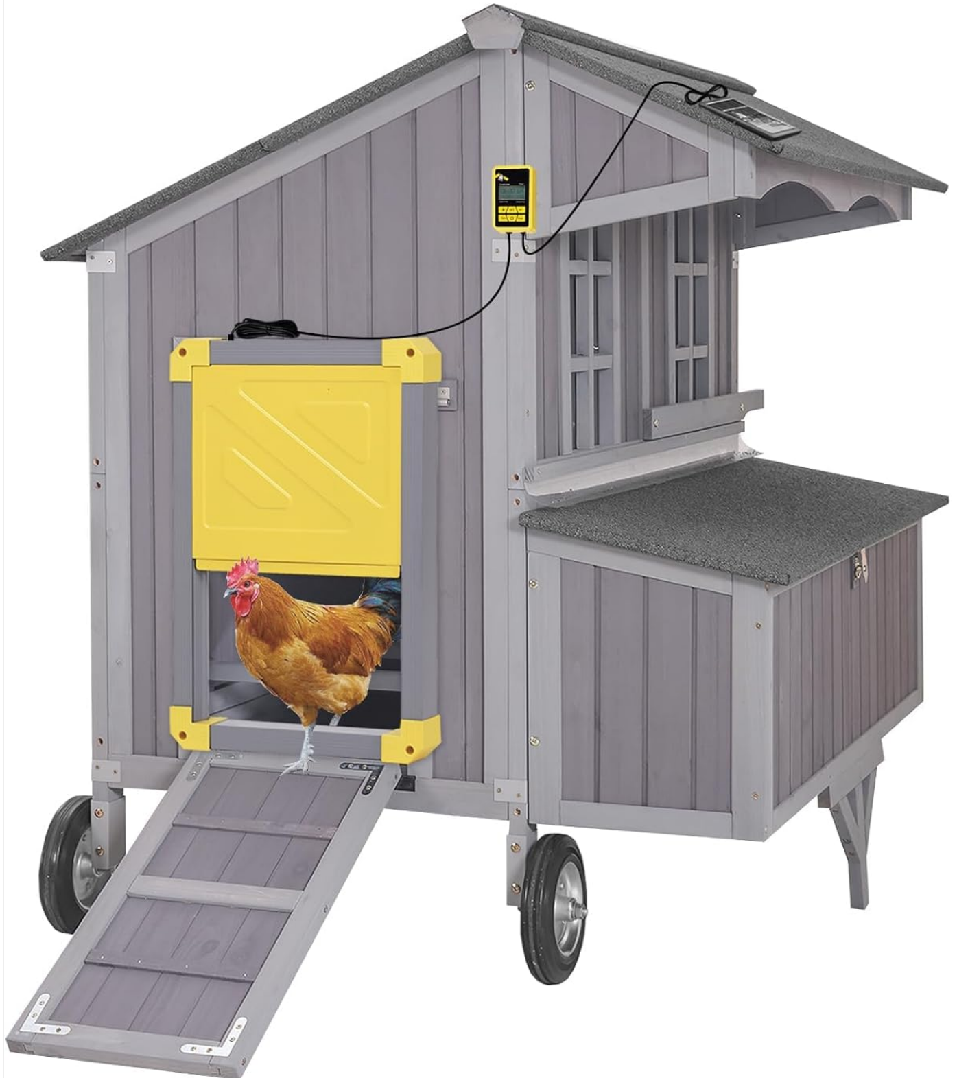
Figure 7: The chicken coop shown with an optional automatic chicken door installed, simplifying daily poultry routines.

Simplify Poultry Management with Automatic Chicken Door