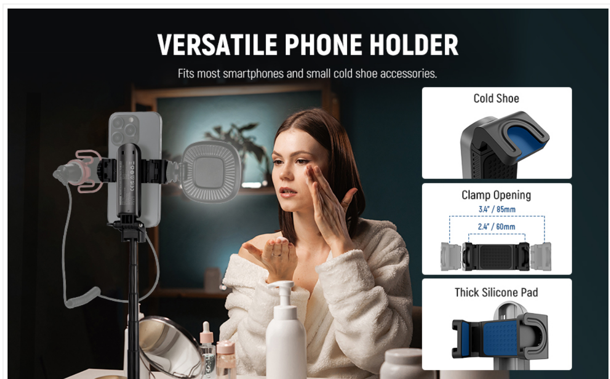
Image: A detailed view of the NEEWER P15's versatile phone holder, highlighting its cold shoe accessory mounts, the 2.4-3.3 inch (60-85mm) clamp opening, and the thick silicone pads designed to prevent scratches on your smartphone.