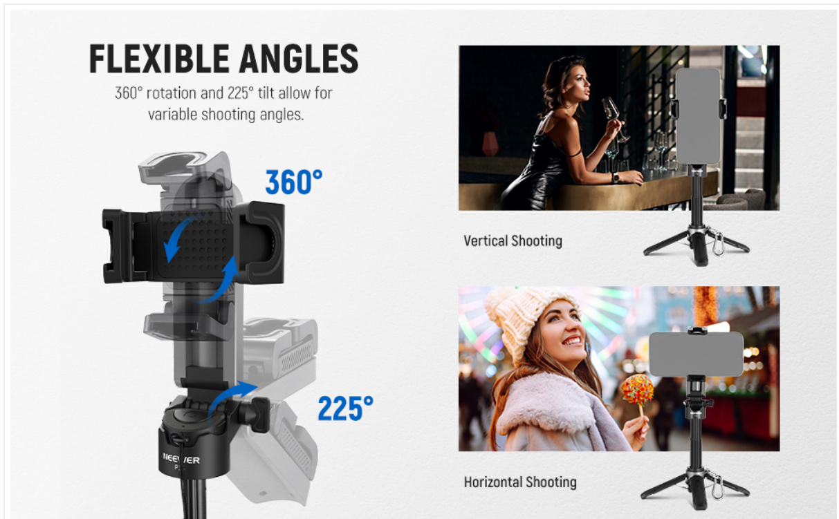
Image: The NEEWER P15's phone holder illustrating its 360-degree rotation for switching between vertical and horizontal shooting, and its 225-degree tilt capability for adjusting camera angles.