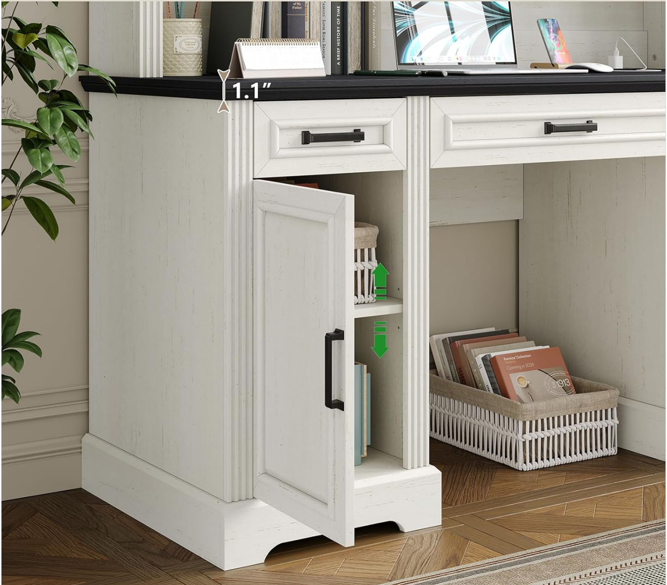
Figure 3: The cabinet features an adjustable shelf for flexible storage.