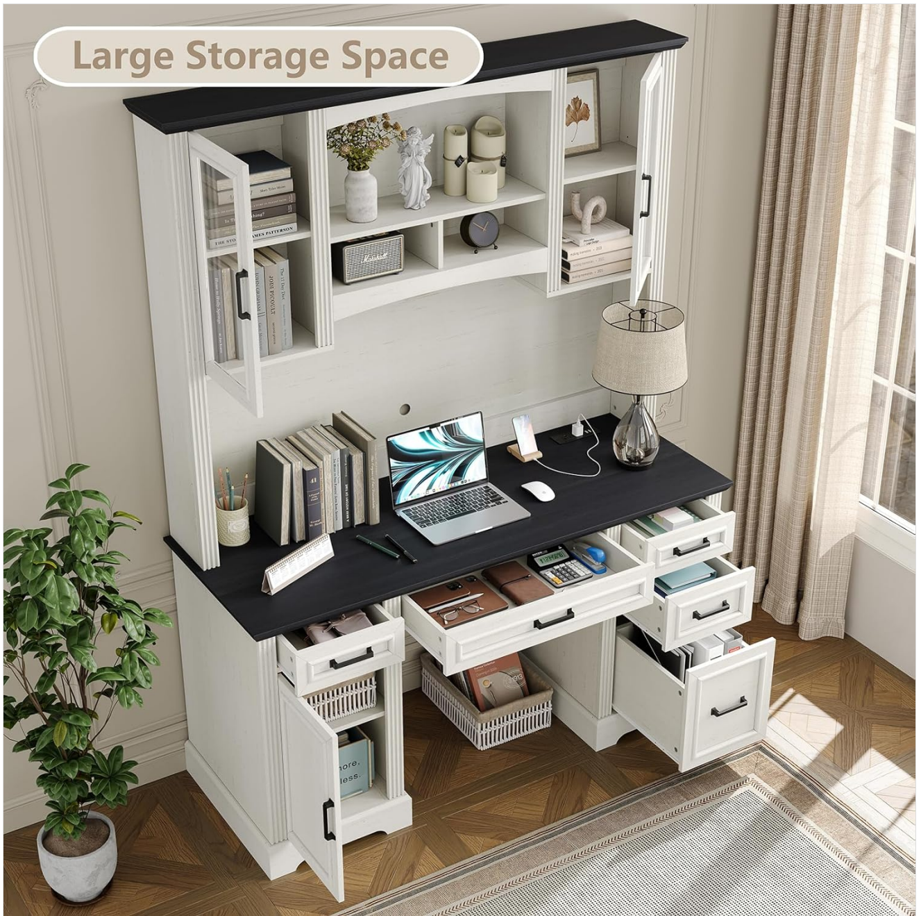
Figure 2: The desk offers ample storage with multiple drawers and a cabinet.