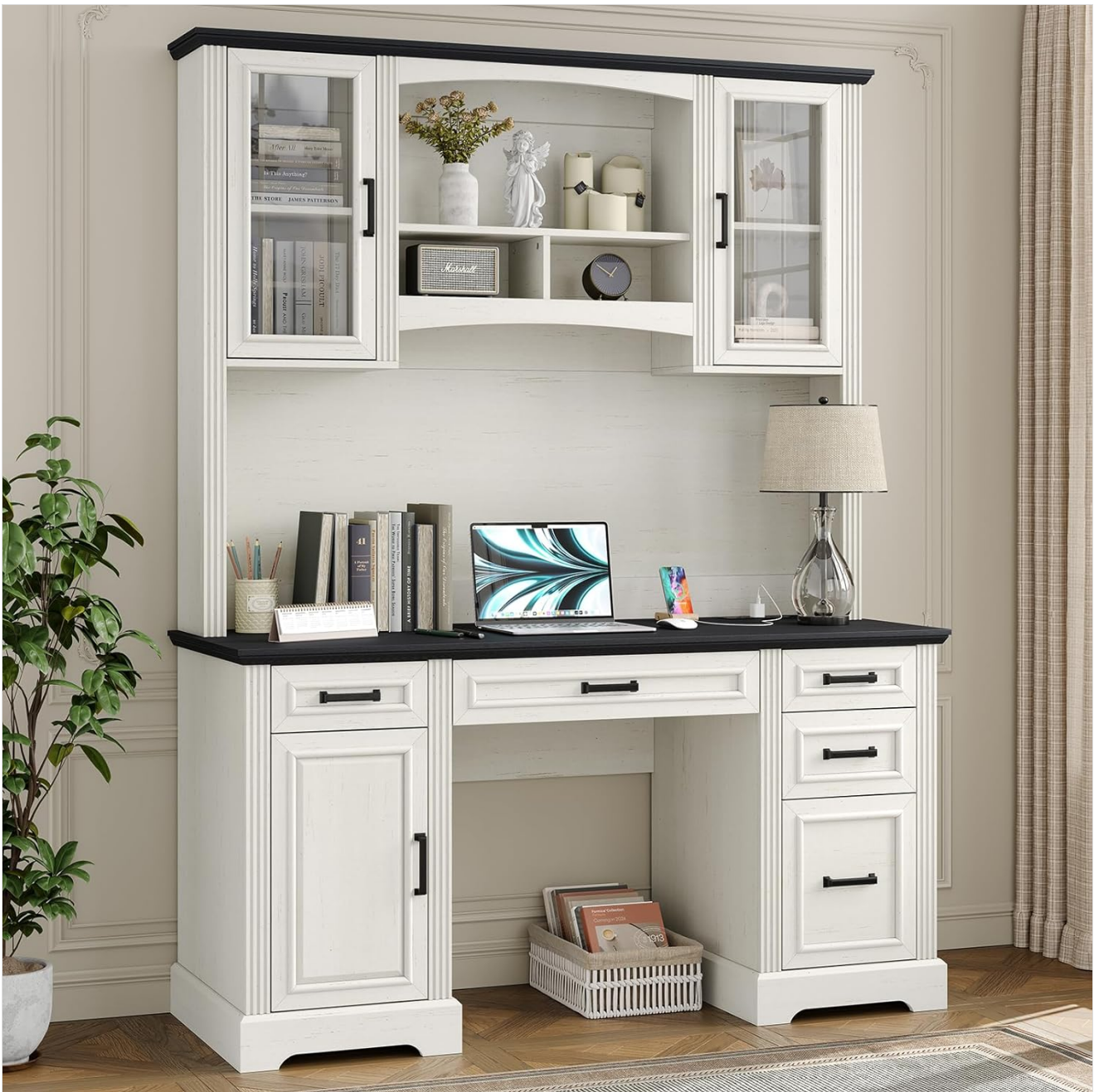
Figure 1: Overall dimensions and structure of the Furniouse Farmhouse 76" Executive Desk with Hutch.