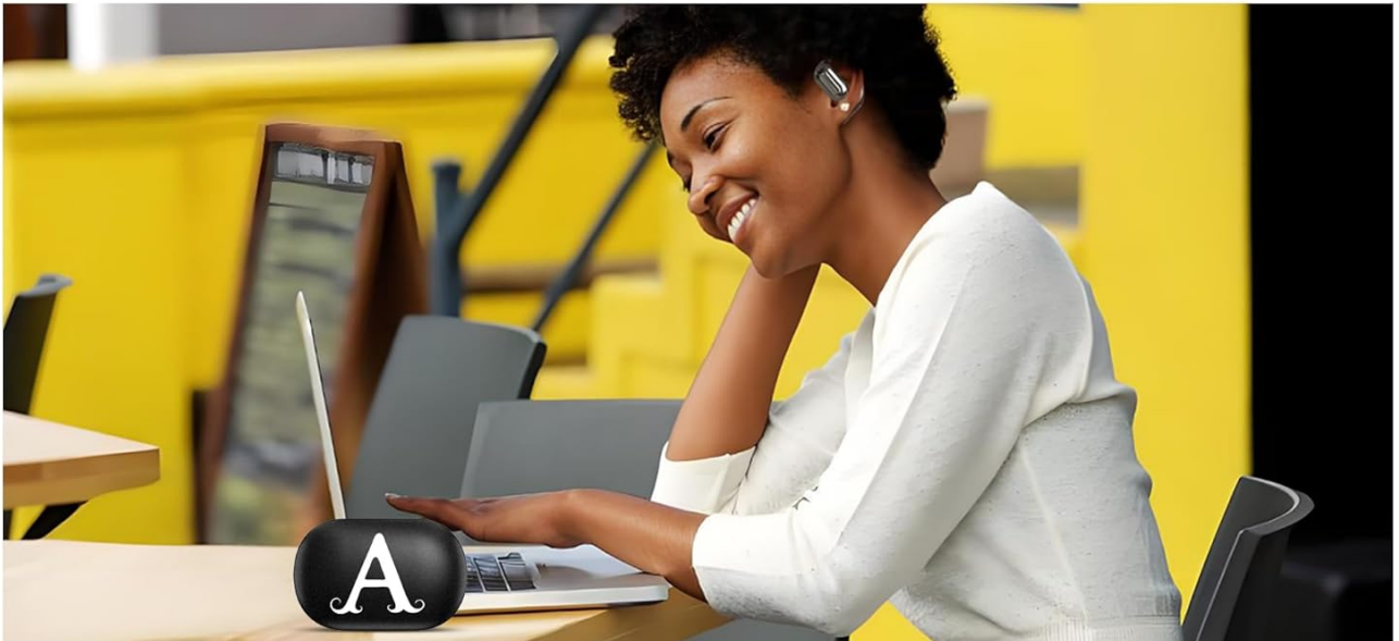
A display of various earbud cases with different initial monograms, emphasizing the personalization feature.