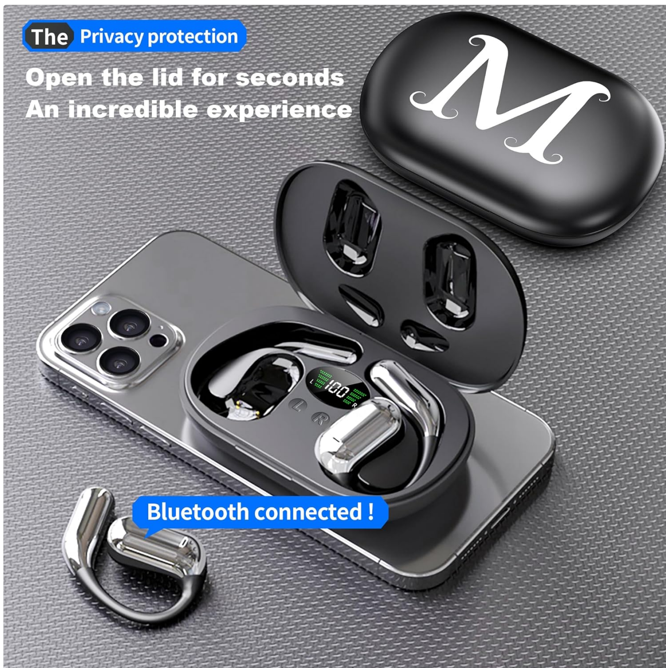
The earbuds in their charging case, showing Bluetooth connection status on a smartphone, highlighting privacy protection.

Open the lid for seconds An incredible experience