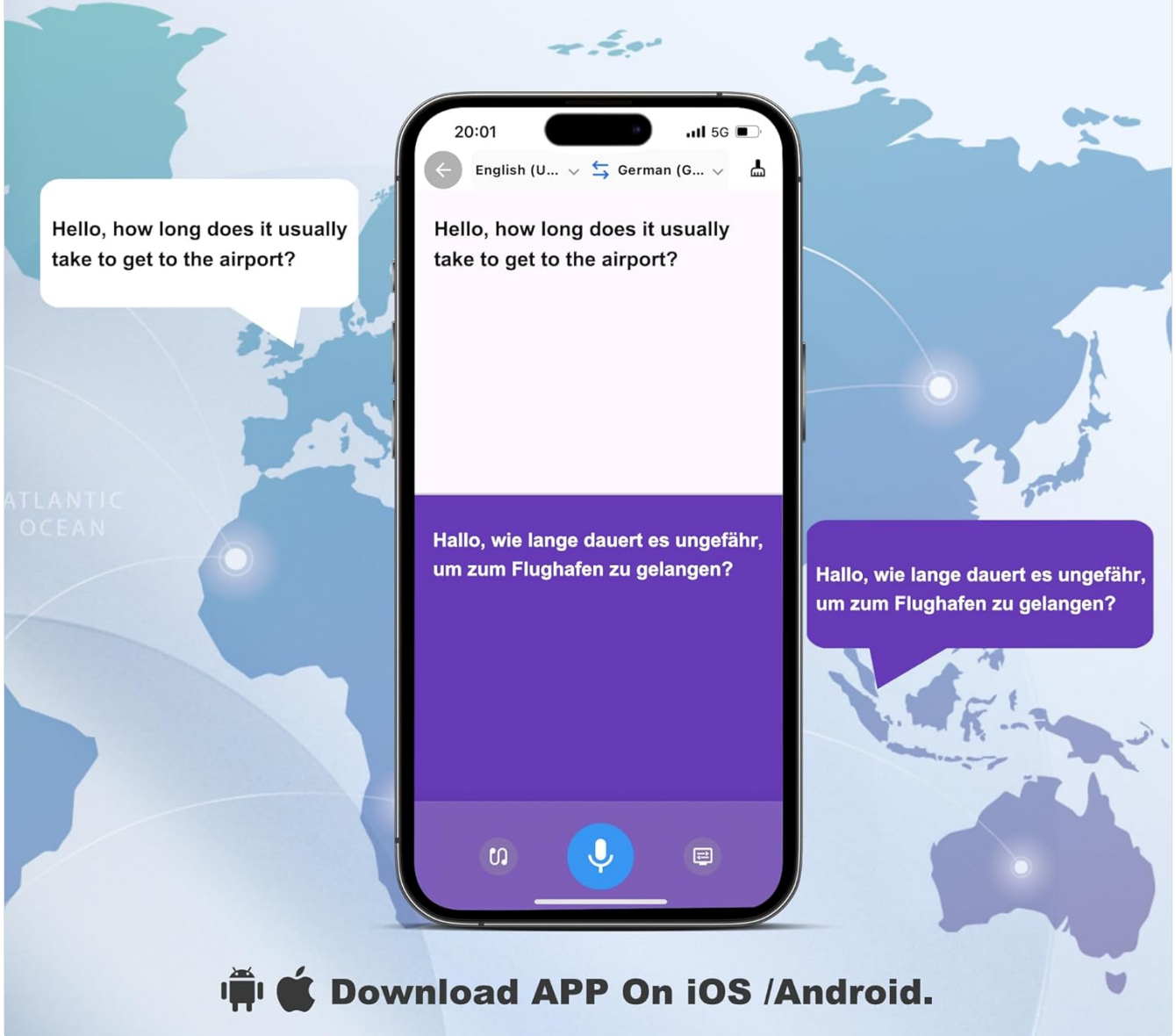
A smartphone screen displaying the translation app interface, demonstrating real-time language translation between English and German.