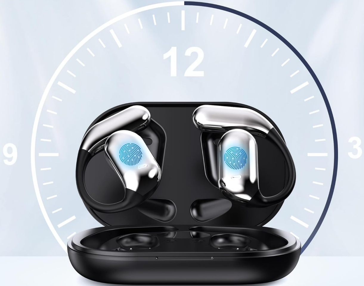
An infographic illustrating the battery performance: 12 hours talk & music playing time, 80 hours standby time, and 60 hours charging time for the headset.