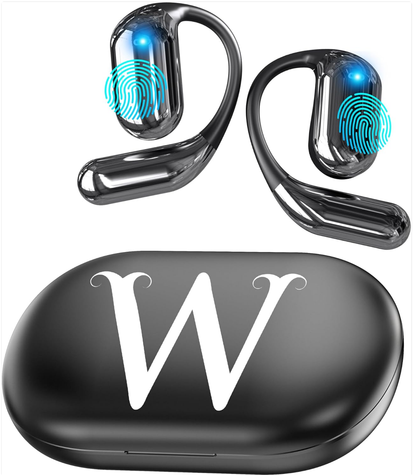
The Srotek Language Translator Earbuds and their charging case, featuring a personalized initial on the case.