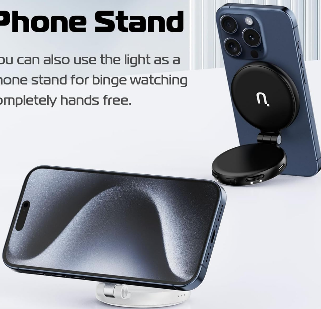
Figure 5.4: Also A Phone Stand. This image illustrates the LM19 functioning as a phone stand, supporting a smartphone in both vertical and horizontal orientations for hands-free viewing.

You can also use the light as a phone stand for binge watching completely hands free.