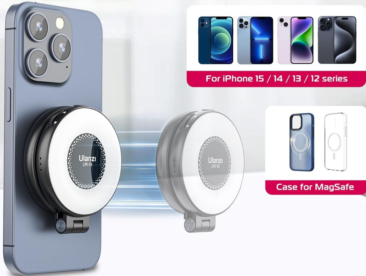
Figure 4.1: Strong MagSafe Adsorption. This image demonstrates the secure magnetic attachment of the LM19 to various iPhone models, highlighting its compatibility and stability.

Easy to install and remove it with only one hand.