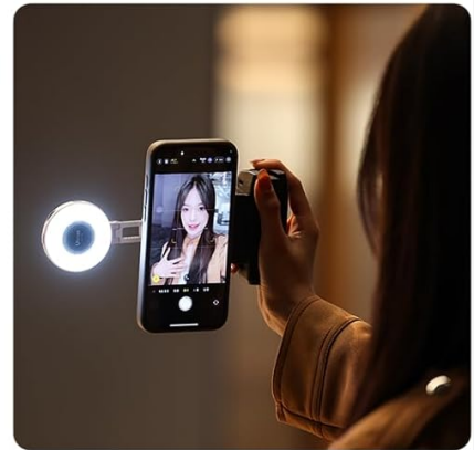
Figure 5.3: Flip Design. This image demonstrates the flexible hinge mechanism of the LM19, allowing the light to be flipped over 180 degrees to achieve various lighting angles for photos and videos.