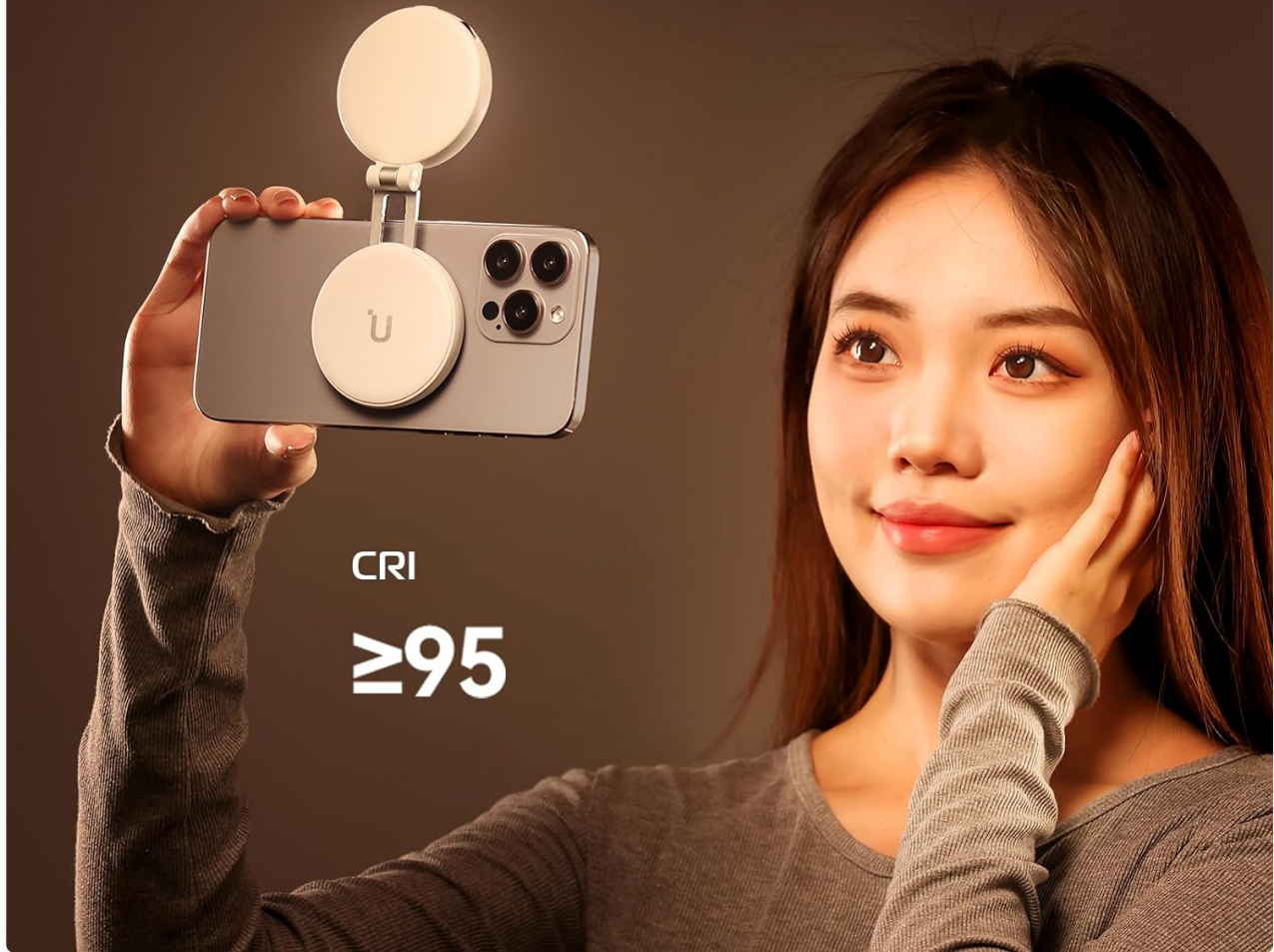
Figure 5.2: Soft Light Enhancement. This image shows the LM19 providing soft, flattering light for a subject, emphasizing its high CRI (Color Rendering Index) of \geq 95 for natural illumination.