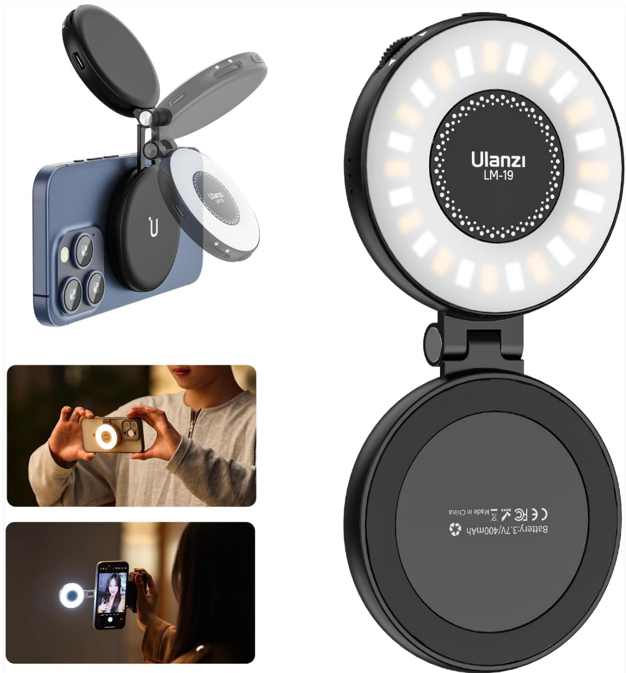
Figure 3.1: ULANZI LM19 Magnetic Selfie Light and Phone Stand. This image displays the device in its open configuration, attached to a smartphone, highlighting its dual functionality as a light and a stand.

The ULANZI LM19 combines a powerful magnetic fill light with a flexible phone stand, offering portability and versatility for content creation.