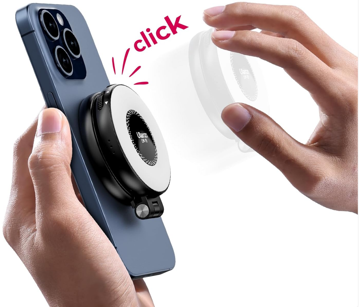
Figure 3.2: Easy Magnetic Attachment. This image illustrates the simple magnetic attachment process of the LM19 to a smartphone, emphasizing its quick and secure connection.

With a magnetic design, this light can be attached to iron metal surfaces for flexible scene changes.