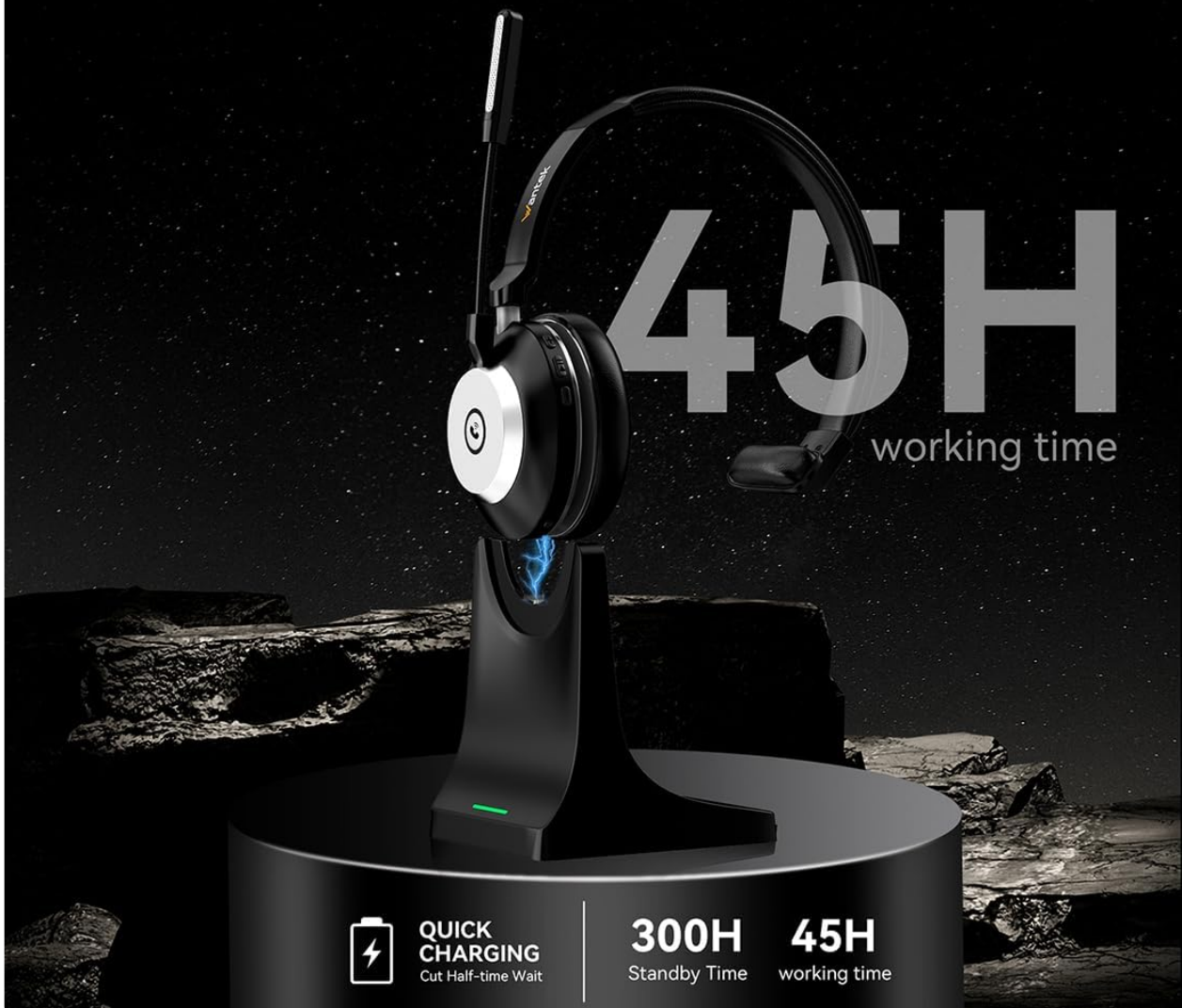
Image: The headset on its charging base, highlighting its 45-hour working time and quick charging capability.