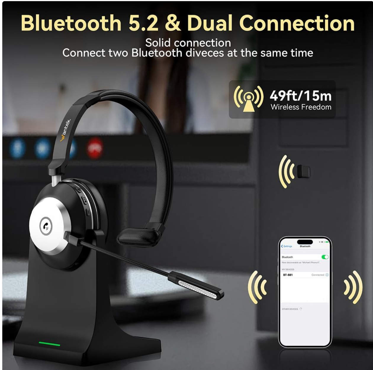
Image: The headset illustrating its Bluetooth 5.2 connectivity and ability to connect simultaneously to both a computer via USB dongle and a smartphone.