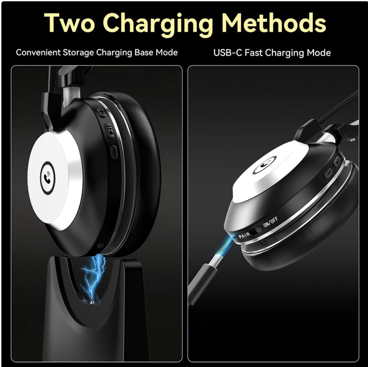
Image: Illustration of the two charging methods for the headset: placing it on the charging base or connecting it directly via a USB-C cable.

A full charge provides approximately 45 hours of working time and 300 hours of standby time.