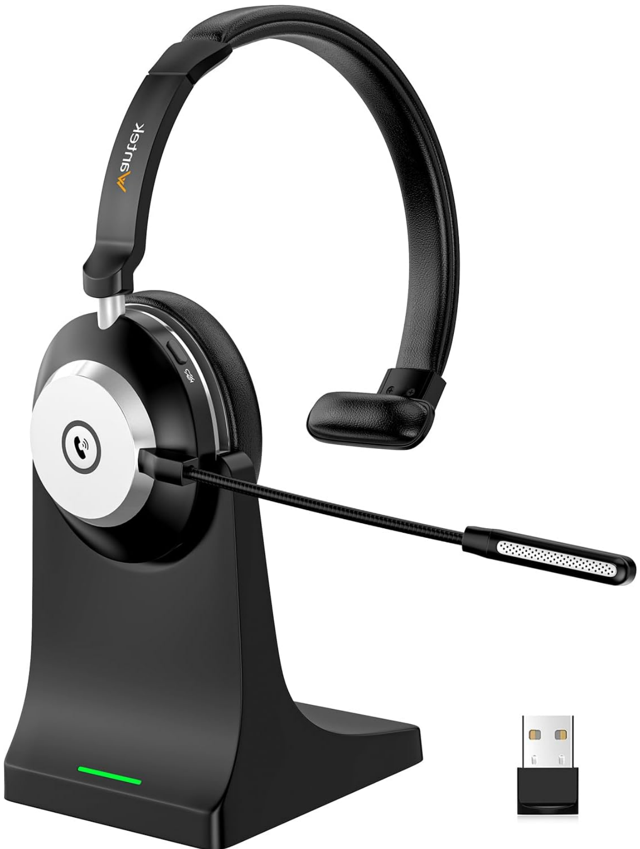
Image: The Wantek Wireless Bluetooth Headset, its charging base, and the USB dongle, as included in the package.