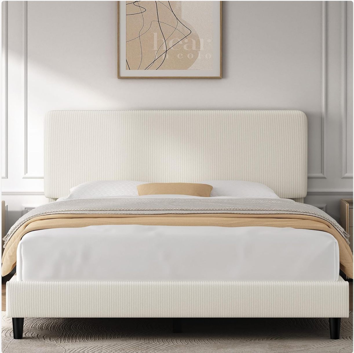
Figure 1: Yaheetech Queen Bed Frame (Beige)