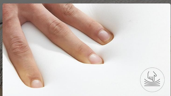
Supportive High-Density Foam