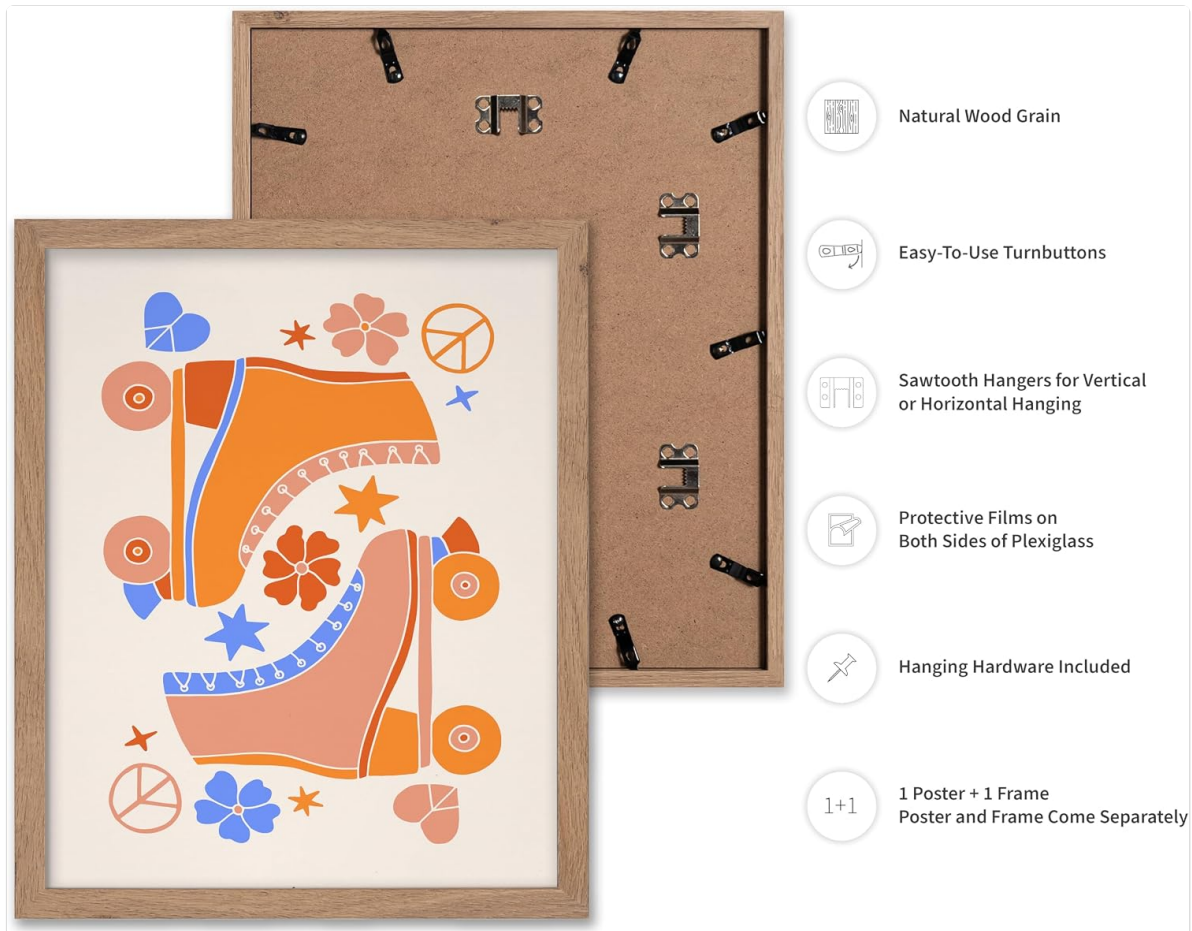
Figure 2: Rear view of the frame, highlighting the easy-to-use turnbuttons and sawtooth hangers for vertical or horizontal hanging. Hanging hardware is included for convenience.