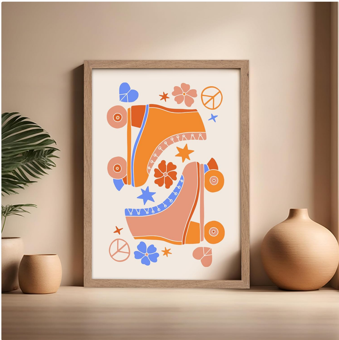
Figure 4: A lifestyle image showing the framed print as a decorative element on a shelf, complementing the room's decor.