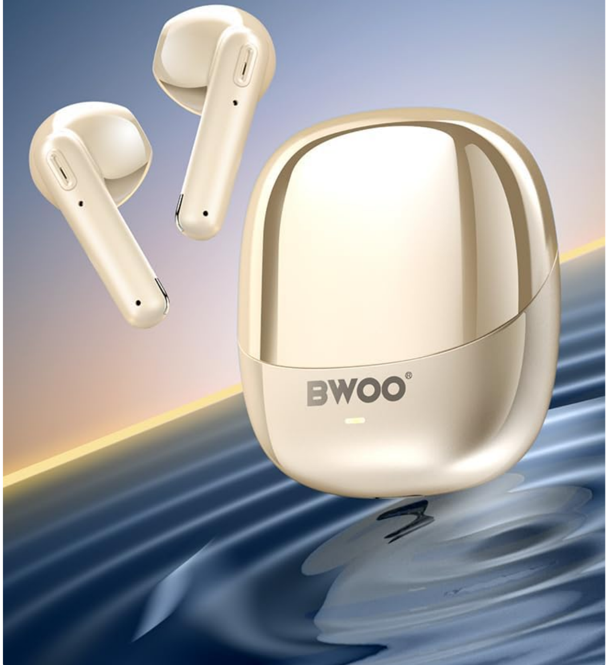
Image: The BWOO BW98 TWS Wireless Earbuds and their charging case, showcasing their sleek off-white design.