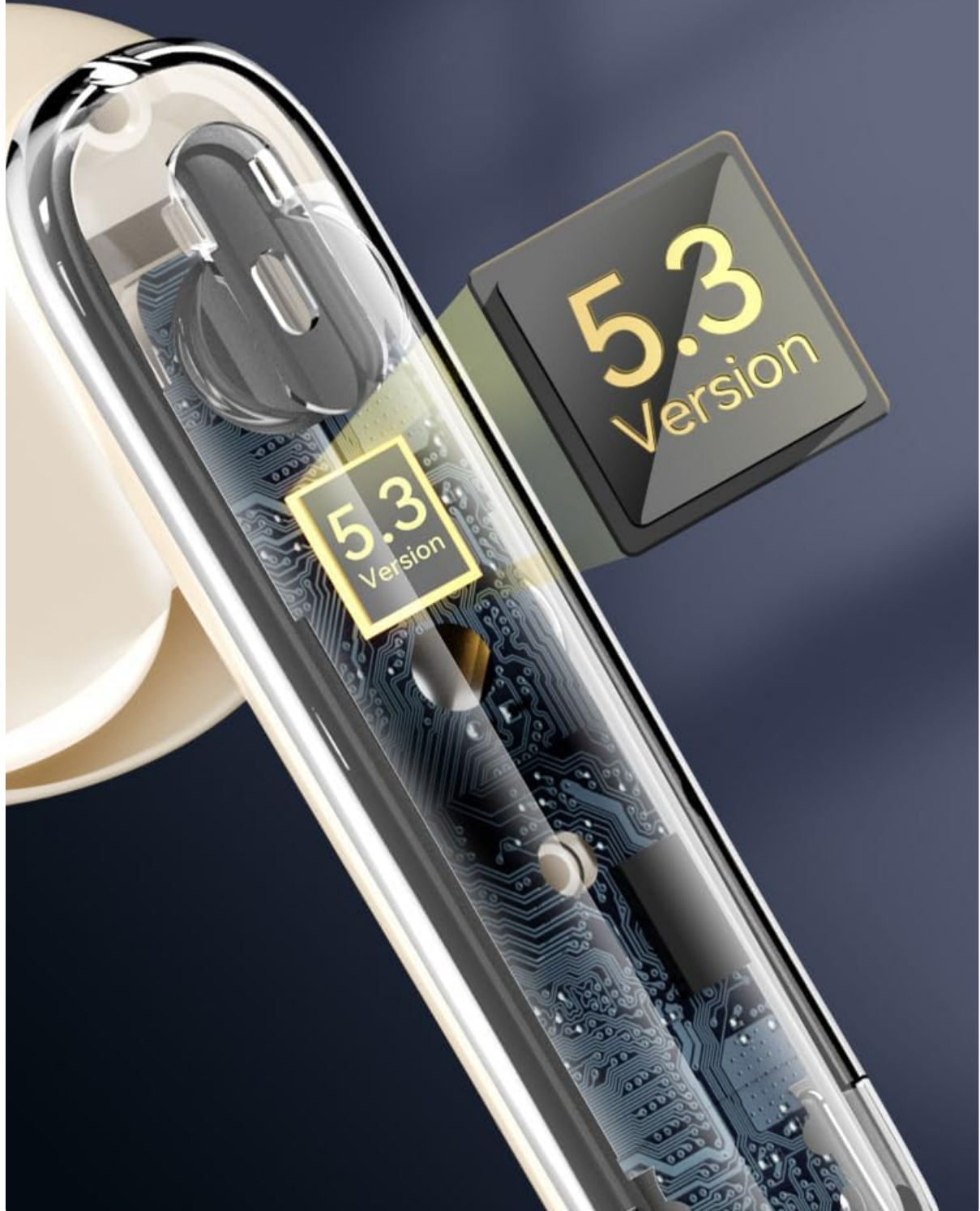
Image: A detailed view of the BW98 earbud's internal components, emphasizing the Bluetooth 5.3 smart chip for low power consumption and stable connection.

Low power consumption Fast transmission and stable connection