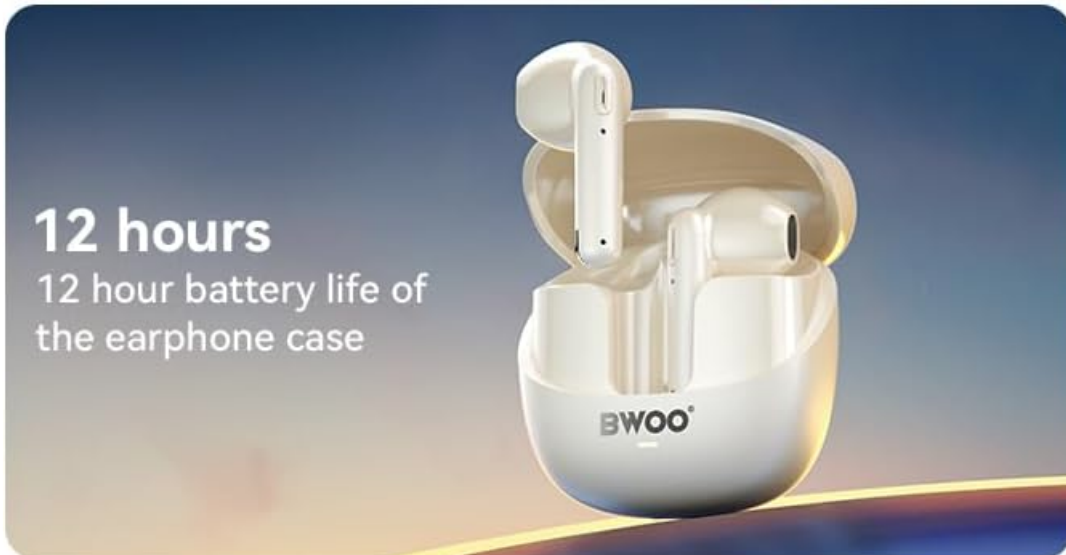
Image: A visual representation of the BW98's core features, including Environmental Noise Cancellation, deep bass stereo sound, Bluetooth 5.3 connectivity, and the charging case's battery capacity.