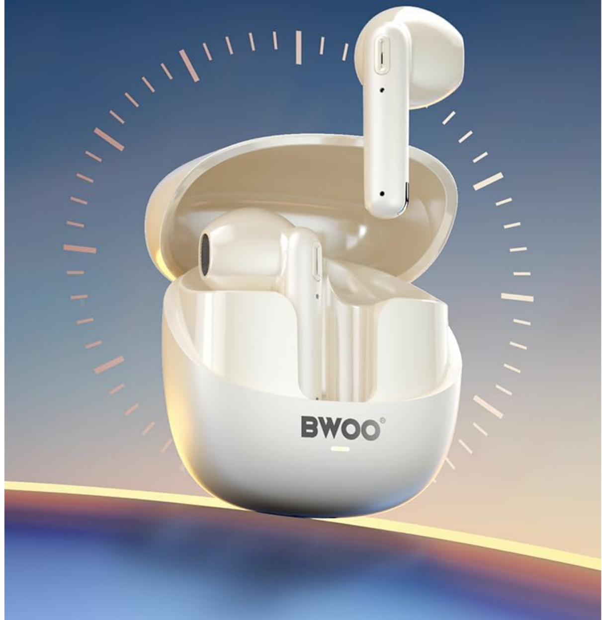
Image: The BW98 earbuds resting in their charging case, highlighting the extended battery life of 12 hours for the case, 4 hours for music, and 4 hours for calls.