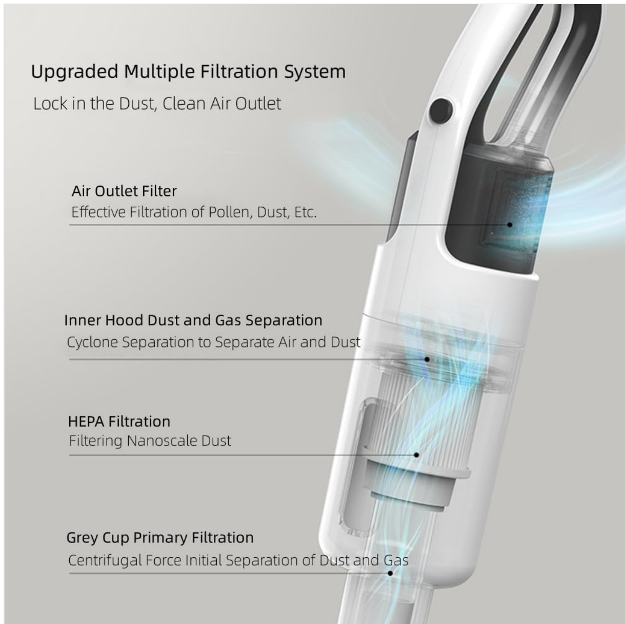
Figure 4.5: Diagram of the upgraded multiple filtration system, which includes primary filtration, cyclone separation, HEPA filtration, and an air outlet filter to capture dust and ensure clean air exhaust.

Centrifugal Force Initial Separation of Dust and Gas