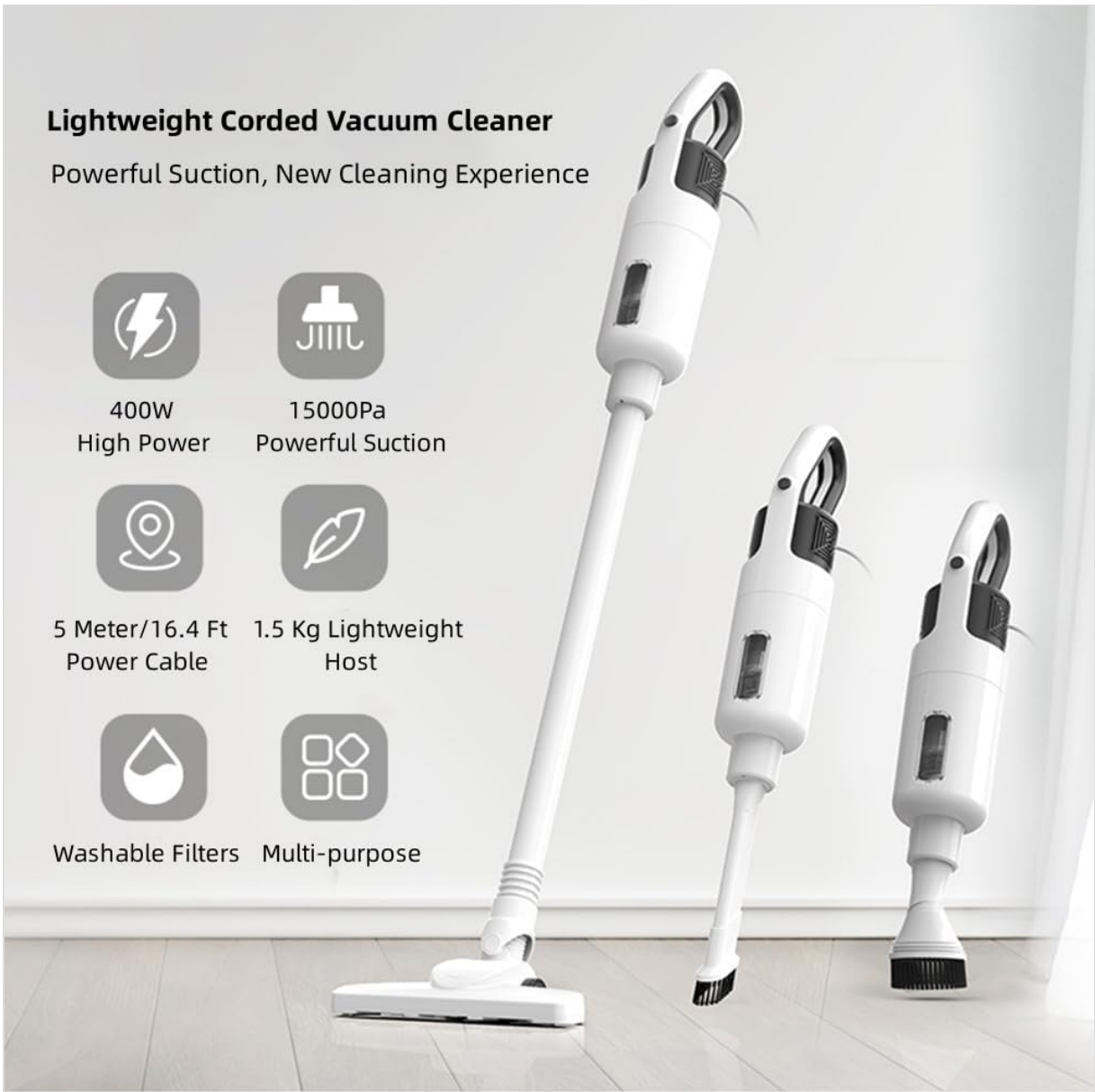
Figure 4.1: Overview of the Lightweight Corded Vacuum Cleaner highlighting its 400W high power, 15000Pa powerful suction, 5-meter power cable, 1.5 kg lightweight design, washable filters, and multi-purpose functionality. The image displays the vacuum in both stick and handheld configurations.