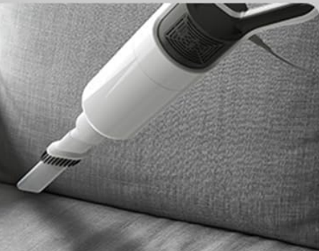
Figure 4.6: Examples of multiple cleaning scenarios using the included attachments: Floor Brush for tiles, Round Head Brush for beds, sofas, and tables, and Long Flat Suction Head for crevices.

Your browser does not support the video tag.