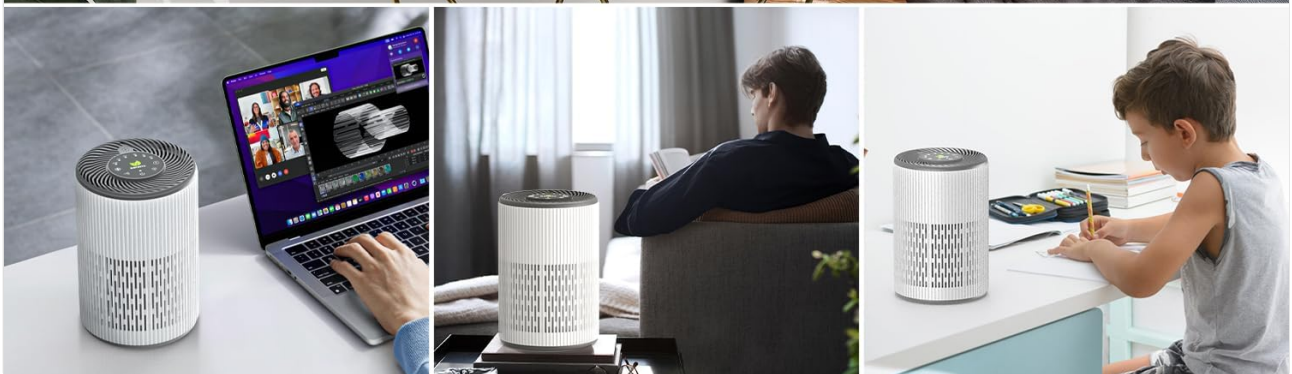
Image: This composite image displays the air purifier's compact size and its suitability for different environments, including a bedroom nightstand, an office desk, a living room, and a child's study area.