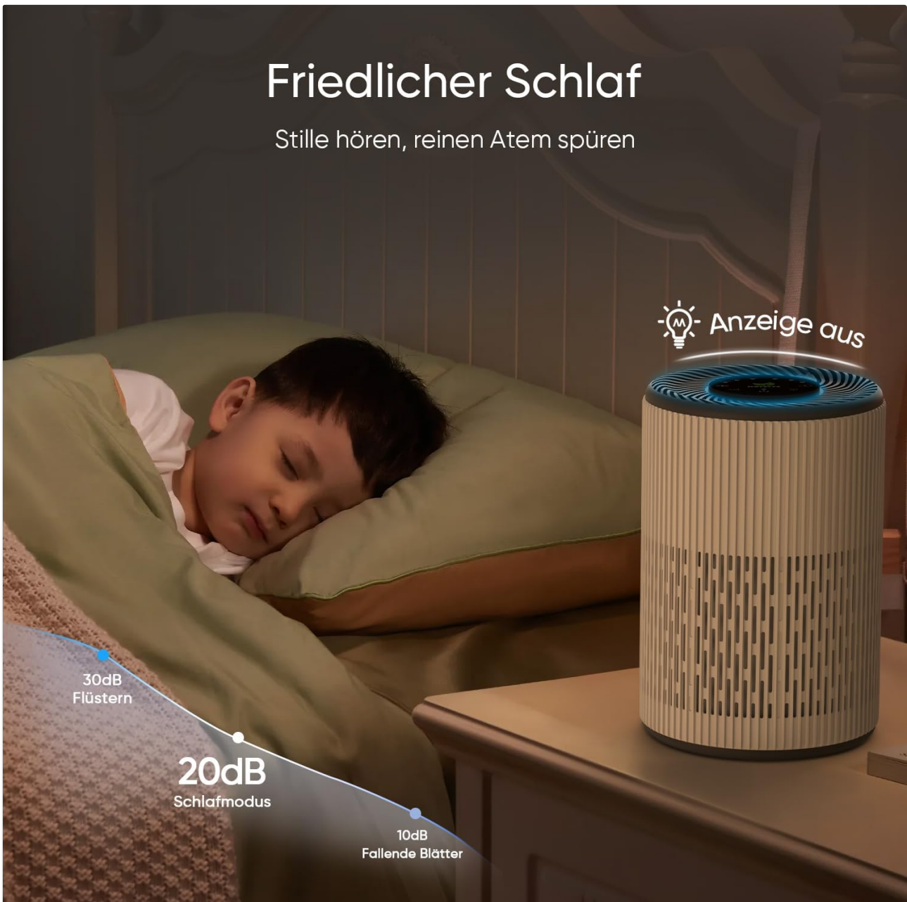
Image: The air purifier is depicted on a nightstand beside a sleeping child, illustrating its quiet operation in sleep mode (20dB) with

For undisturbed rest, activate the sleep mode. In this mode, the air purifier operates at its lowest fan speed (20dB) and automatically turns off its indicator lights.