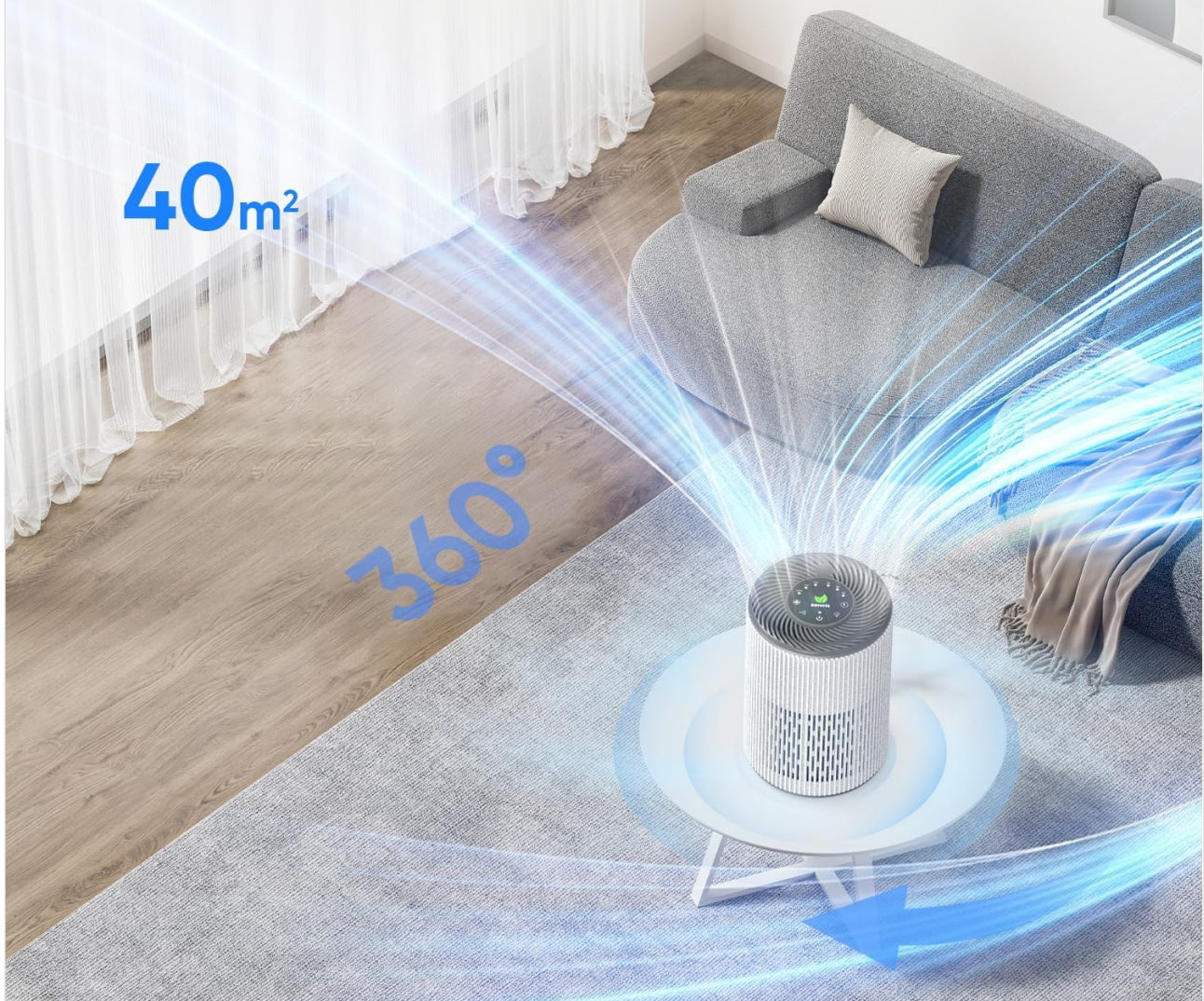
Image: The air purifier is shown in a modern living room setting, demonstrating its ability to circulate and purify air throughout a 40 square meter space with 360-degree coverage.