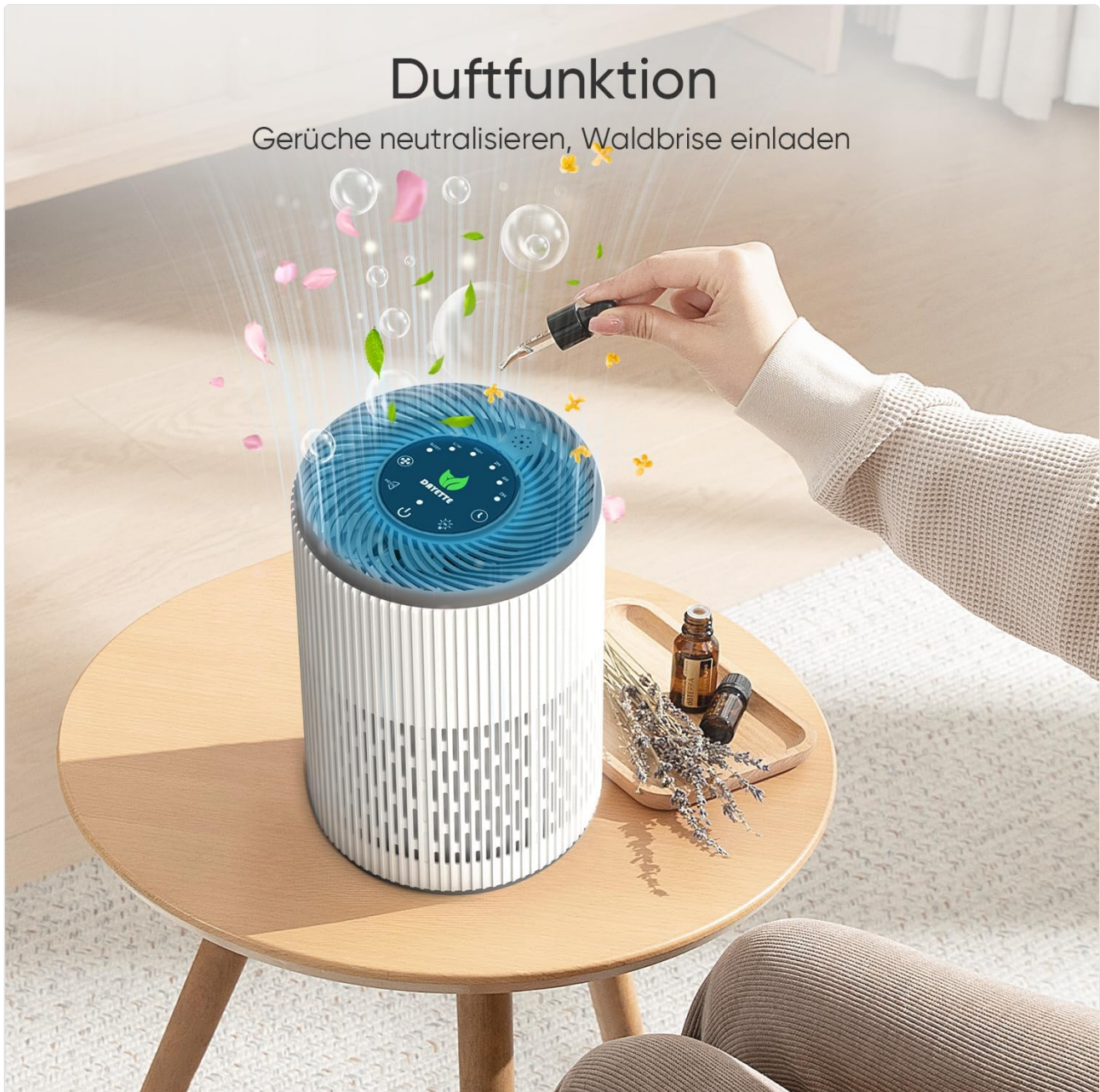
Image: A hand is shown carefully dripping essential oil onto the designated area on top of the air purifier, demonstrating how to activate the aroma diffusion feature.

Enhance your environment with soothing aromas by utilizing the integrated aroma function.