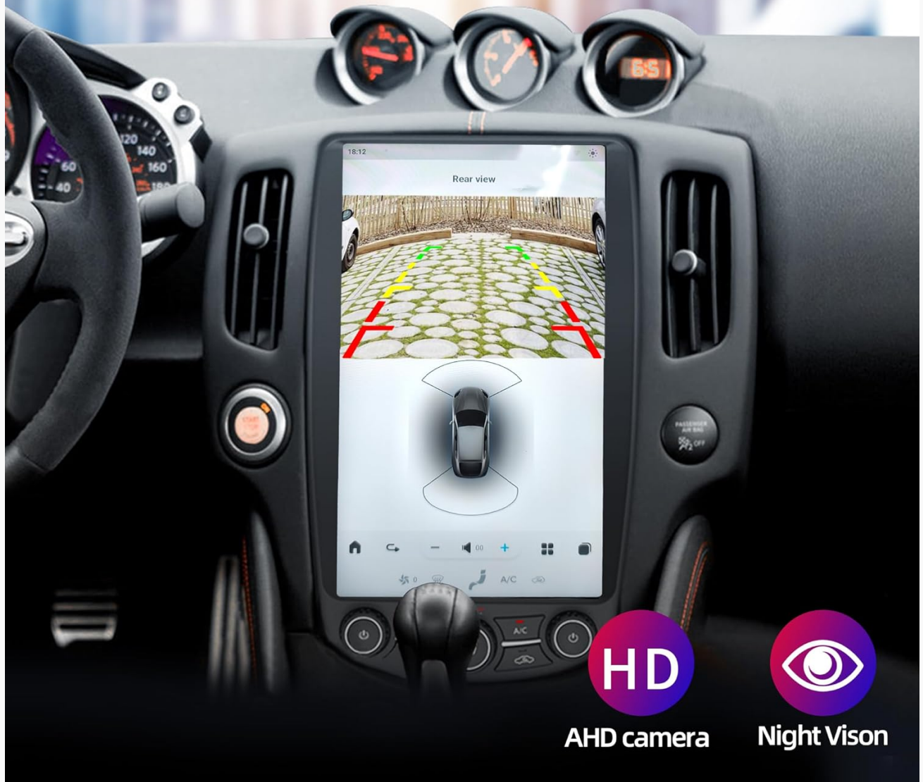
Front and back view of the AuCar head unit.

The extra-large screen displays a clear reversing image, making reversing safer