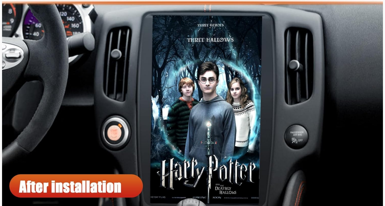
Comparison of Nissan 370Z dashboard before and after installation of the 13.6-inch AuCar head unit.

1080*1920P brings you ultimate audio-visual experience