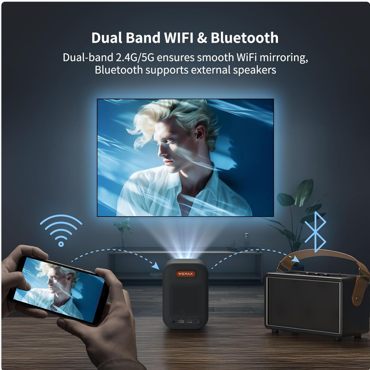
Figure 6.1: Seamless wireless connectivity for screen mirroring and external audio.