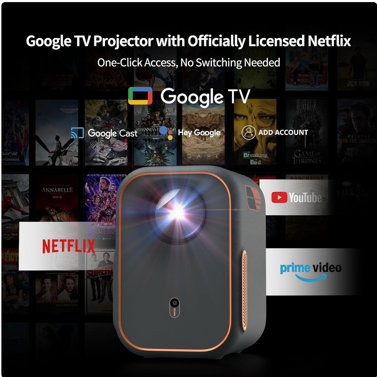
Figure 5.3: The Google TV interface provides one-click access to popular streaming services.