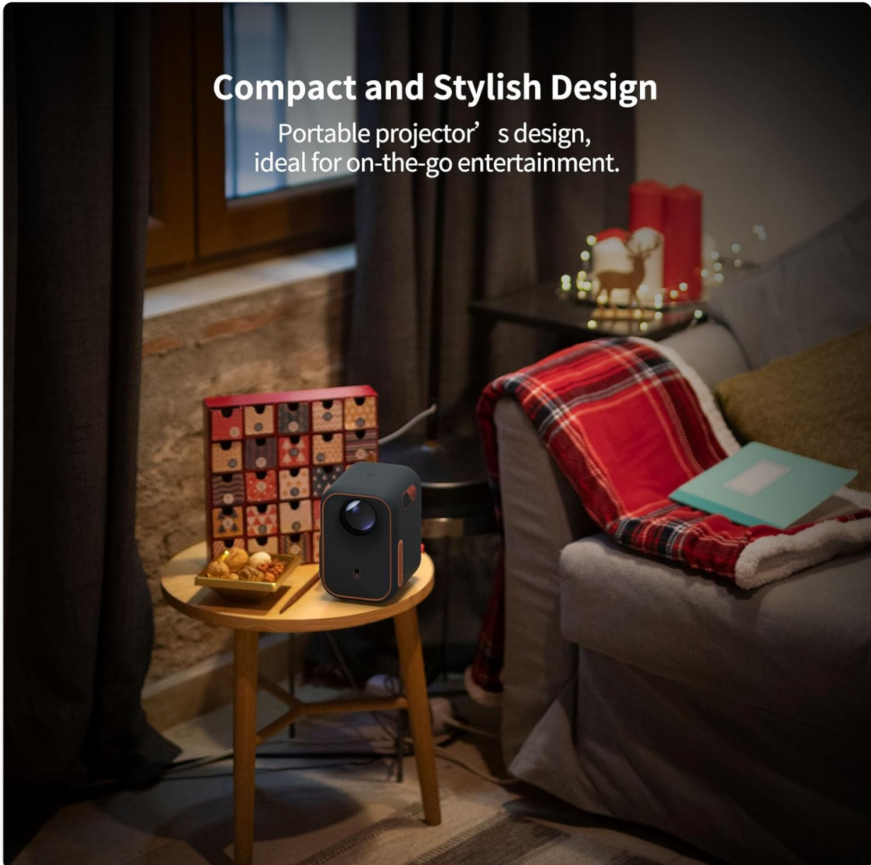
Figure 5.1: The compact design of the projector allows for flexible placement in various environments.