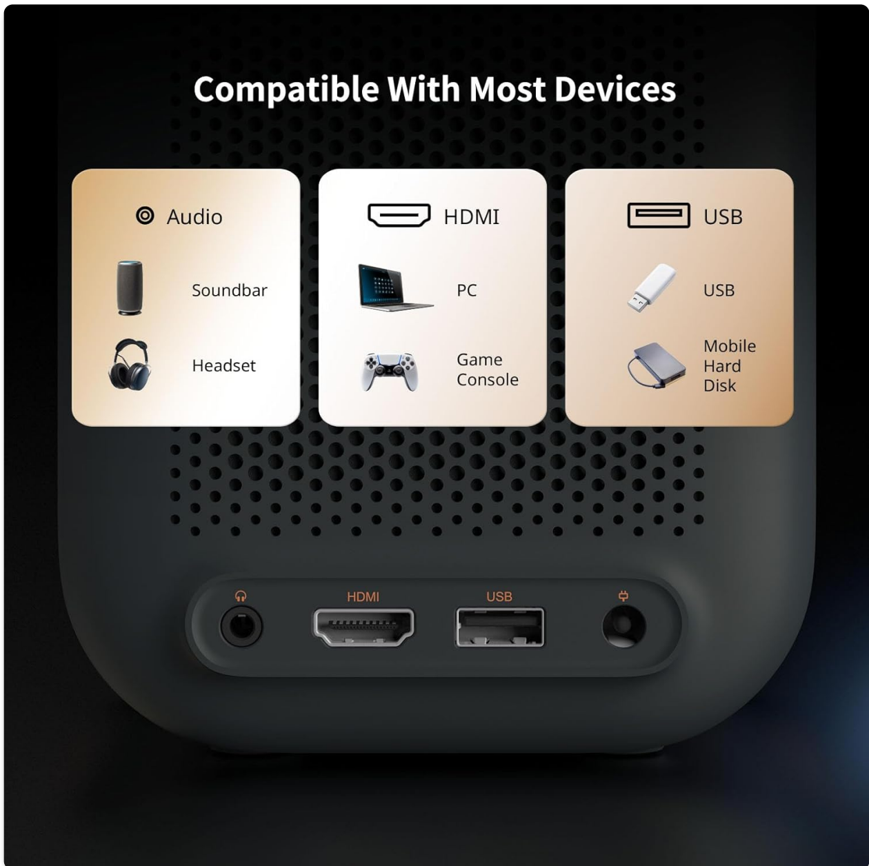
Figure 4.2: Rear panel of the projector displaying the Audio 3.5mm port, HDMI ARC port, and USB port for connecting various devices.