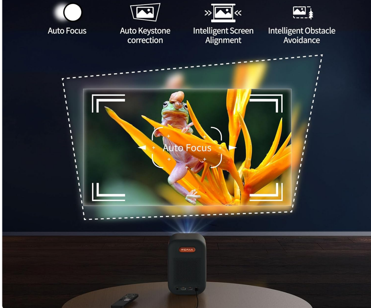
Figure 5.2: The 4-in-1 intelligent projection technology simplifies setup and ensures an optimal viewing experience.