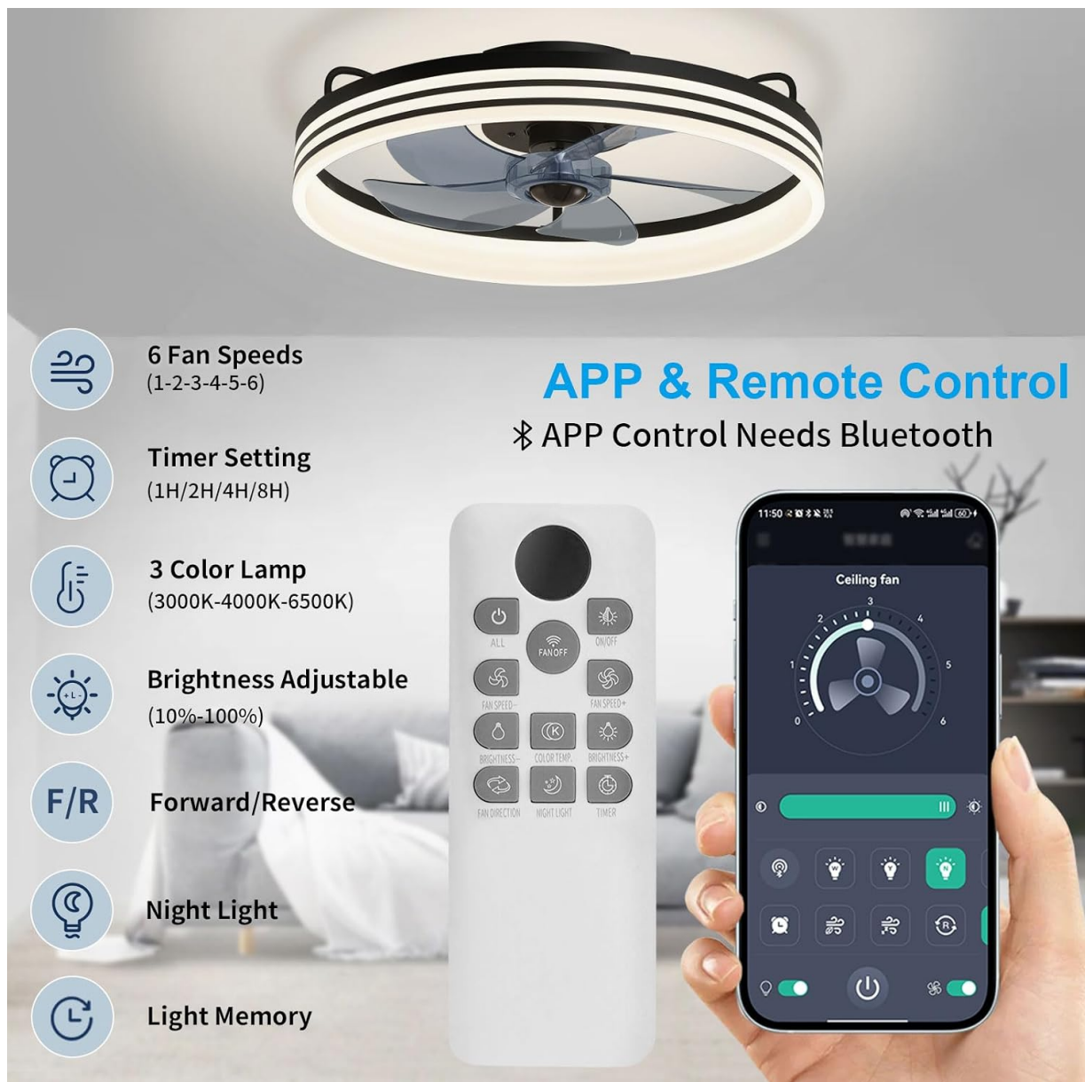
Image: The remote control and a smartphone screen showing the fan control application, highlighting various functions.