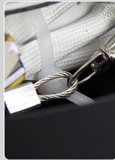
Fasten Wire Rope