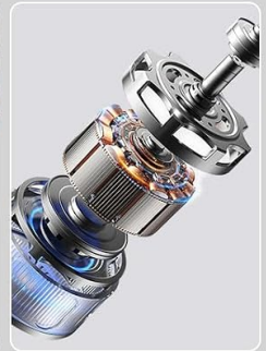
DC 100% Copper Motor

Image: Detailed view of the ceiling fan's dimensions (19.7 inches diameter, 6 inches height) and key components including acrylic lampshade, metal frame, 5 PC large fan blades, fasten wire rope, and DC 100% copper motor.