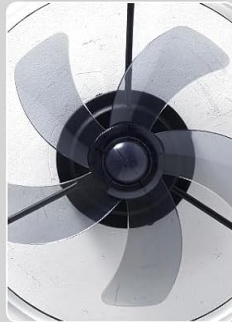
5 PC Large Fan Blades