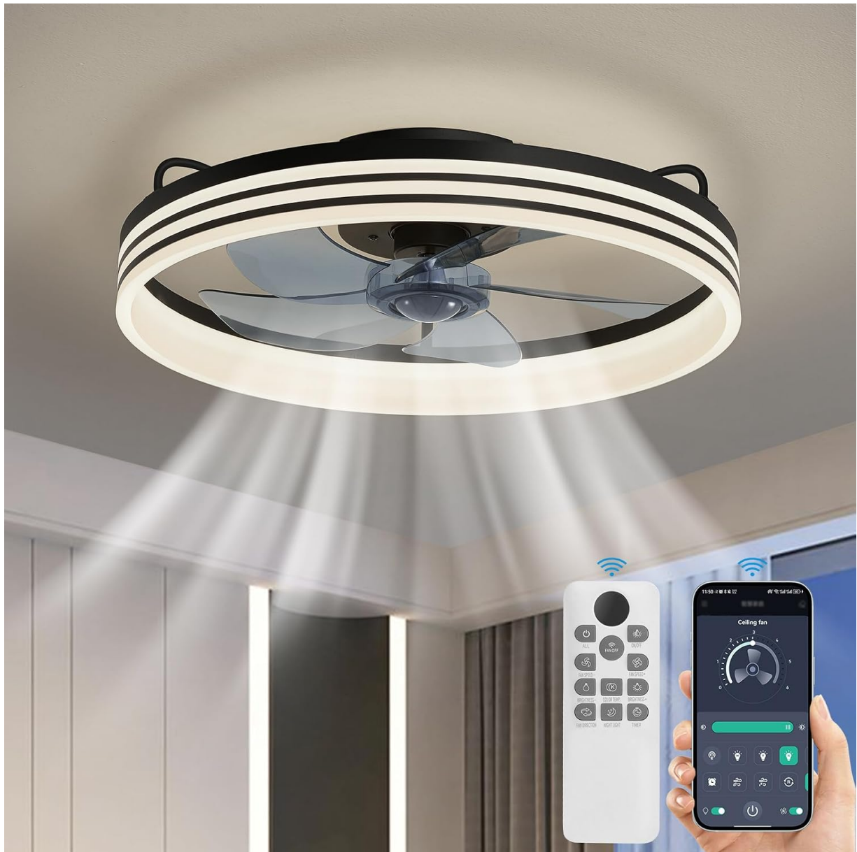
Image: The Aqonsie 19.7" Flush Mount Ceiling Fan with its remote control and a smartphone displaying the control app.