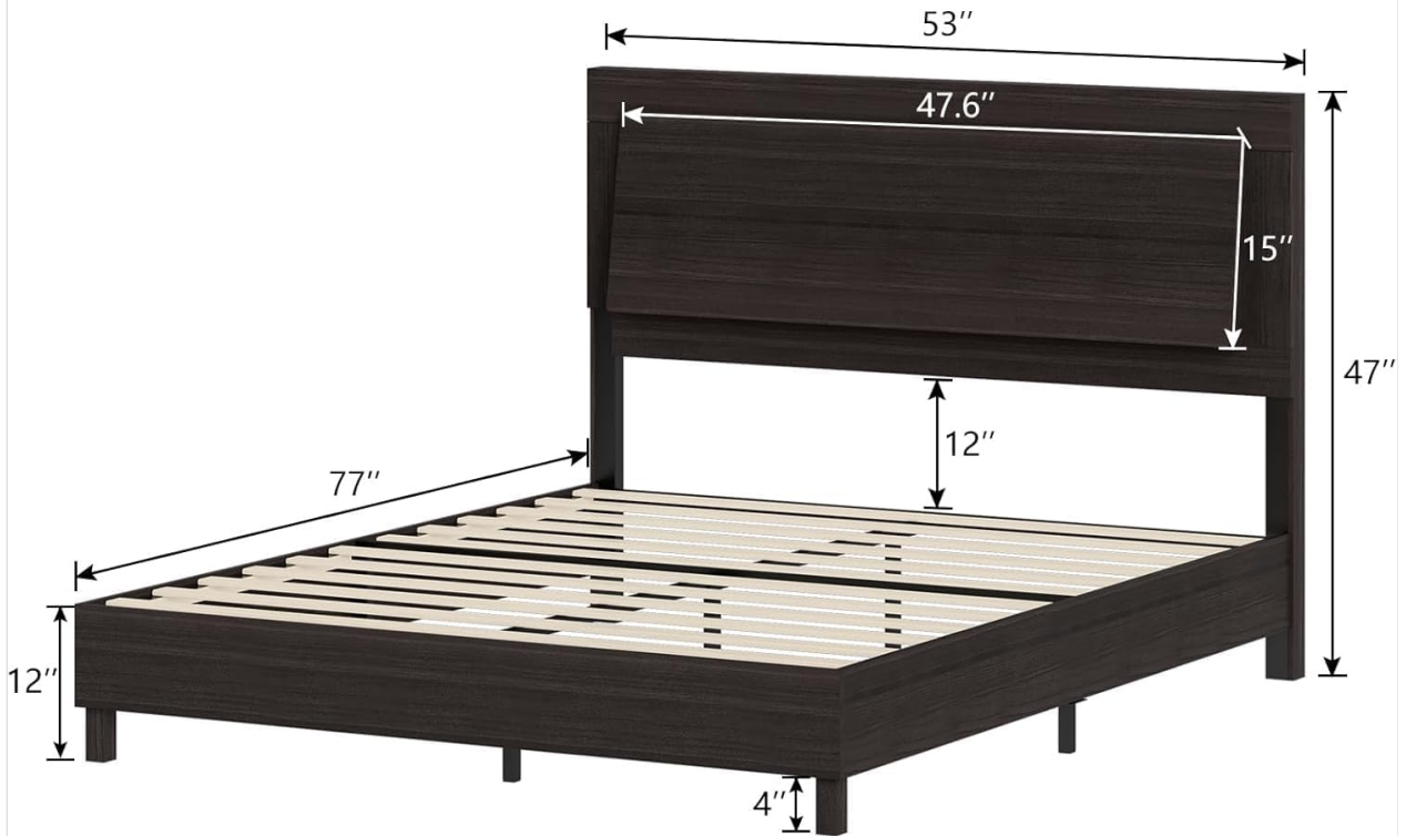
Figure 4.1: Dimensions of the LUXOAK Full Size Wood Bed Frame. The frame measures 77"L x 53"W x 47"H, with a maximum capacity of 1000 lbs and recommended mattress thickness of 10"-16".

Recommended Mattress Thickness: 10" - 16"