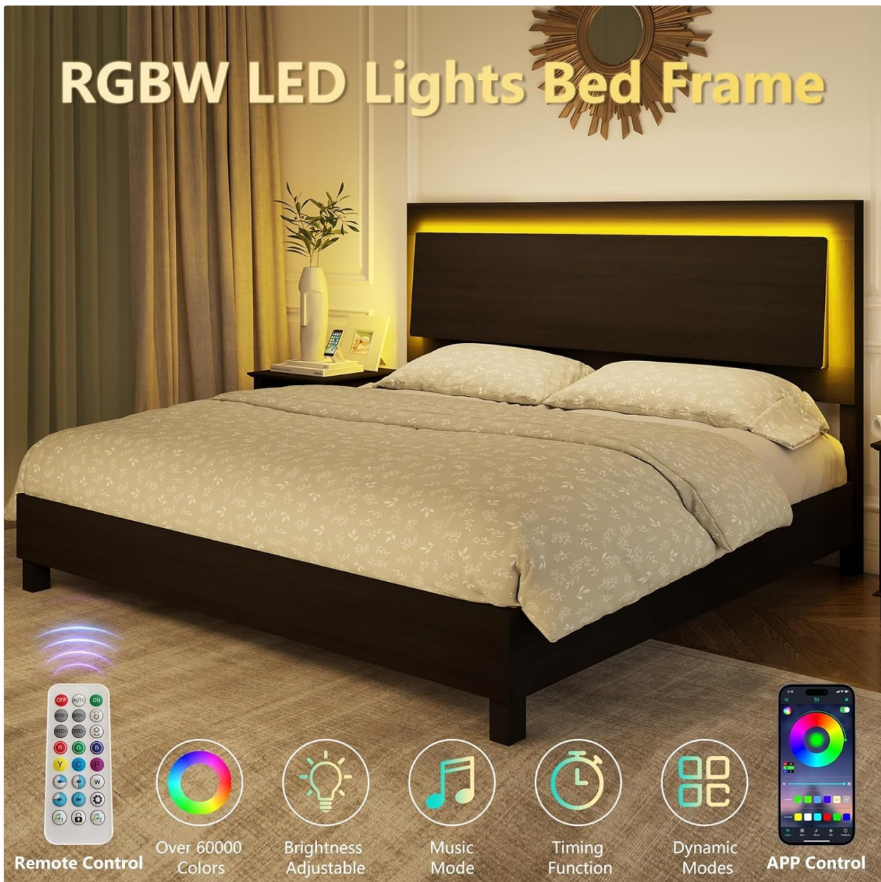
Figure 5.1: The RGBW LED lights can be controlled via the included remote or a smartphone application, offering a wide range of colors and functions.