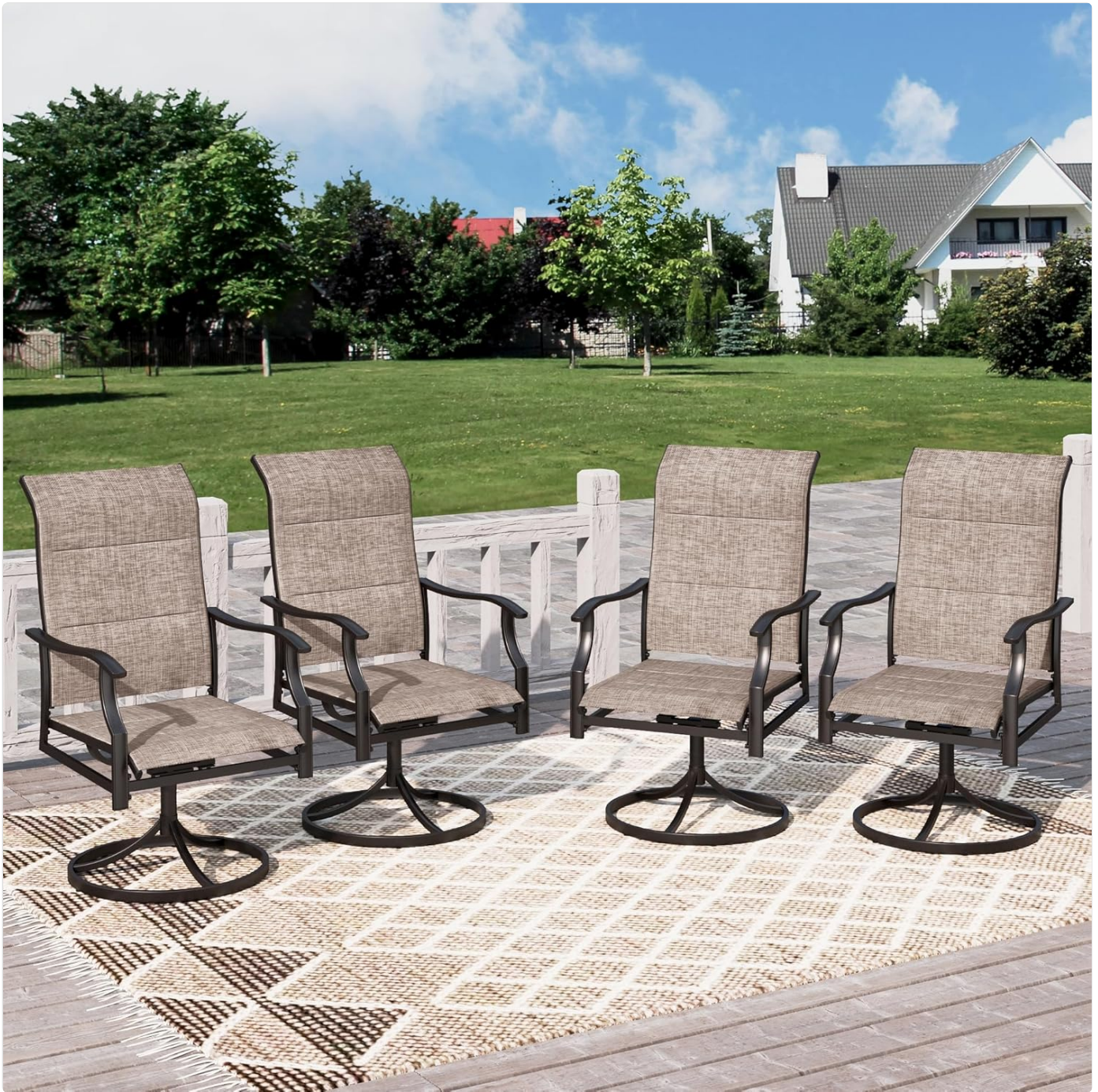
Image: Four HERA'S HOUSE Patio Outdoor Swivel High-Back Rocking Chairs. These chairs feature a high back, wide armrests, and a swivel base, designed for outdoor use on a patio or garden.