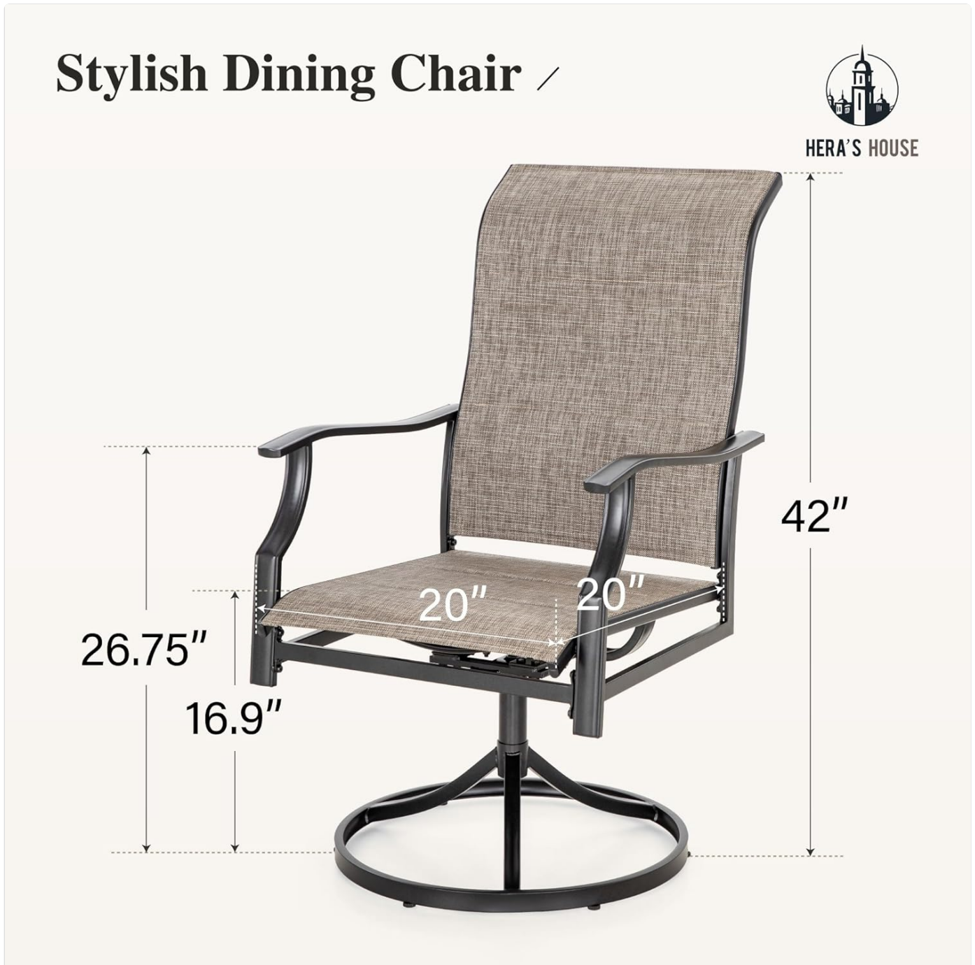
Image: Chair Dimensions. This diagram illustrates the key measurements of the chair, including its overall height of 42 inches, seat depth of 20 inches, and seat width of 20 inches, providing a clear understanding of its size.

Tip: The manufacturer notes that securing all screws first and not tightening them until everything is done can save significant time during assembly.