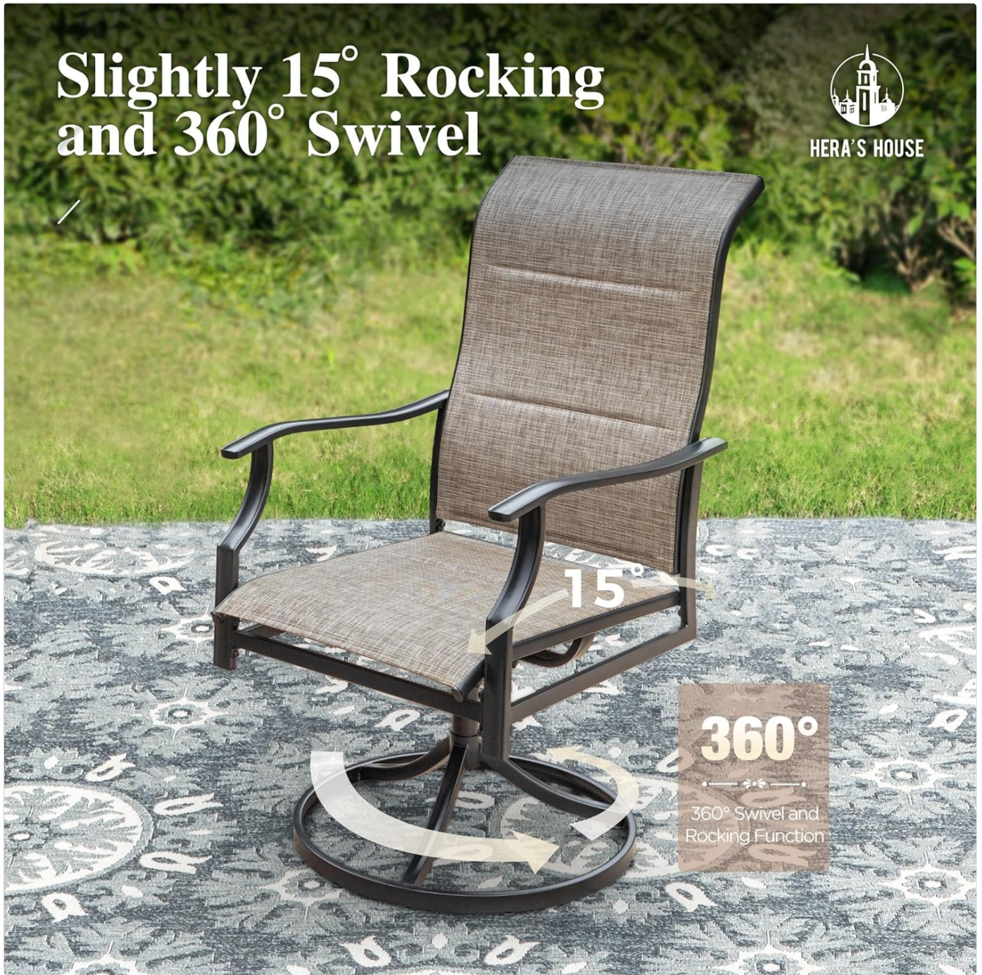
Image: Swivel and Rocking Function. This image highlights the chair's ability to swivel 360 degrees and rock gently by 15 degrees, enhancing user comfort and versatility.