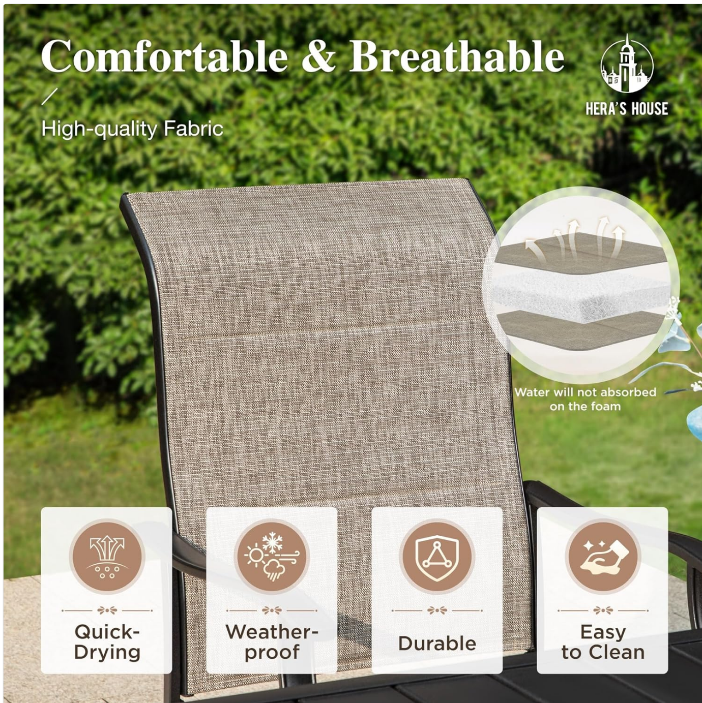
Image: Comfortable & Breathable Fabric. This image highlights the high-quality Textilene fabric used for the chairs, emphasizing its quick-drying, weather-proof, durable, and easy-to-clean characteristics.