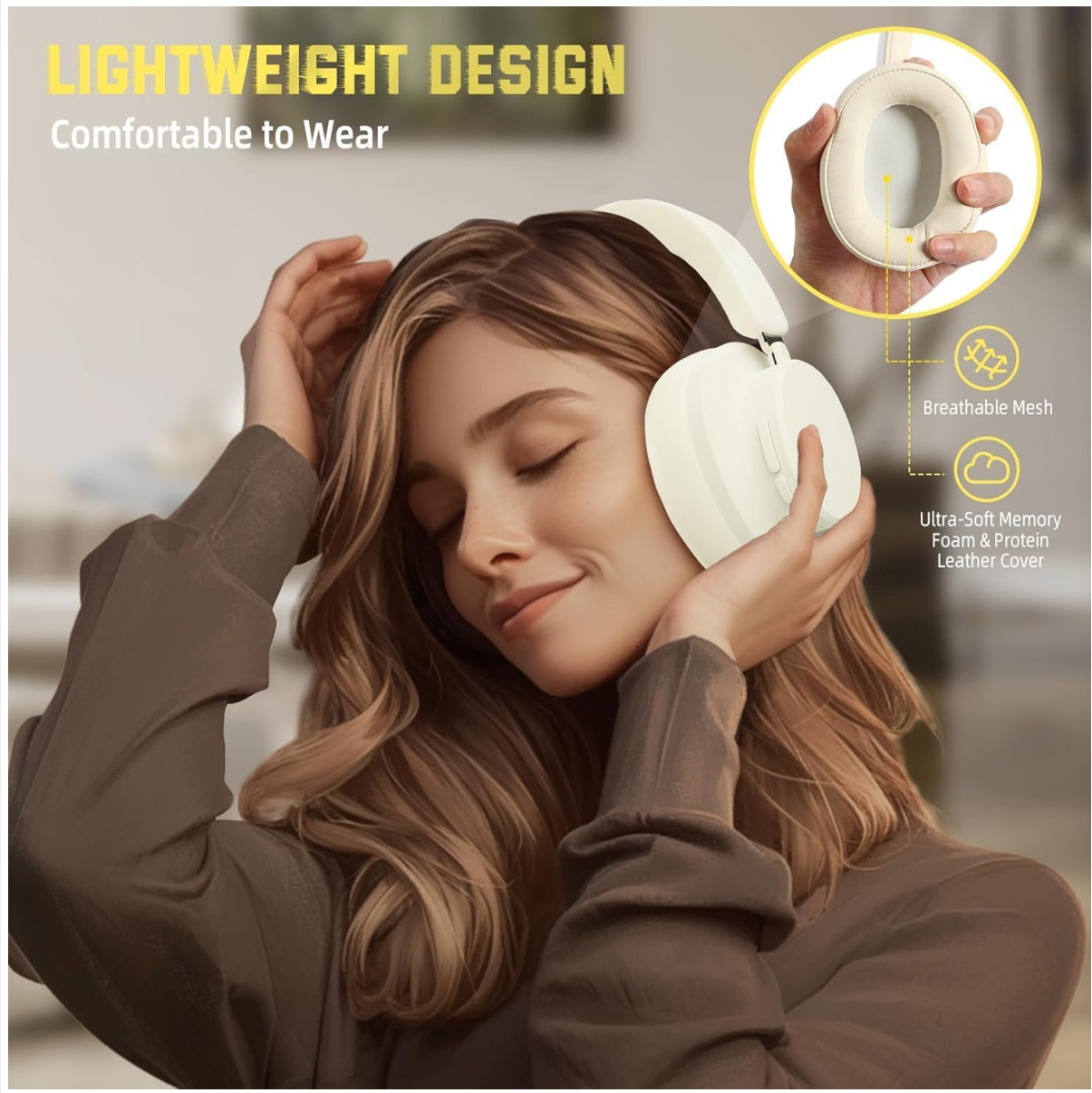
Figure 8: Rotatable earcups for easy storage

This image demonstrates the rotatable earcups, which allow the headphones to be folded flat for convenient storage and portability.