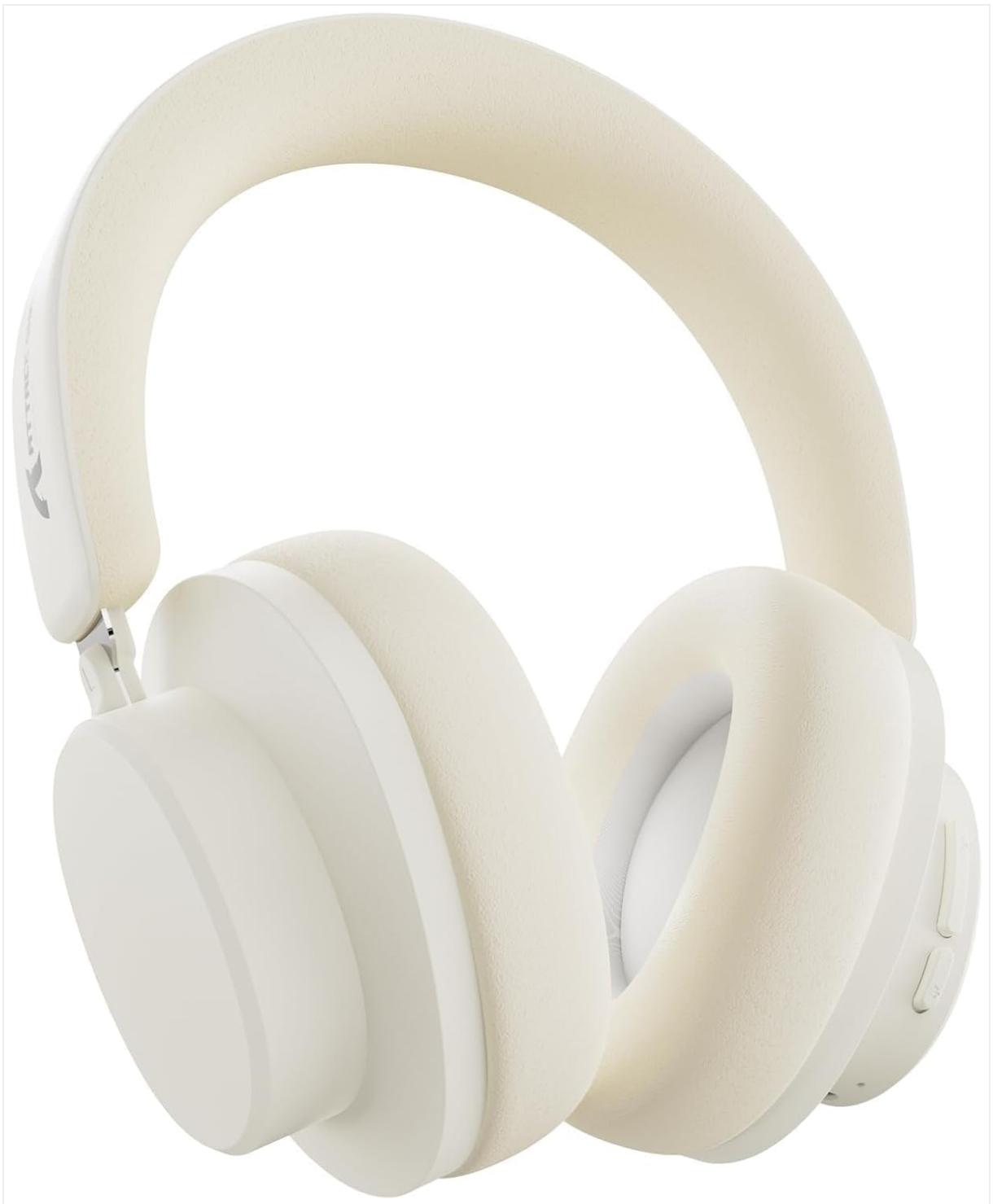
Figure 1: ATTACK SHARK G500 Wireless Over-ear Noise Canceling Headphones (Beige)

The image displays the ATTACK SHARK G500 headphones in a beige color, highlighting their over-ear design and cushioned earcups.