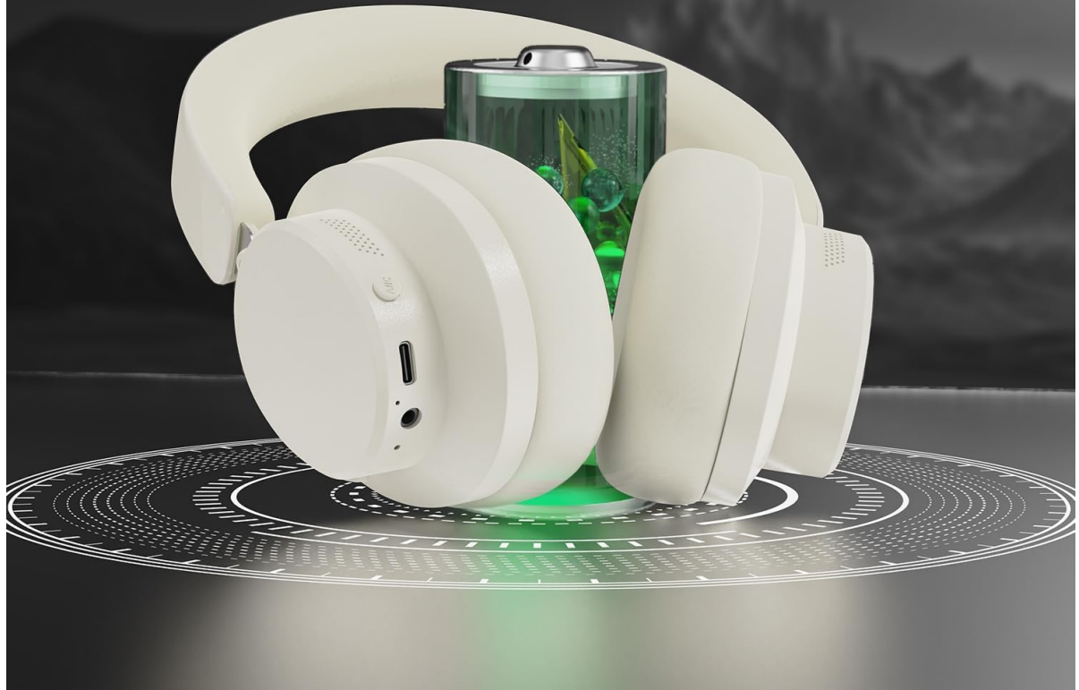
Figure 3: Location of the charging port and LED indicator

This image highlights the USB Type-C charging port and the LED indicator on the headphone earcup, essential for monitoring charging status.