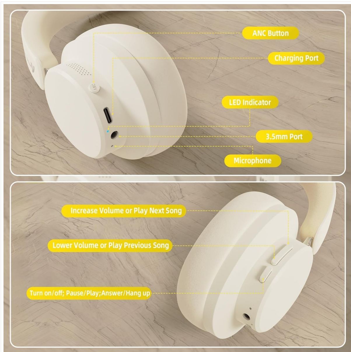
Figure 4: Visual representation of headphones charging

The image illustrates the headphones connected to a power source, with a battery icon indicating the charging process.