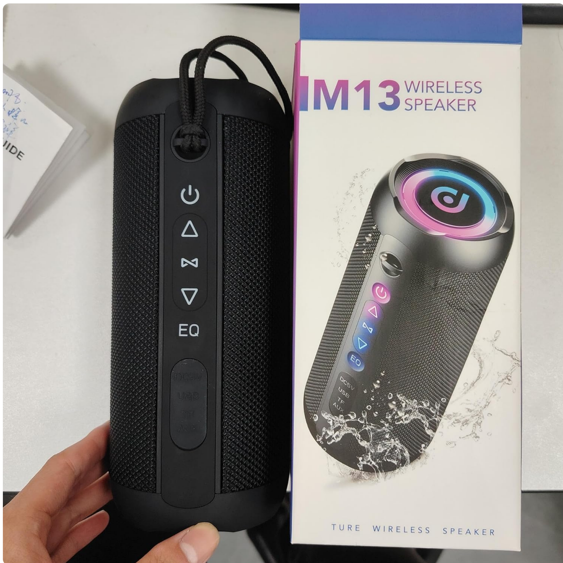
The speaker and its packaging, including the quick start guide.