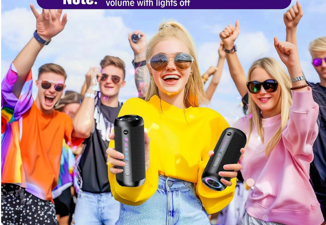
Illustration of the speaker's long battery life, suitable for extended use.

Note: Up to 24 hours of playback at 50 per cent volume with lights off