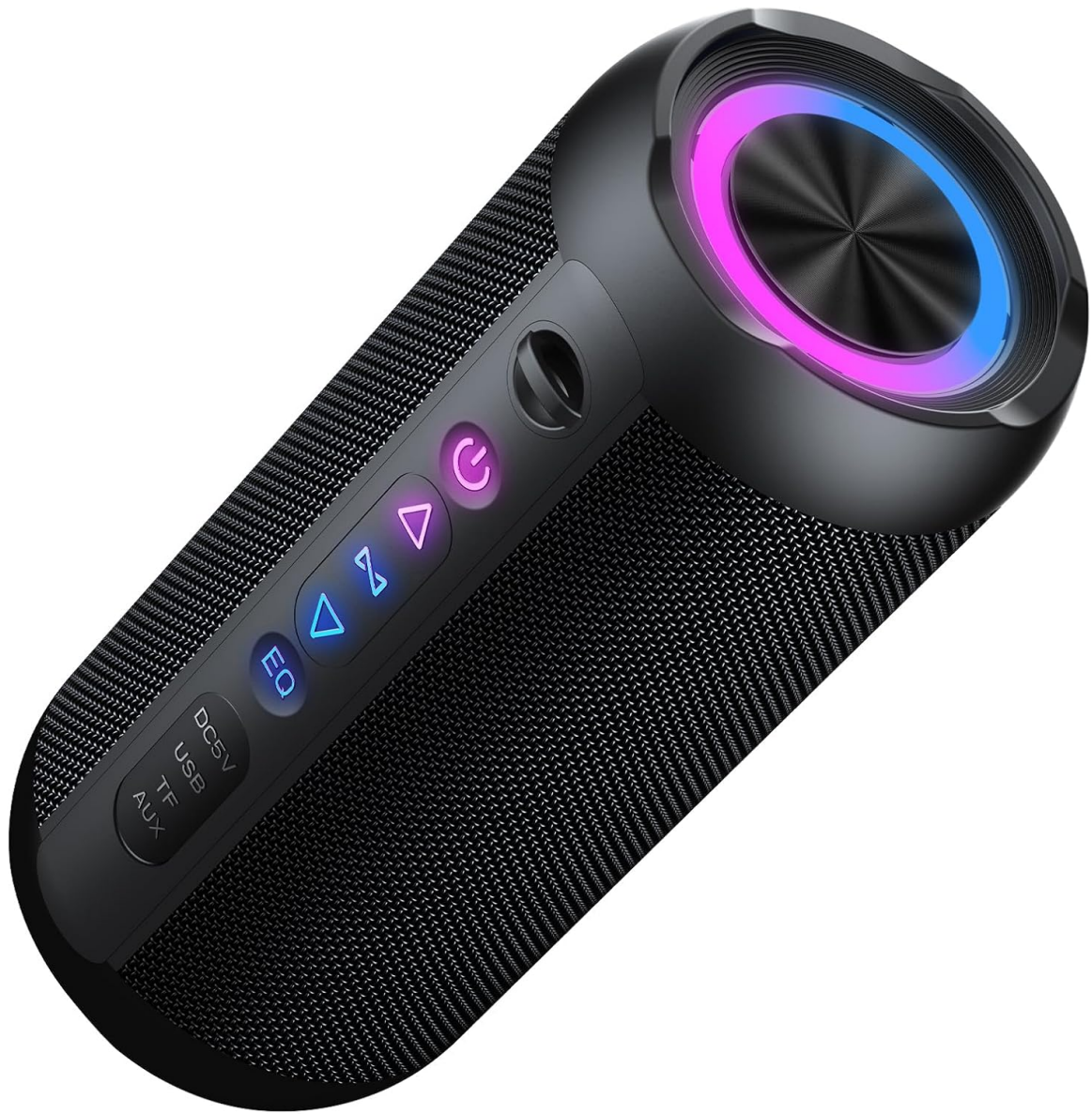
The taopodo M13-BK Bluetooth Speaker, showcasing its sleek design and control buttons.