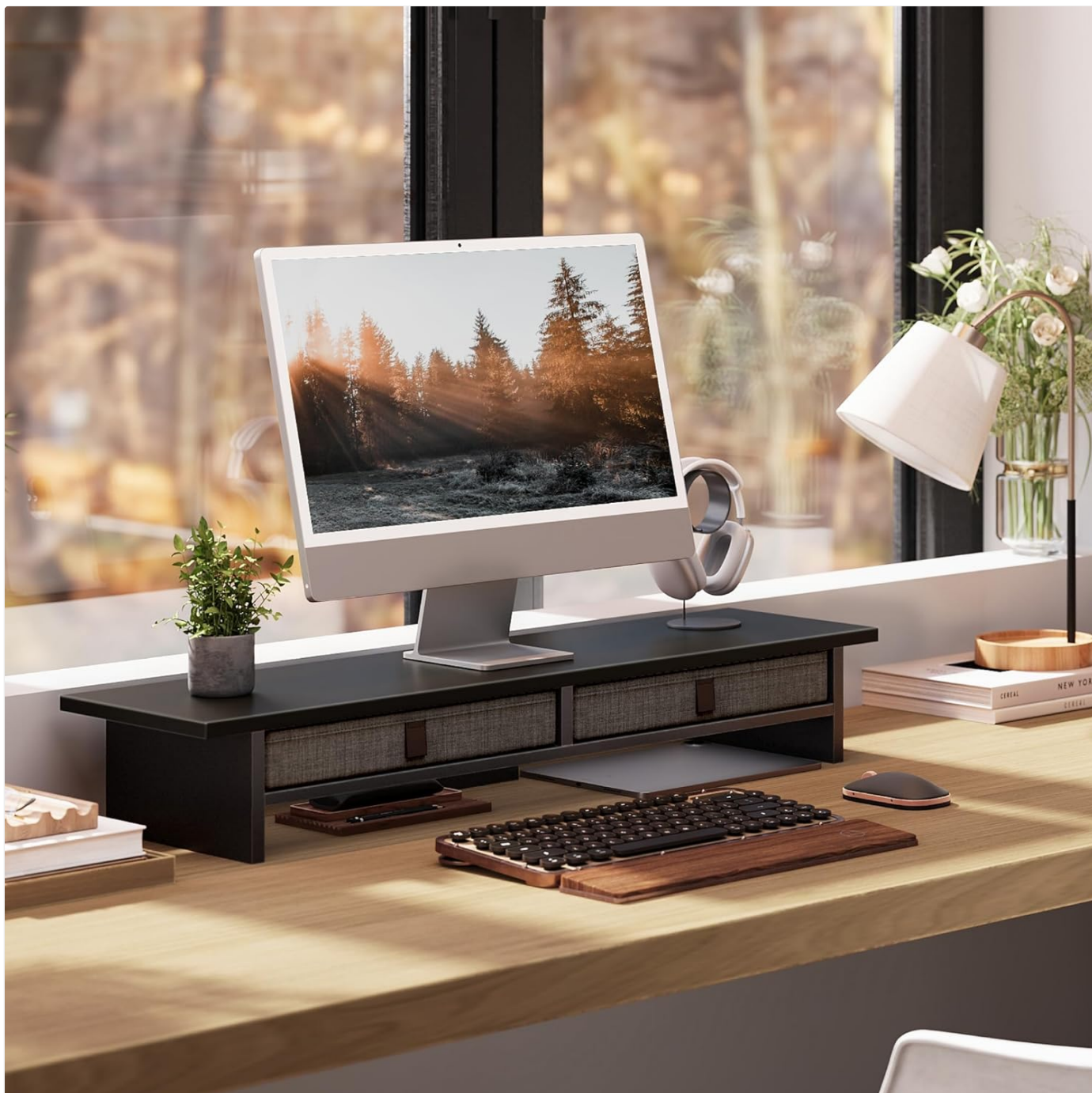
Image: The Fenge Dual Monitor Stand in a modern office setting, showcasing its design and functionality with a single monitor, headphones, and a small plant.