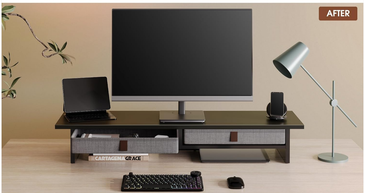
Image: A visual comparison of a desk before and after implementing the monitor stand, highlighting the significant improvement in desktop organization and space utilization.