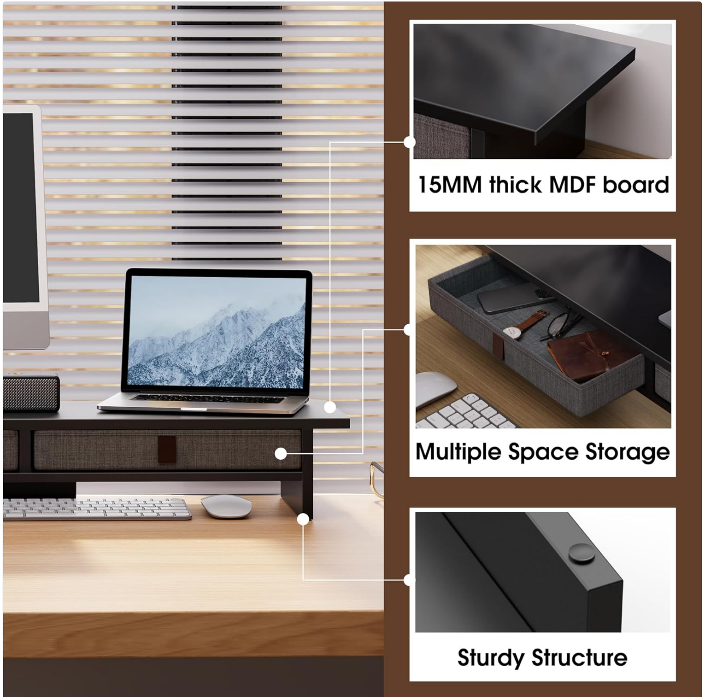
Image: Details of the stand's construction, highlighting the 15mm MDF board, the fabric drawers for storage, and the overall sturdy design.