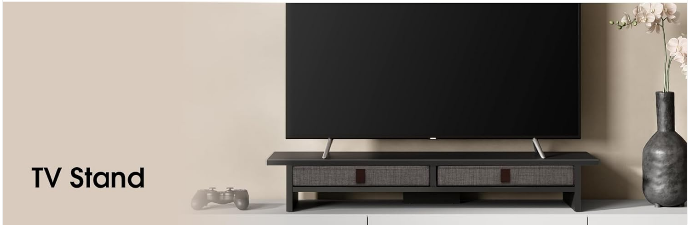
Image: Various usage scenarios demonstrating the versatility of the monitor stand, including supporting dual monitors, a printer, and functioning as a TV stand.