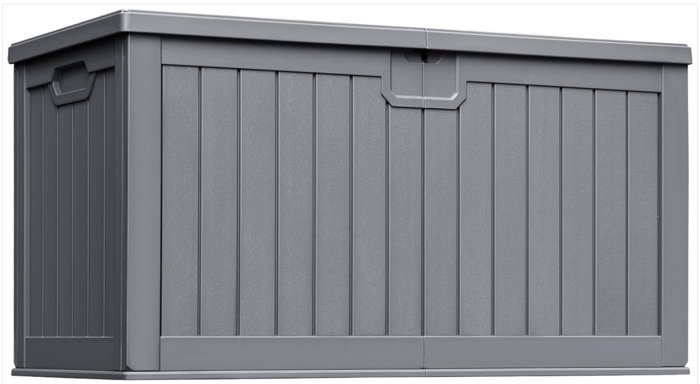
Figure 1: The Greesum 230 Gallon Outdoor Storage Box in its closed state, showcasing its gray finish and vertical panel design.

Thank you for choosing the Greesum 230 Gallon Outdoor Storage Box. This manual provides essential information for the proper assembly, operation, maintenance, and troubleshooting of your new storage box. Please read this manual thoroughly before use and retain it for future reference.