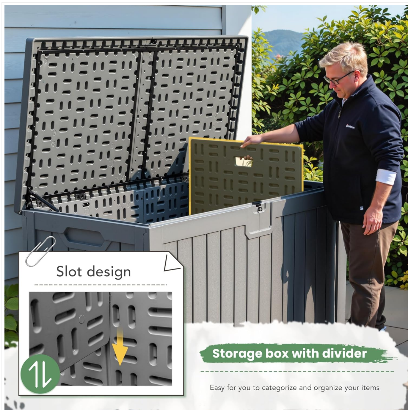
Figure 2: Illustrates the installation of the removable divider, allowing for customized storage organization within the box.