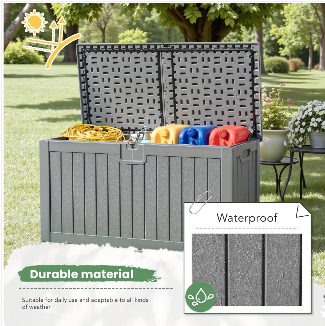
Figure 5: A close-up view of the box's durable, waterproof material, demonstrating its resistance to moisture.