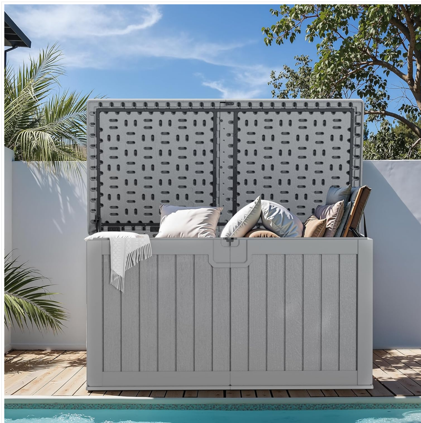
Figure 3: The storage box with its lid fully open, demonstrating its large capacity suitable for storing multiple patio cushions and other outdoor essentials.