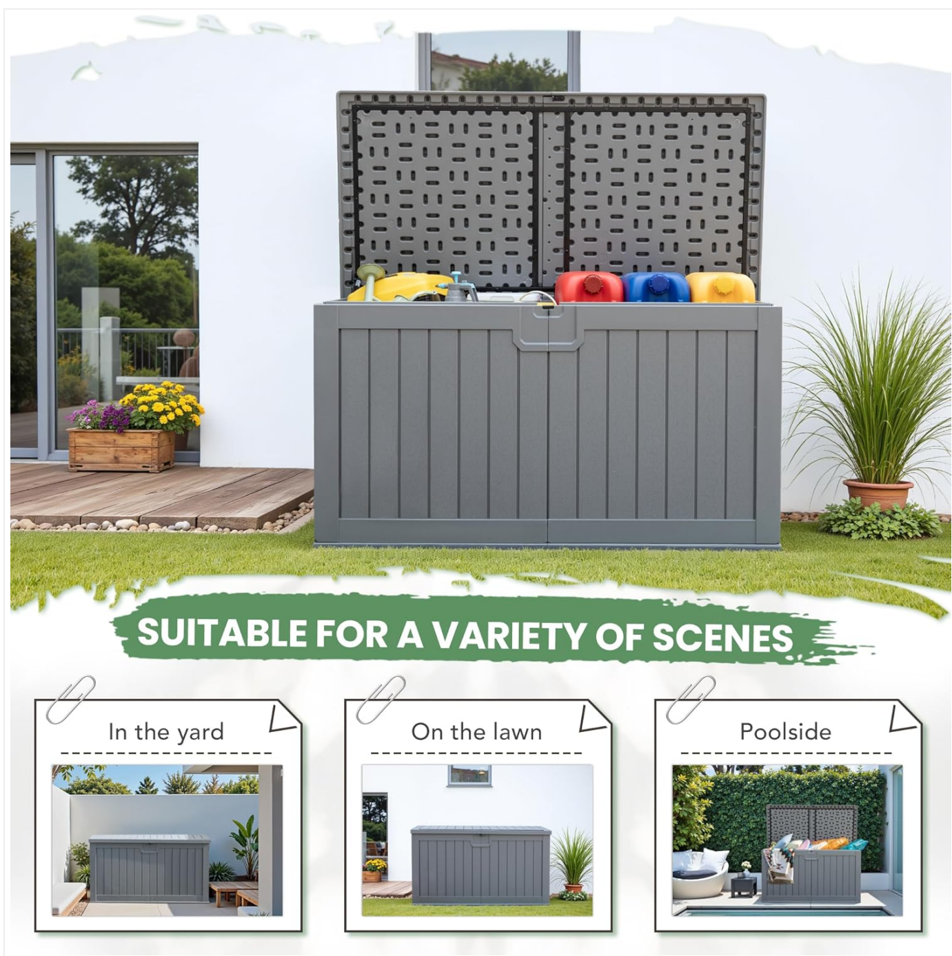
Figure 4: Examples of suitable placements for the storage box, including in a yard, on a lawn, or by the poolside, highlighting its versatility.