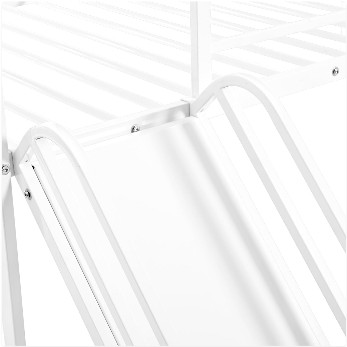
Image 4.3: Base of the slide, showing its connection to the floor.