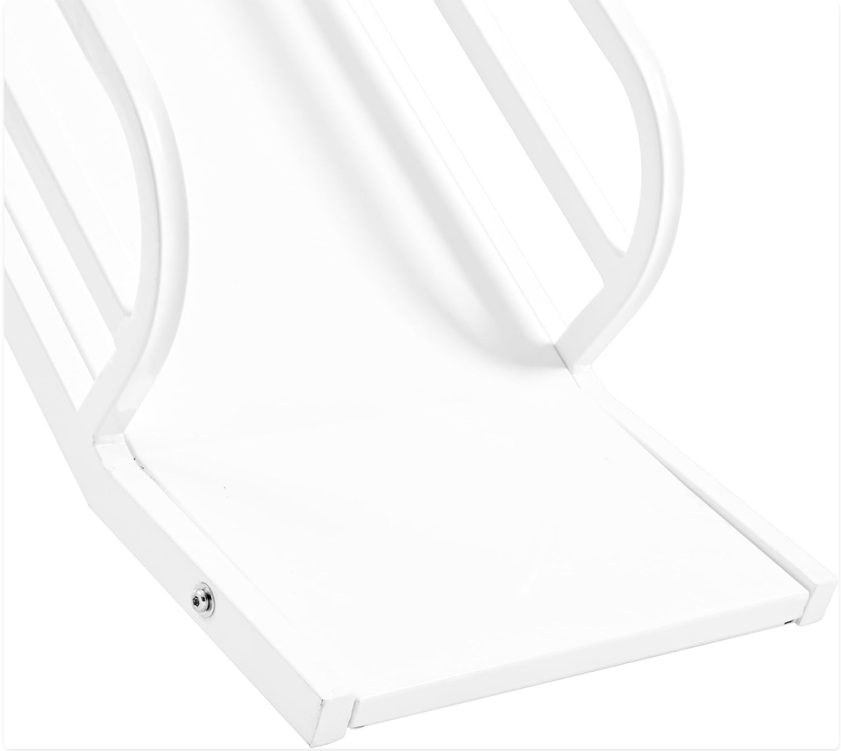
Image 4.1: Detail of ladder and slide attachment to the bed frame.