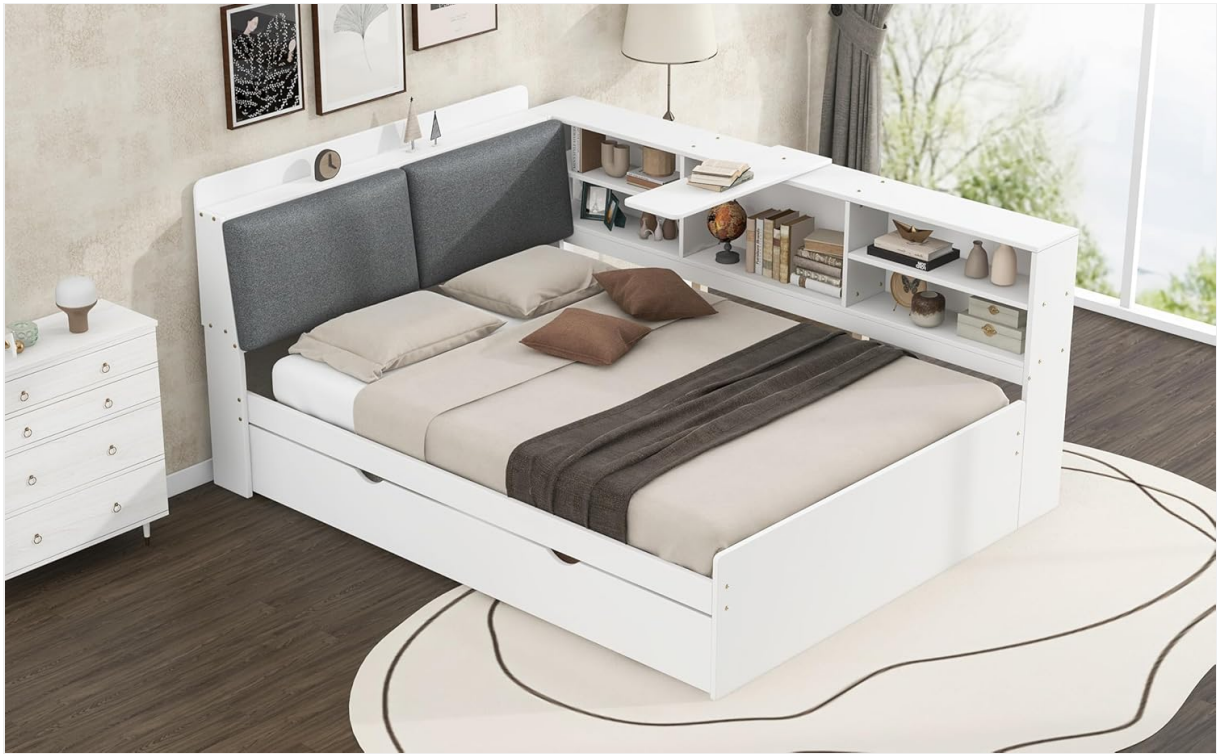
Image: The trundle bed extended and the rotatable storage board in an open position.