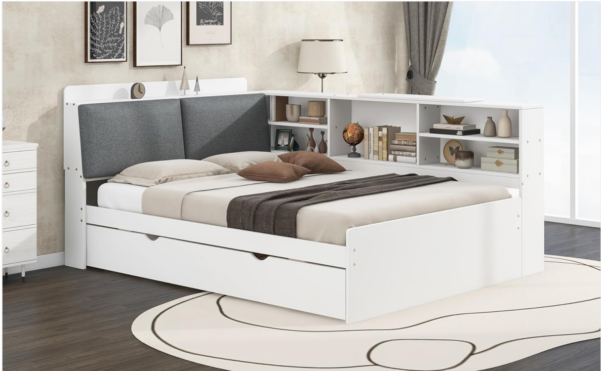
Image: The trundle bed extended from beneath the main bed frame.

The trundle bed is designed to slide out from underneath the main bed frame, providing an additional sleeping surface. To use, gently pull the trundle frame outwards from the main bed. To store, push it back underneath until it is fully recessed.