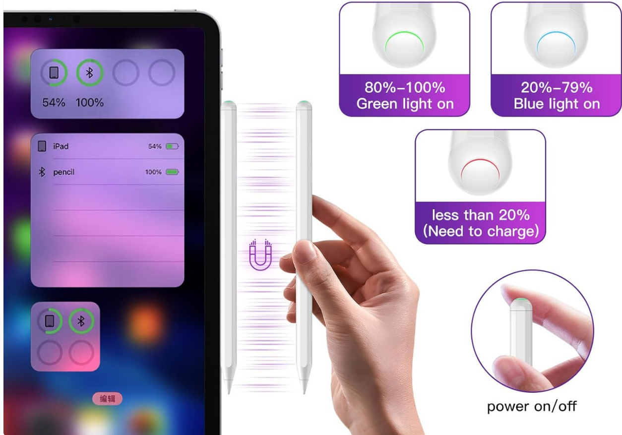
Image 3.1: Magnetic attachment and charging process of the stylus pen on an iPad.

* Requires the devices support magnetic wireless charge