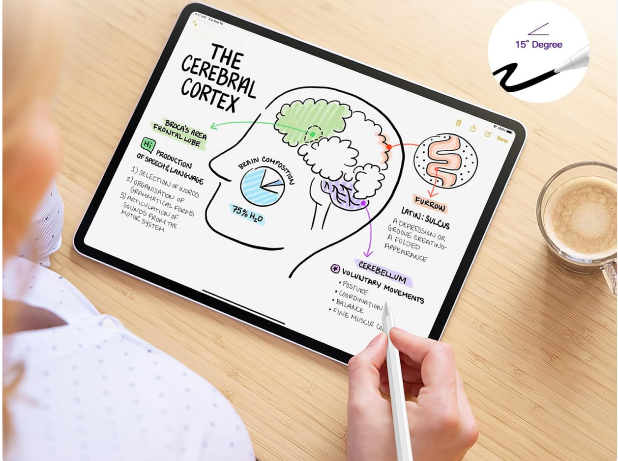
Image 4.2: Visual representation of how tilt angle affects line thickness and shading.