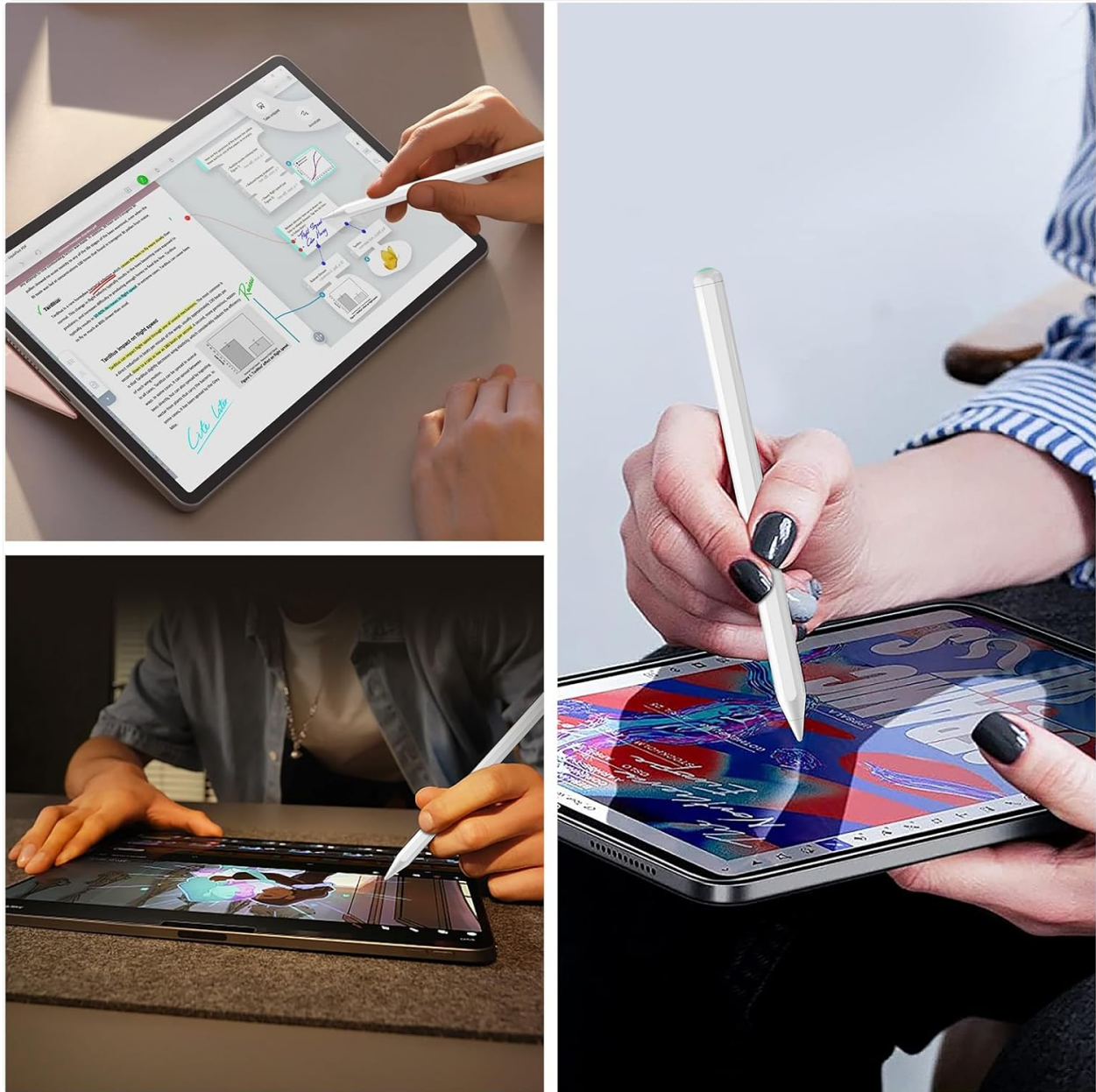
Image 4.3: Examples of the stylus pen in use for different tasks on an iPad.