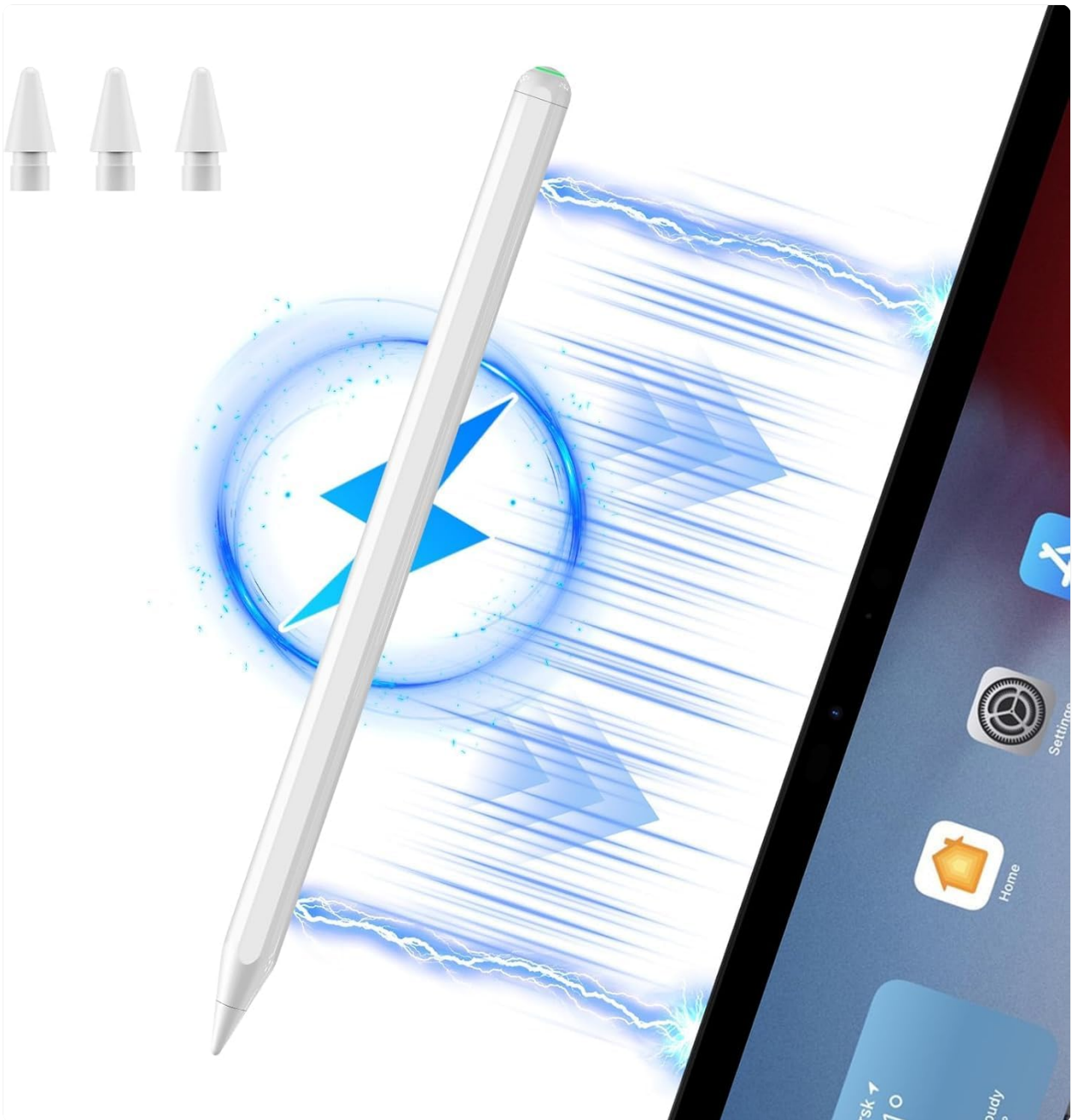
Image 1.1: JEDOUBAL Stylus Pen with magnetic charging indication and included replacement tips.