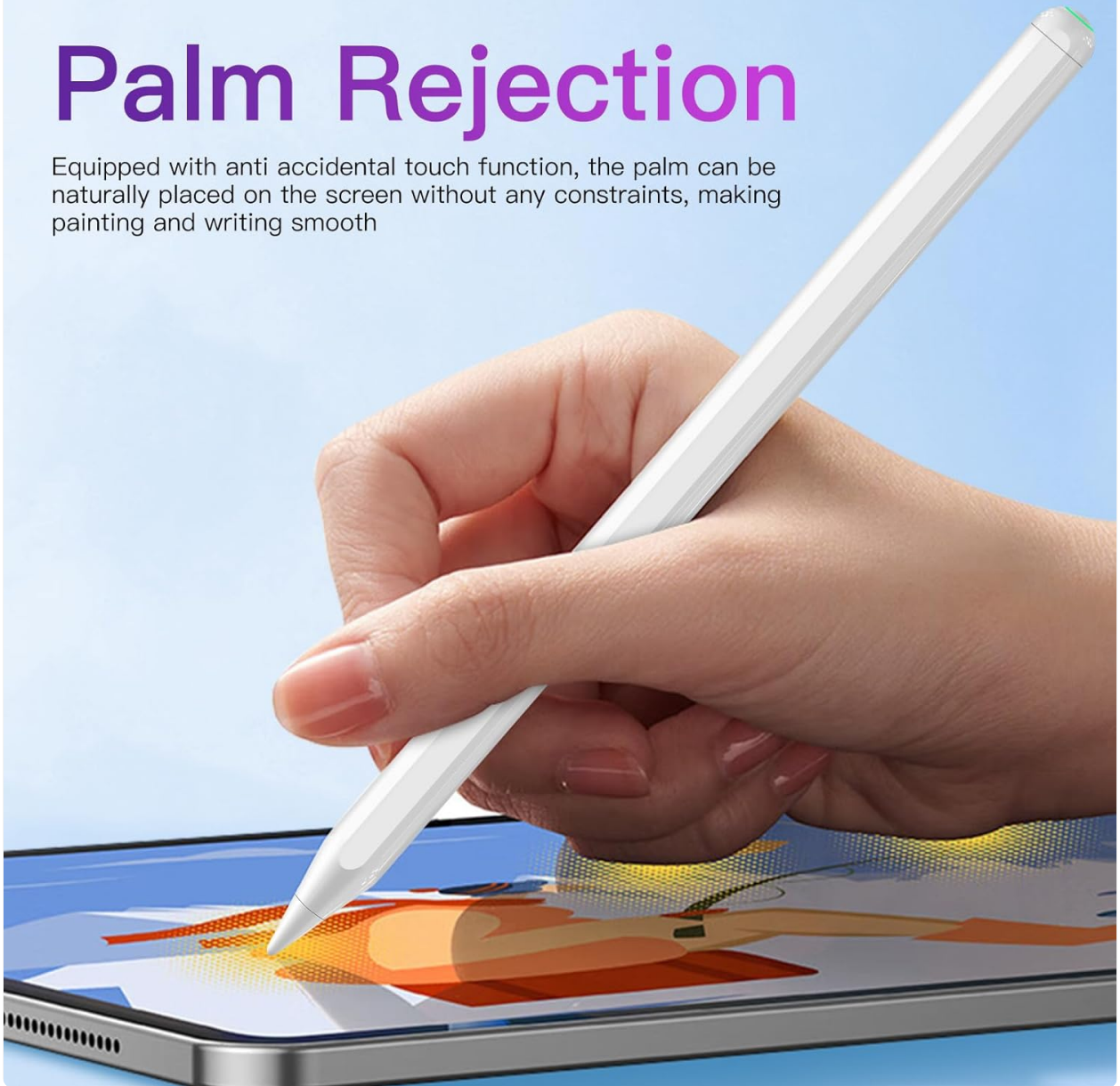
Image 4.1: User demonstrating palm rejection while writing on an iPad with the stylus pen.

Equipped with anti accidental touch function, the palm can be naturally placed on the screen without any constraints, making painting and writing smooth