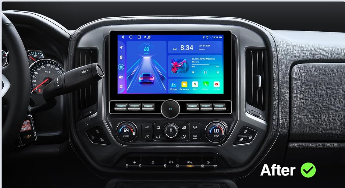
Figure 3.1: Comparison of the dashboard before and after installing the AINAVITO car stereo.