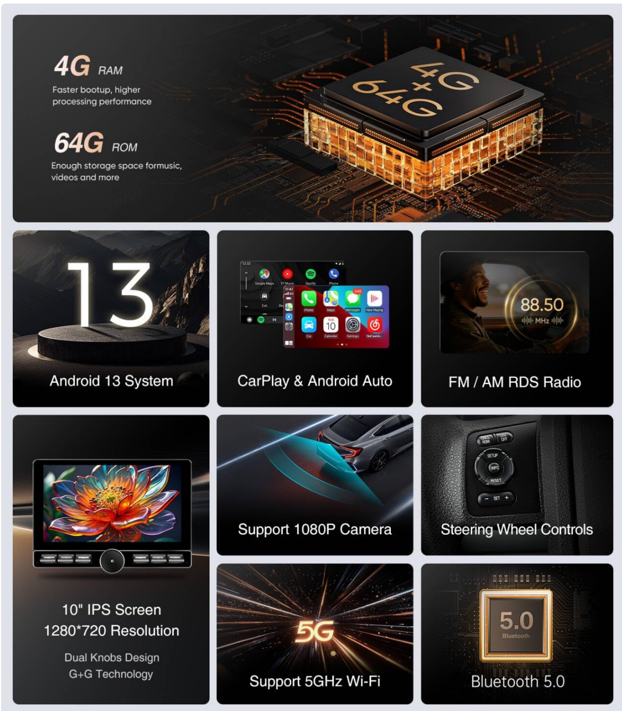
Figure 4.2: Overview of key features including Android 13, CarPlay, Android Auto, and connectivity options.