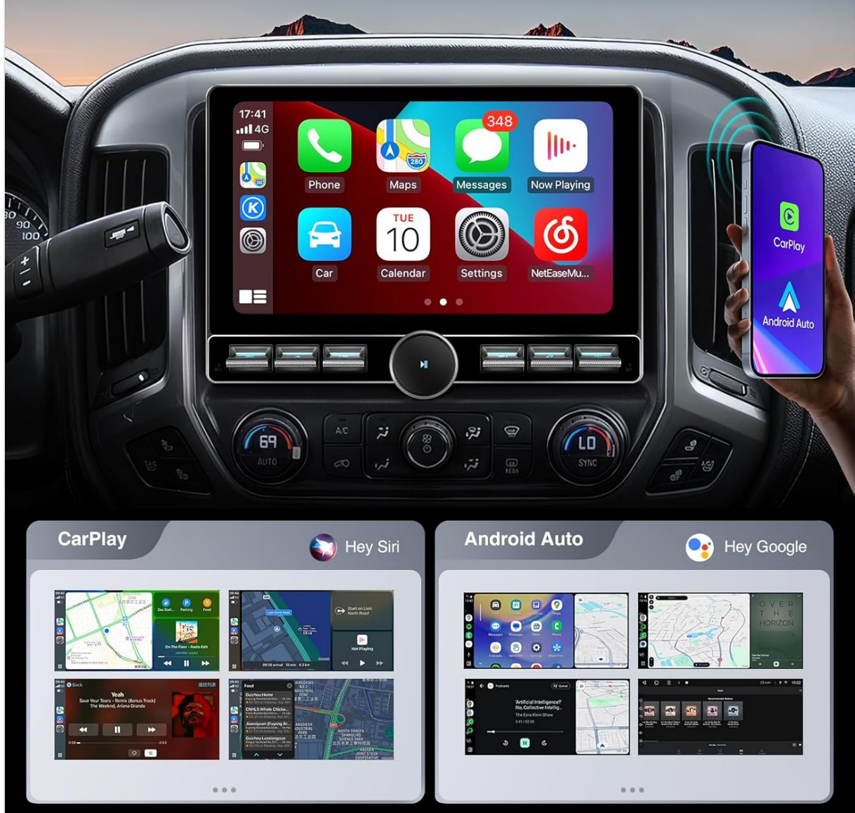
Figure 4.3: Wireless CarPlay and Android Auto interfaces displayed on the car stereo.

Your browser does not support the video tag.