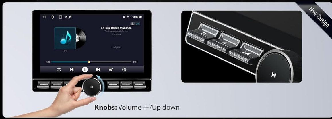
Figure 4.1: The 10-inch QLED touchscreen with physical knob and keybuttons for intuitive control.