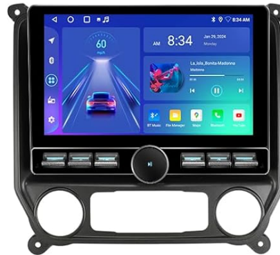
Frame + Head Unit