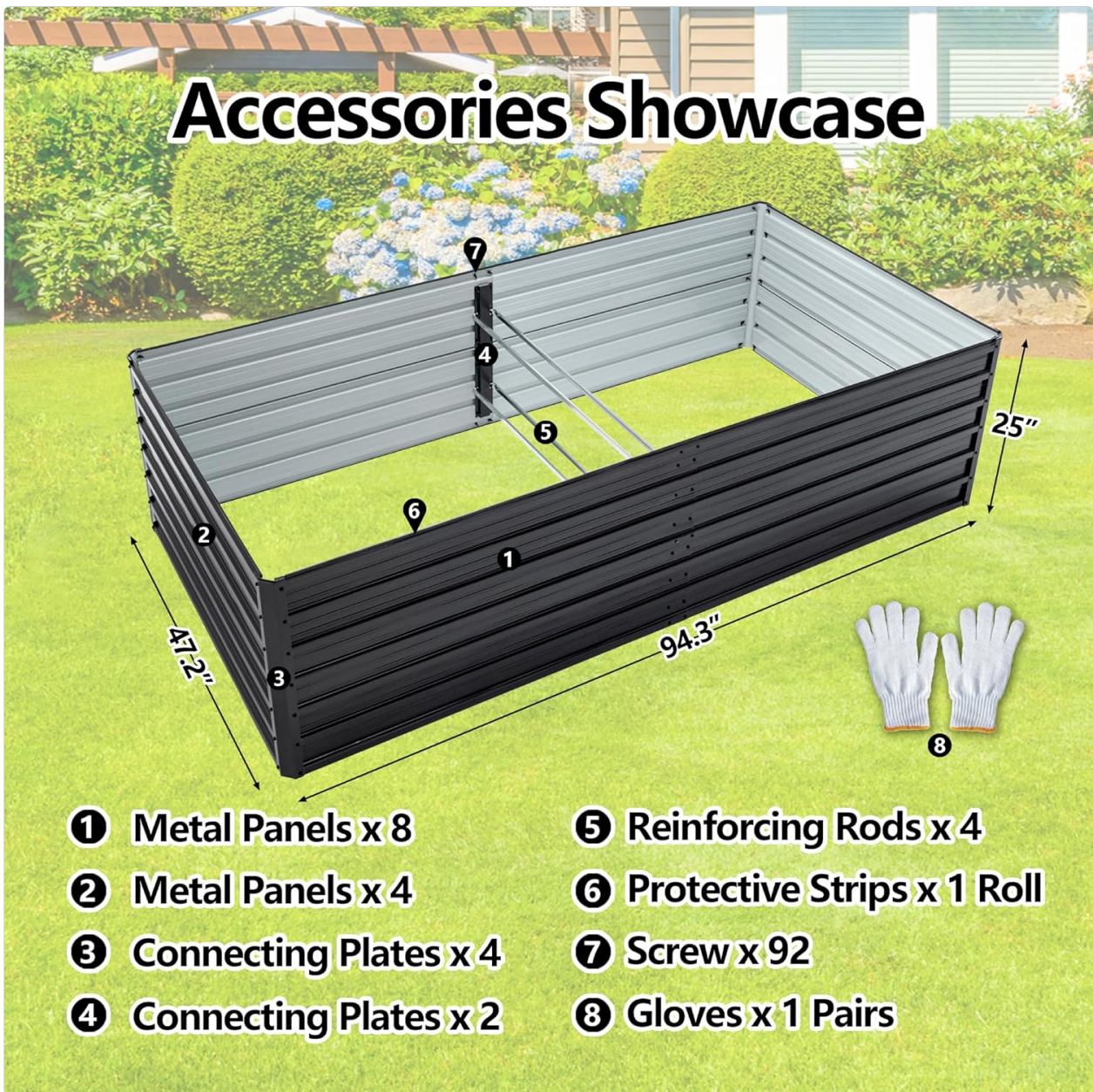
Image: Overview of all included components for the raised garden bed.