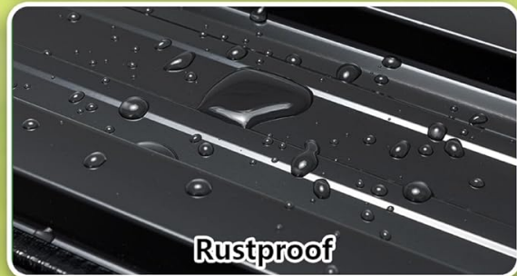
Image: Various structural details of the garden bed, including wave shape, stable connections, and rustproof finish.