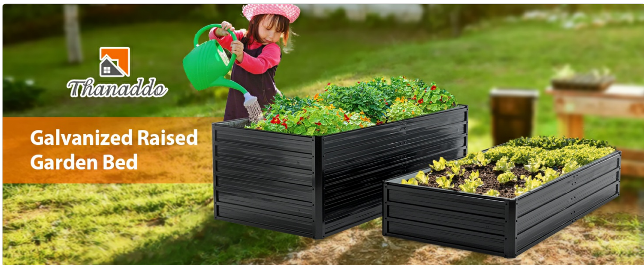
Image: Close-up views of different plants thriving in the garden bed.