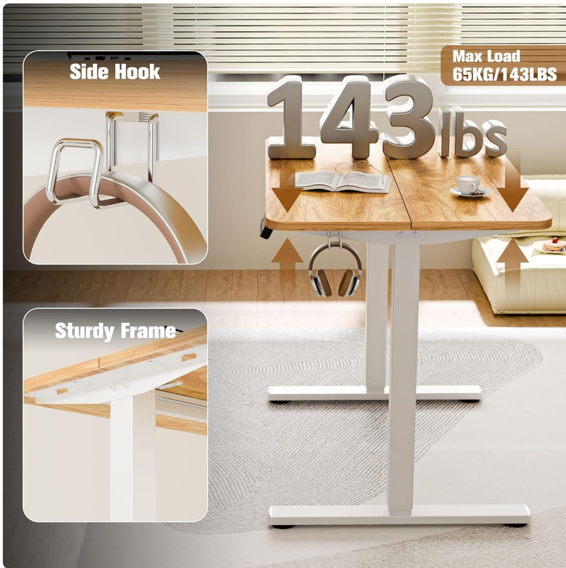
Image: Two metal side hooks attached to the desk frame, useful for hanging headphones or bags, keeping the desktop clear.

Two integrated side hooks offer a practical solution for hanging headphones, bags, or other accessories, helping to keep your workspace organized.