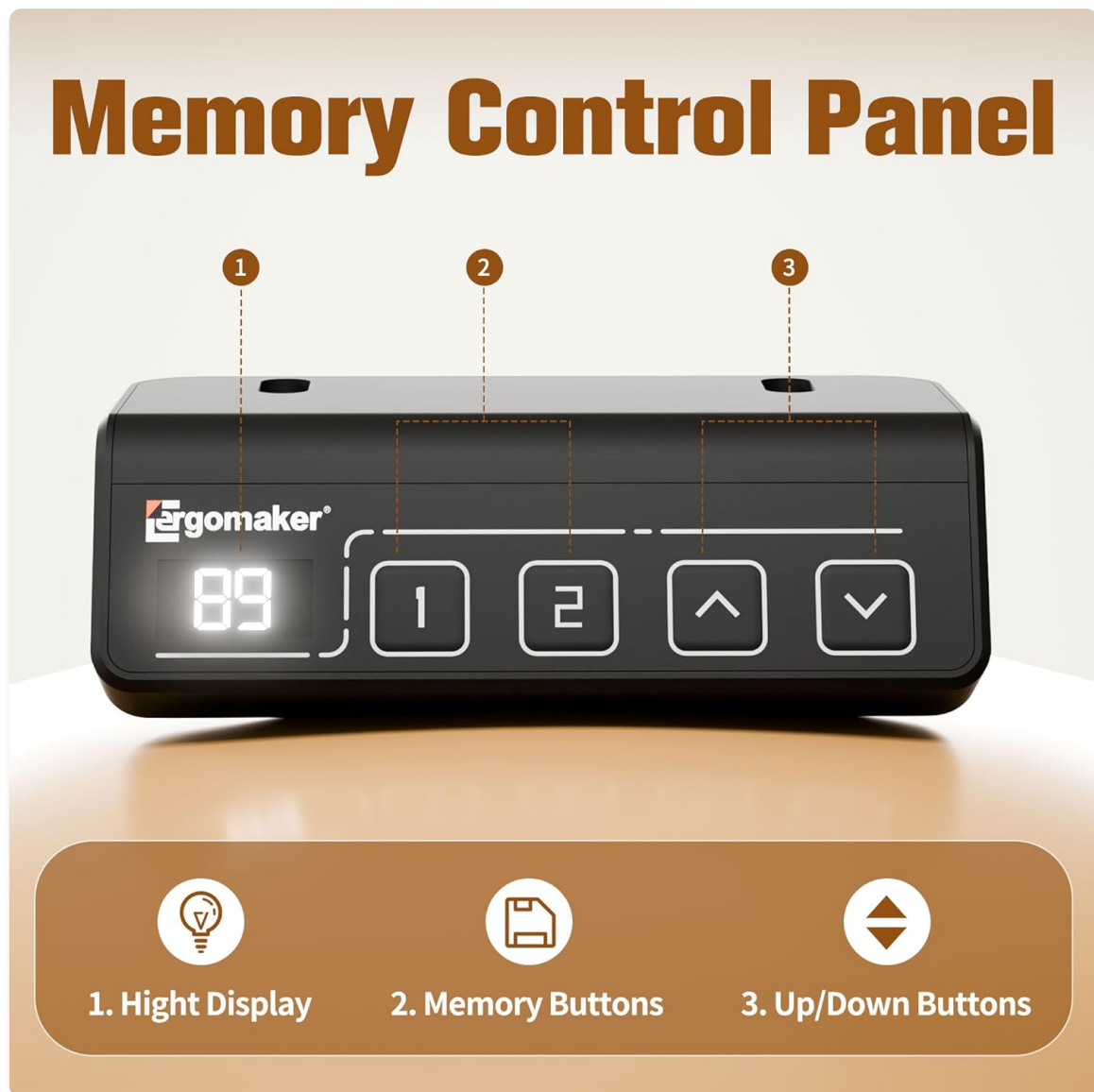
Image: The control panel features a digital height display, two memory preset buttons (1, 2), and up/down arrow buttons for manual adjustment.