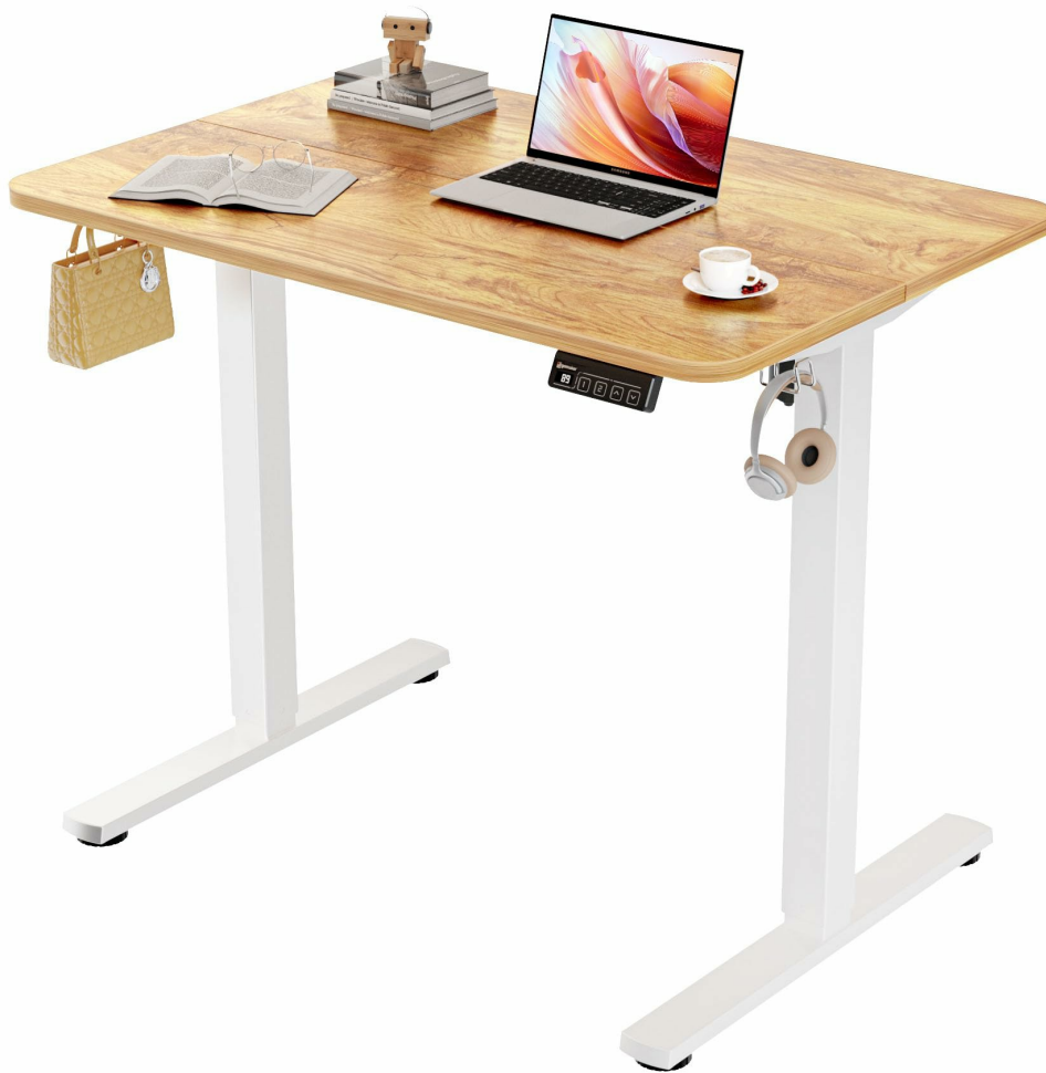
Image: A 35-inch ERGOMAKER electric standing desk providing ample space for a laptop, book, and other office essentials.

With a desktop size of 35.4 x 23.6 inches, this desk provides ample space for monitors, laptops, and other essential office supplies.