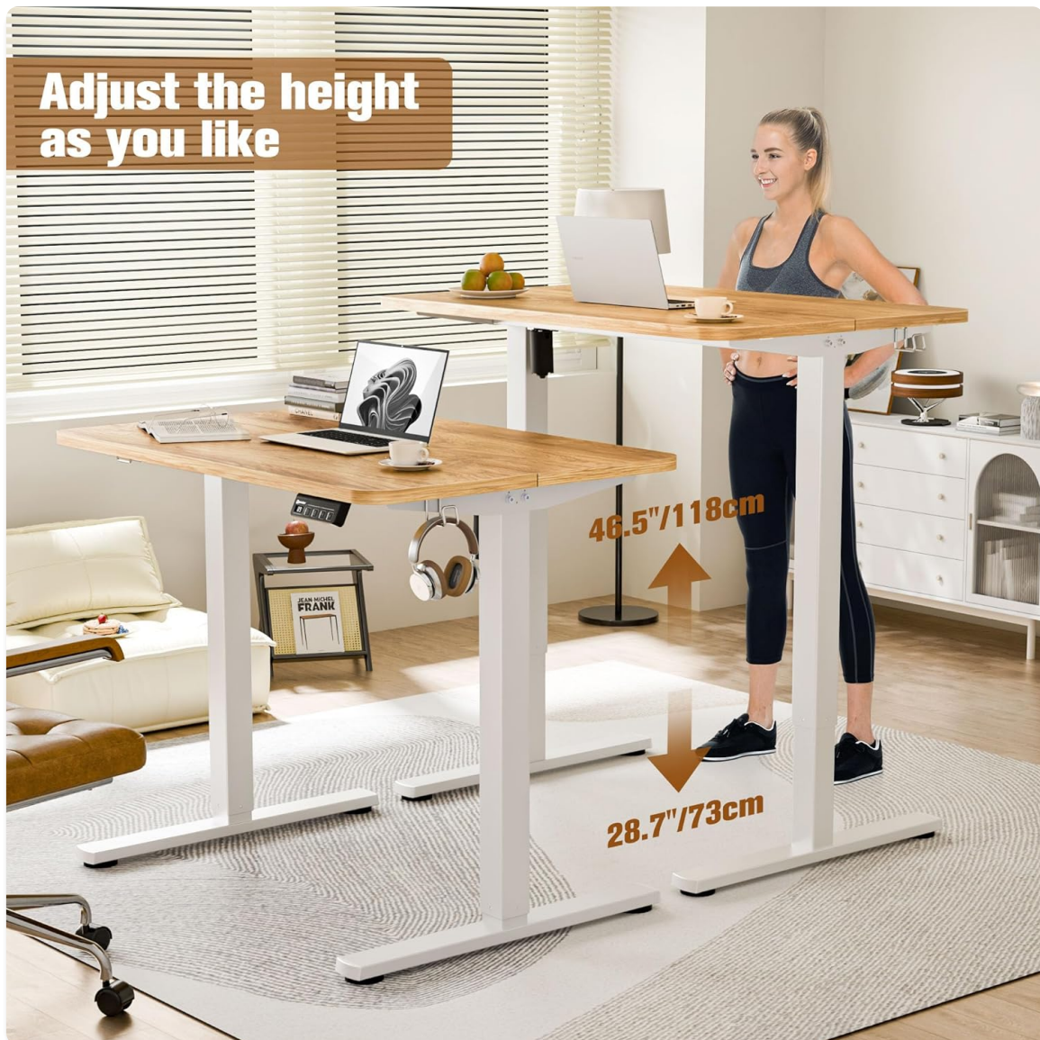
Image: The desk seamlessly adjusts between sitting and standing heights, offering a range from 28.7 inches to 46.5 inches.

The desk can be adjusted from a minimum height of 28.7 inches (73 cm) to a maximum height of 46.5 inches (118 cm), accommodating various user preferences and ergonomic needs.