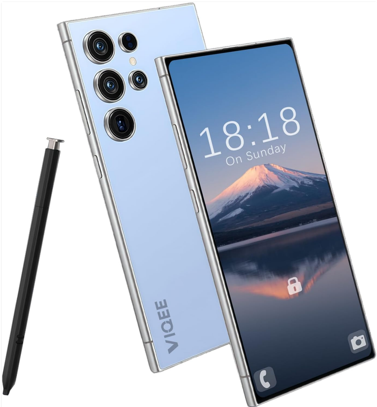
Image: viquee I24 Ultra 5G Android 14 Smartphone, shown in blue with a stylus.