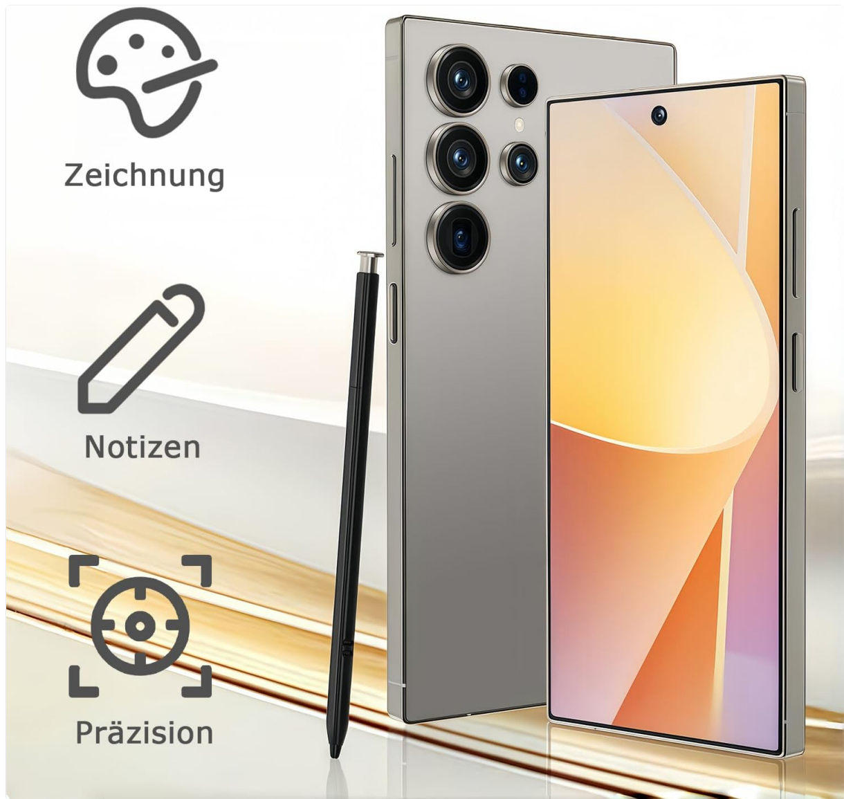
Image: Icons representing drawing, notes, and precision, suggesting features related to the educational app or stylus functionality.