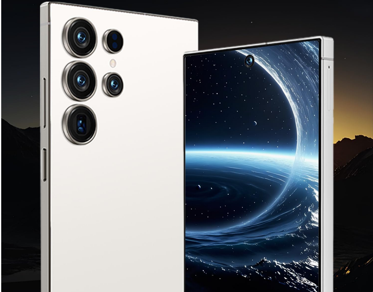
Image: Another view of the smartphone's rear camera, emphasizing the 50MP sensor for high-resolution photography.