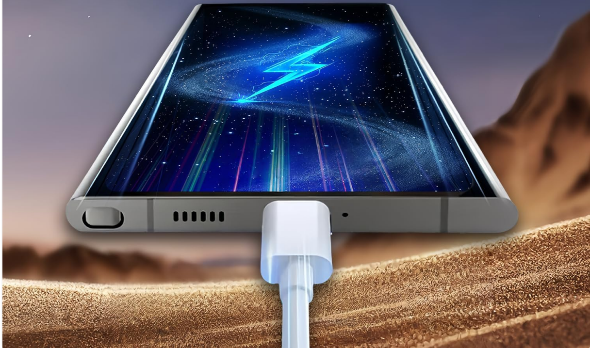
Image: The smartphone connected to a charger, illustrating its 6800mAh battery capacity and long-lasting power.

Superlange Akkulaufzeit dank 6800 mAh-Akku mit hoher Kapazität und Energiespartechnologie