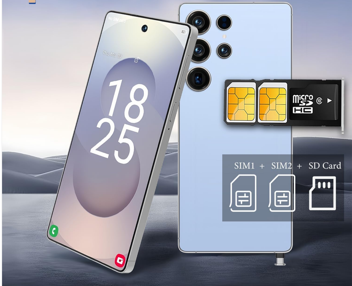
Image: Illustration showing the dual SIM card and microSD card slots on the phone's tray.