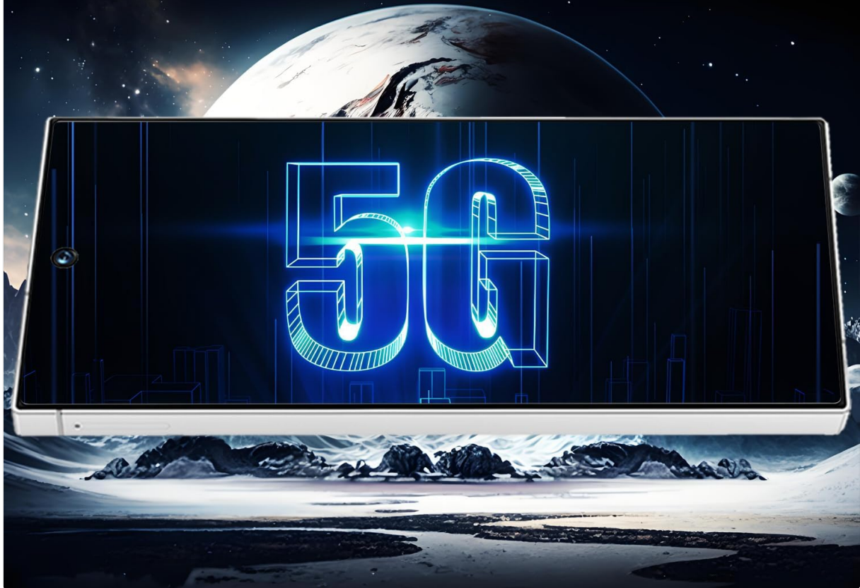
Image: A visual representation of 5G network capabilities, indicating fast download speeds and low latency for the smartphone.

With 5G connectivity, download speeds are faster, latency is lower, and the overall experience is more seamless.