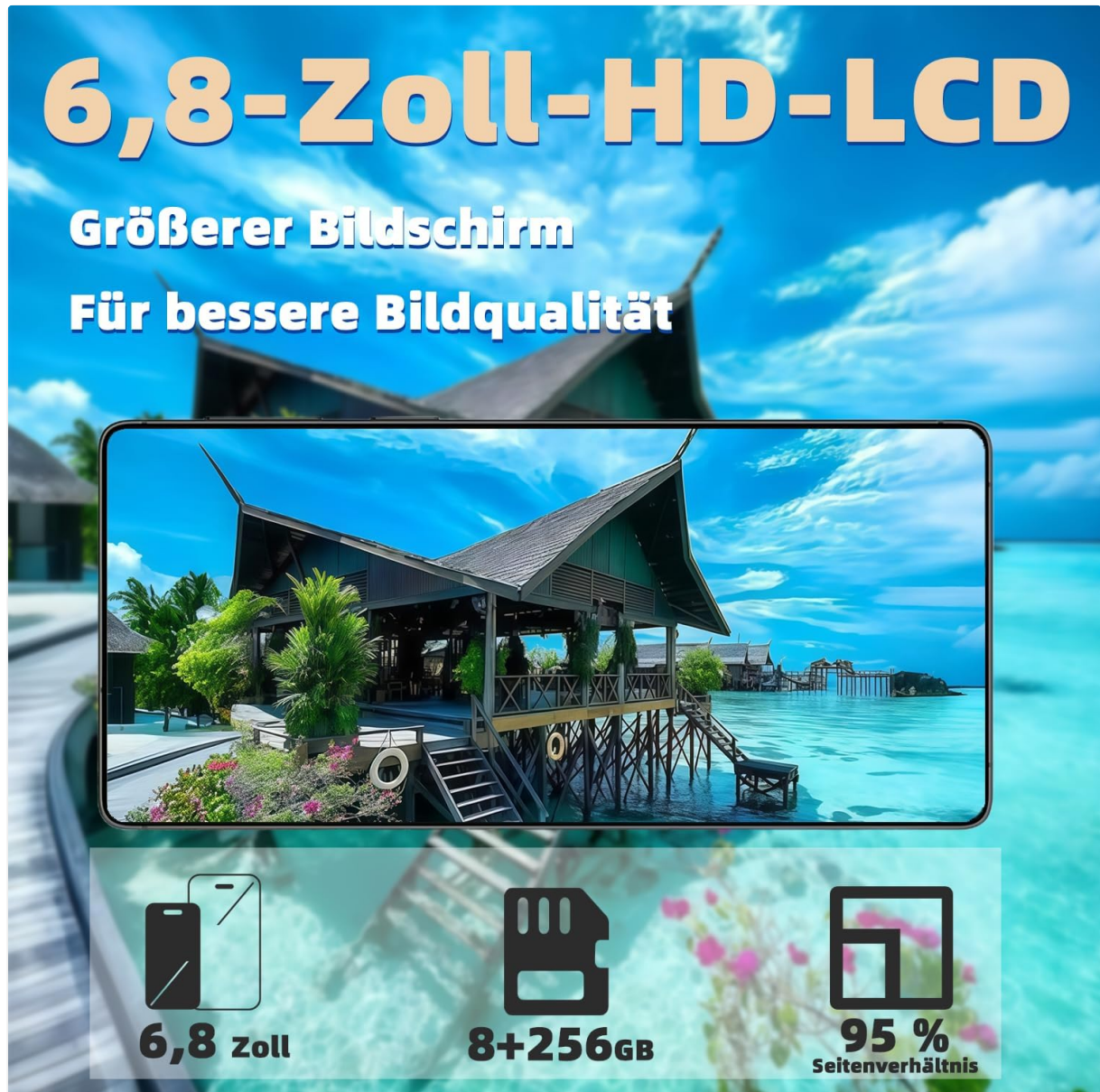
Image: The 6.8-inch HD display of the viquee I24 Ultra smartphone, showcasing its large screen for clear visuals.