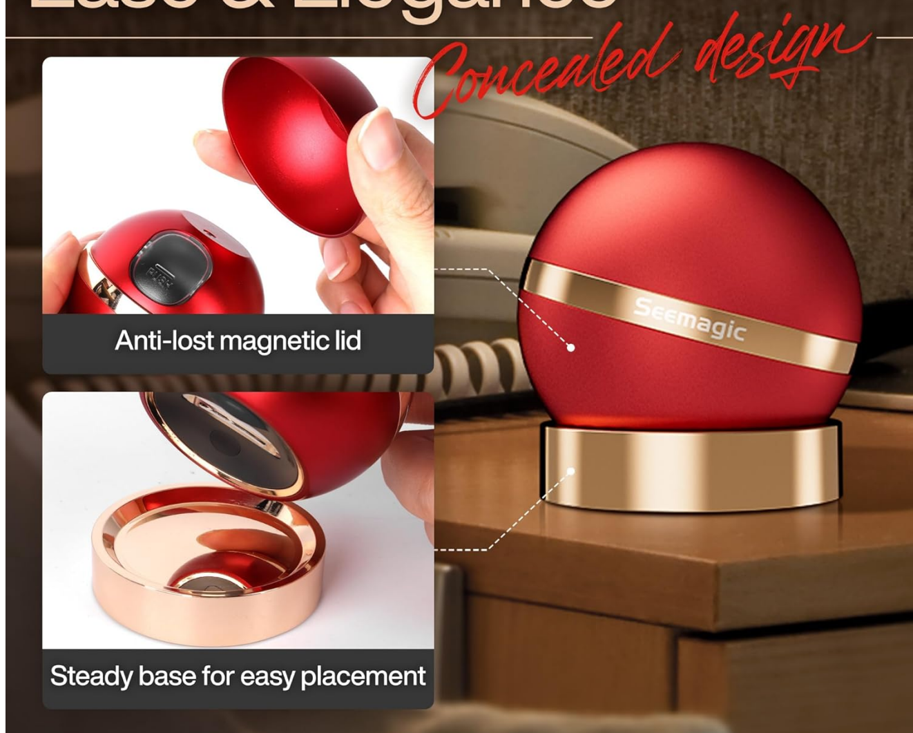
Figure 5.1: Accessing the nail chip bin and the steady base design.