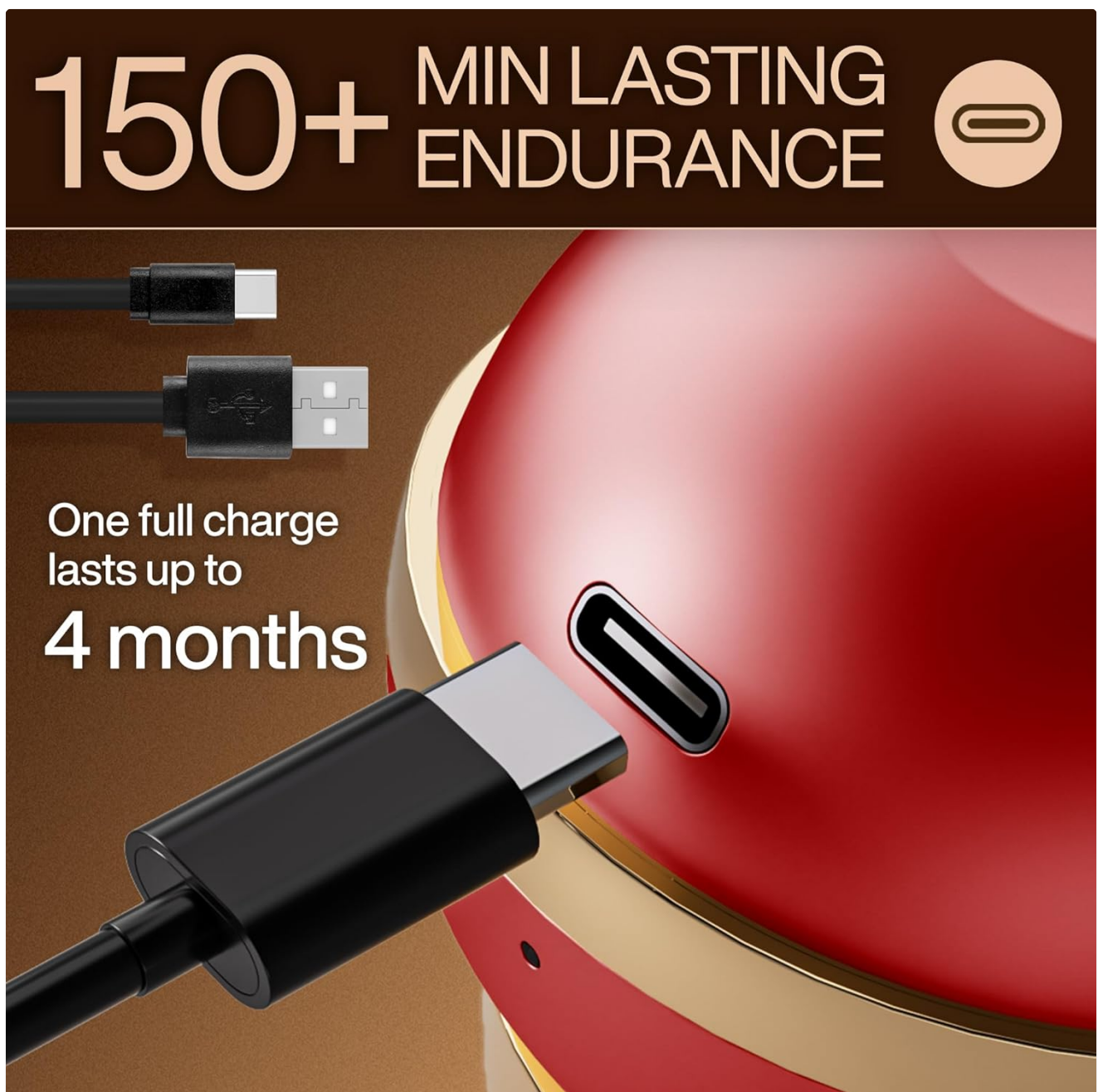
Figure 3.1: Charging the Seemagic Electric Nail Clipper.