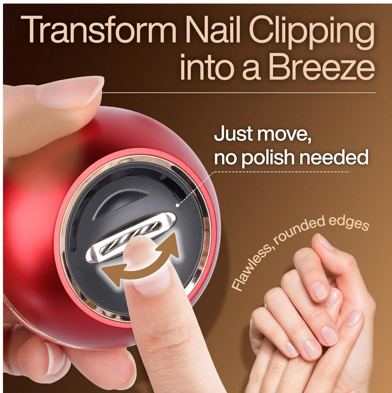
Figure 4.1: Simple operation for trimming and polishing.