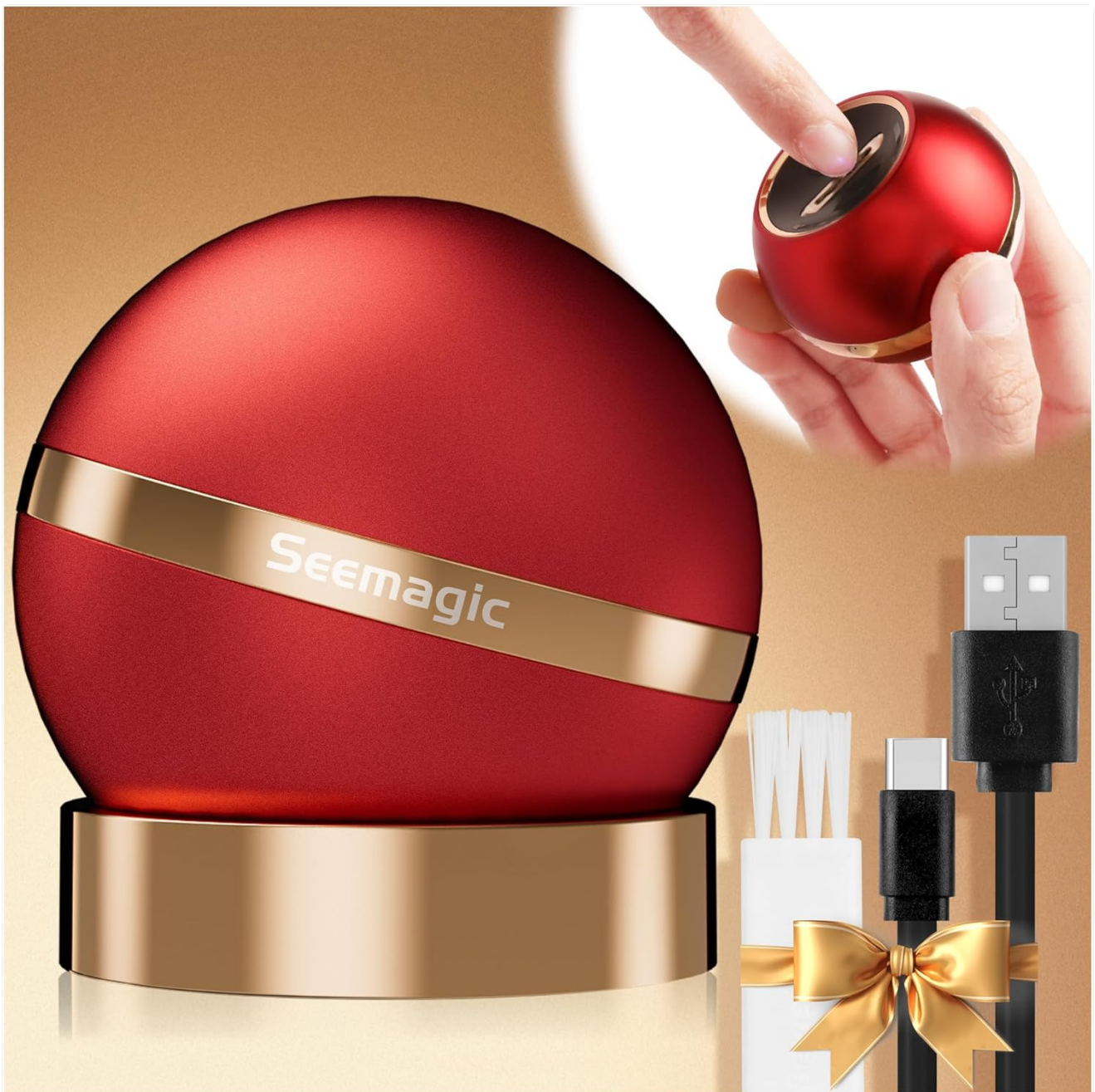
Figure 1.1: Seemagic Electric Nail Clipper and accessories.

The clipper is engineered for ease of use, safety, and portability, making it an ideal companion for home use or travel. Its quiet operation ensures it can be used without disturbing others.