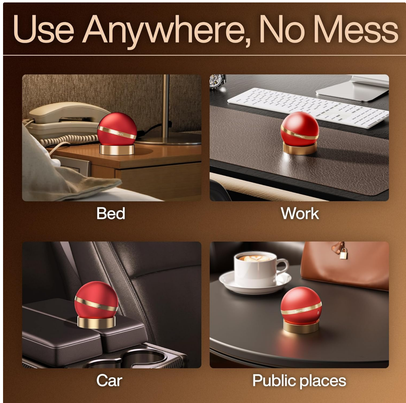
Figure 4.2: Versatile use of the Seemagic Electric Nail Clipper in various environments.

The compact and portable design allows for use in various locations, including at home, in the office, or while traveling, without creating a mess.