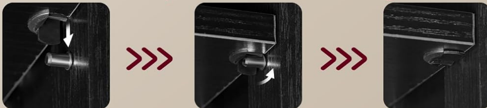
Diagram illustrating the adjustable shelf heights and the secure clips for stable storage within the cart.

Shelves secured with clips for stable storage