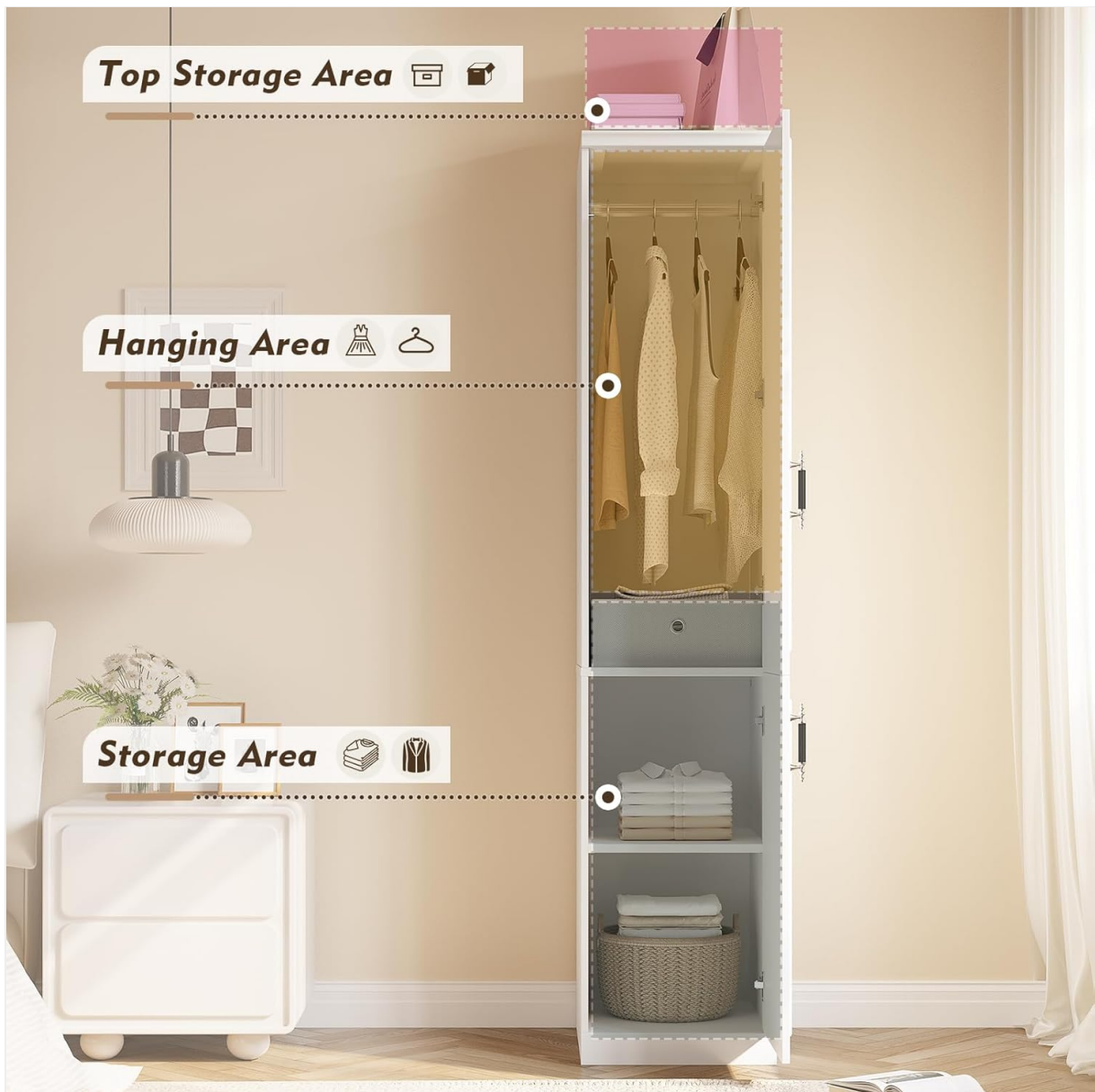
Figure 5.1: Internal organization showing top, hanging, and lower storage areas.