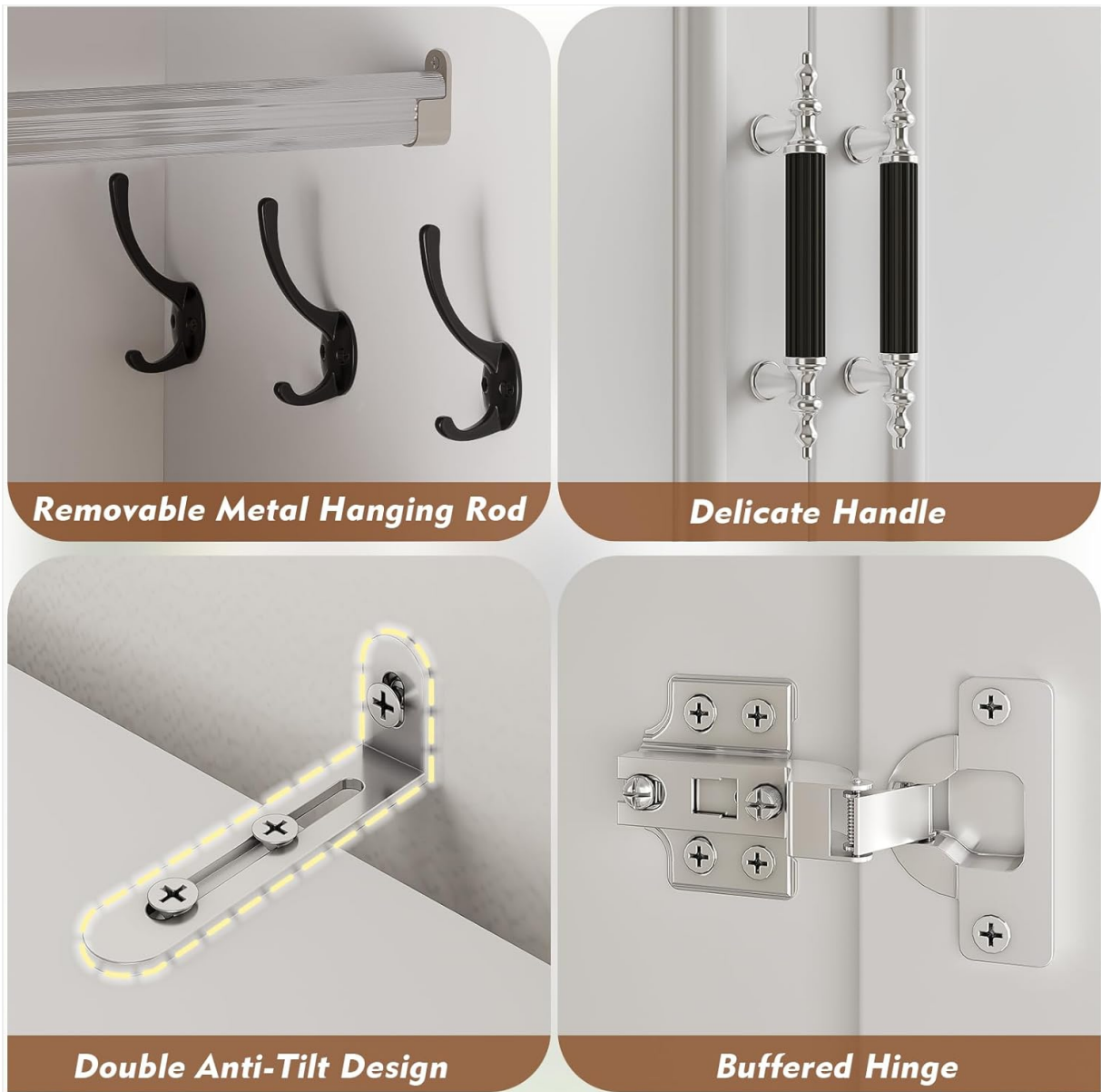
Figure 2.1: Key safety and design features including the double anti-tilt design.