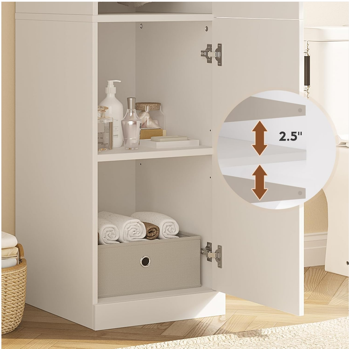
Figure 5.2: Detail of the adjustable shelf, allowing for customized storage space.