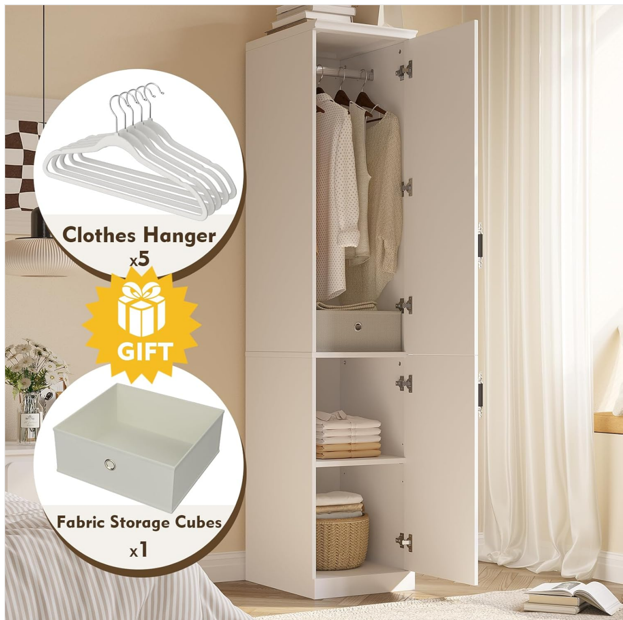
Figure 3.1: Included bonus items: clothes hangers and fabric storage bin.