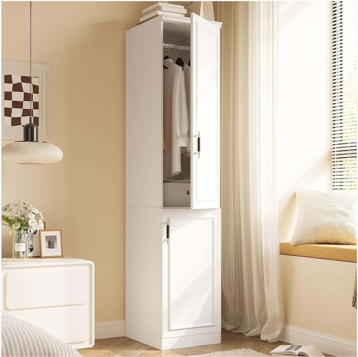
Figure 1.1: Fully assembled MEISSALIVVE Armoire Wardrobe Closet in a bedroom.