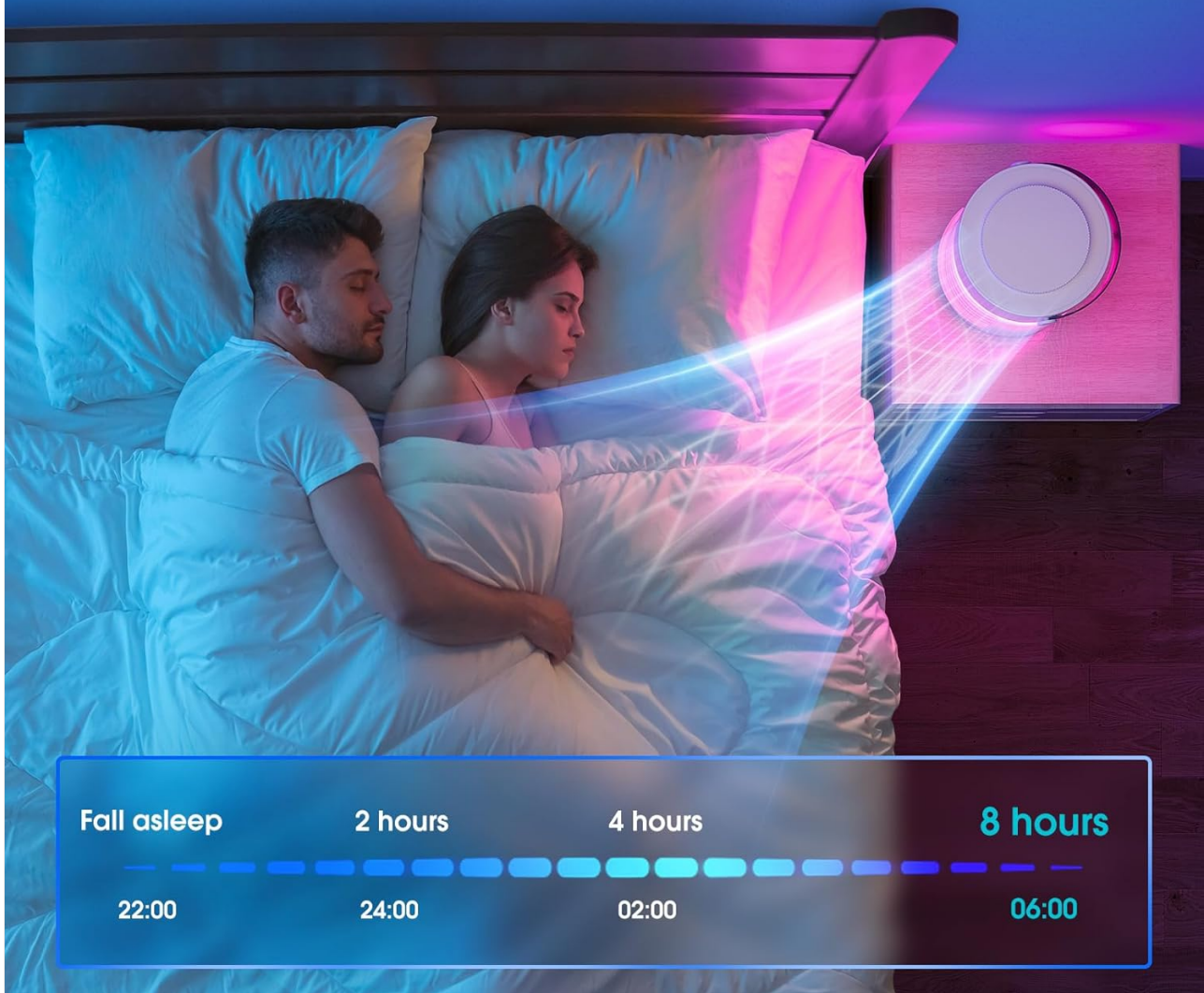
Figure 4.2: Illustration of the 2H, 4H, and 8H timer modes for comfortable sleep.