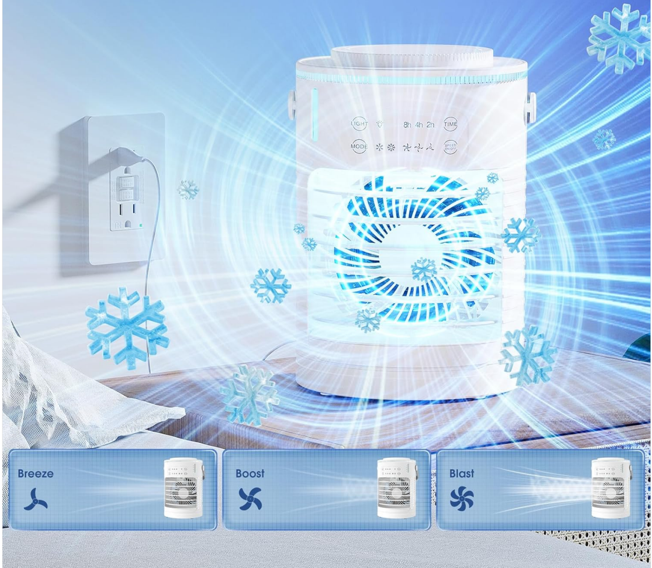
Figure 4.1: Visual representation of the 3-speed fan settings (Breeze, Boost, Blast).