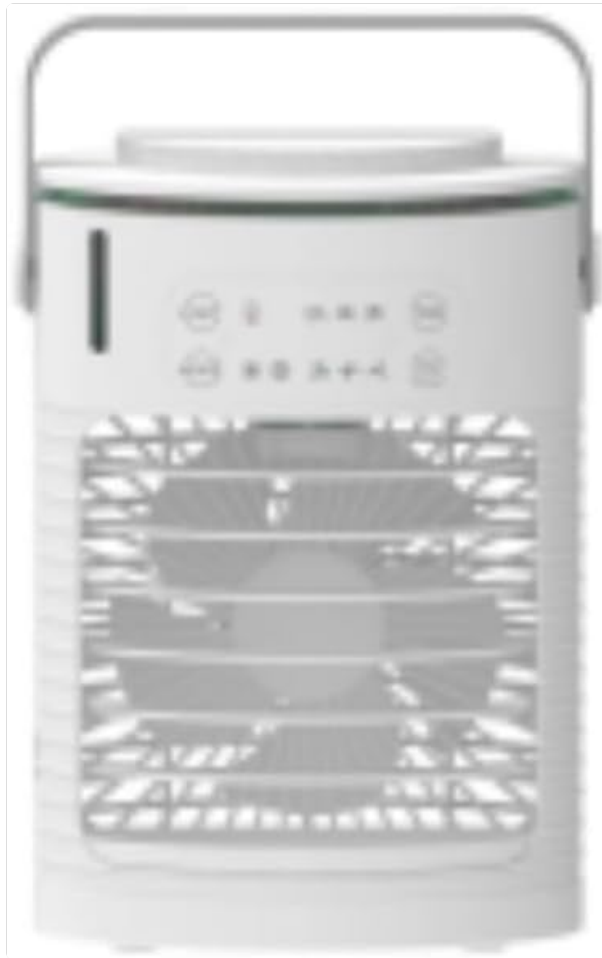
Figure 1.1: Front view of the Passky Mini Evaporative Air Cooler.