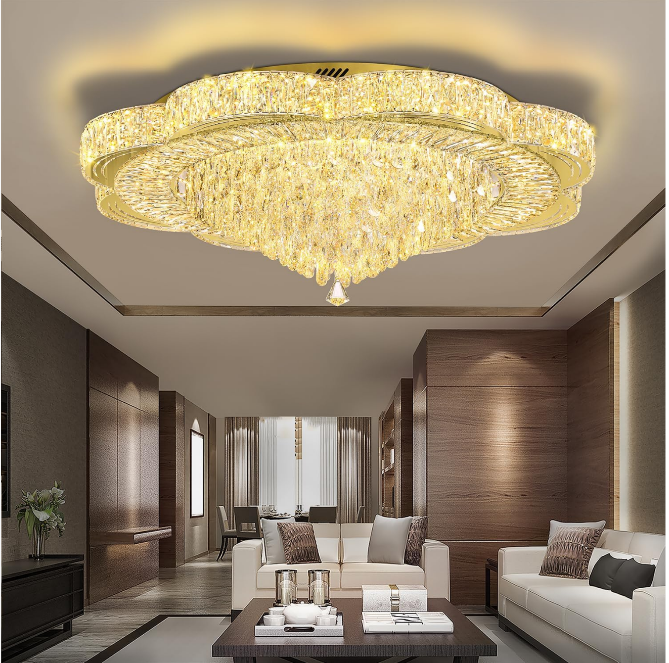
Figure 5.1: Chandelier installed in a hallway, showcasing its design.

The chandelier includes approximately 126 individual crystal components. These are typically attached using small metal pins or hooks. Refer to the diagram (if provided with your specific model) for the correct placement of each crystal strand. This process can be time-consuming but is crucial for the chandelier's aesthetic.