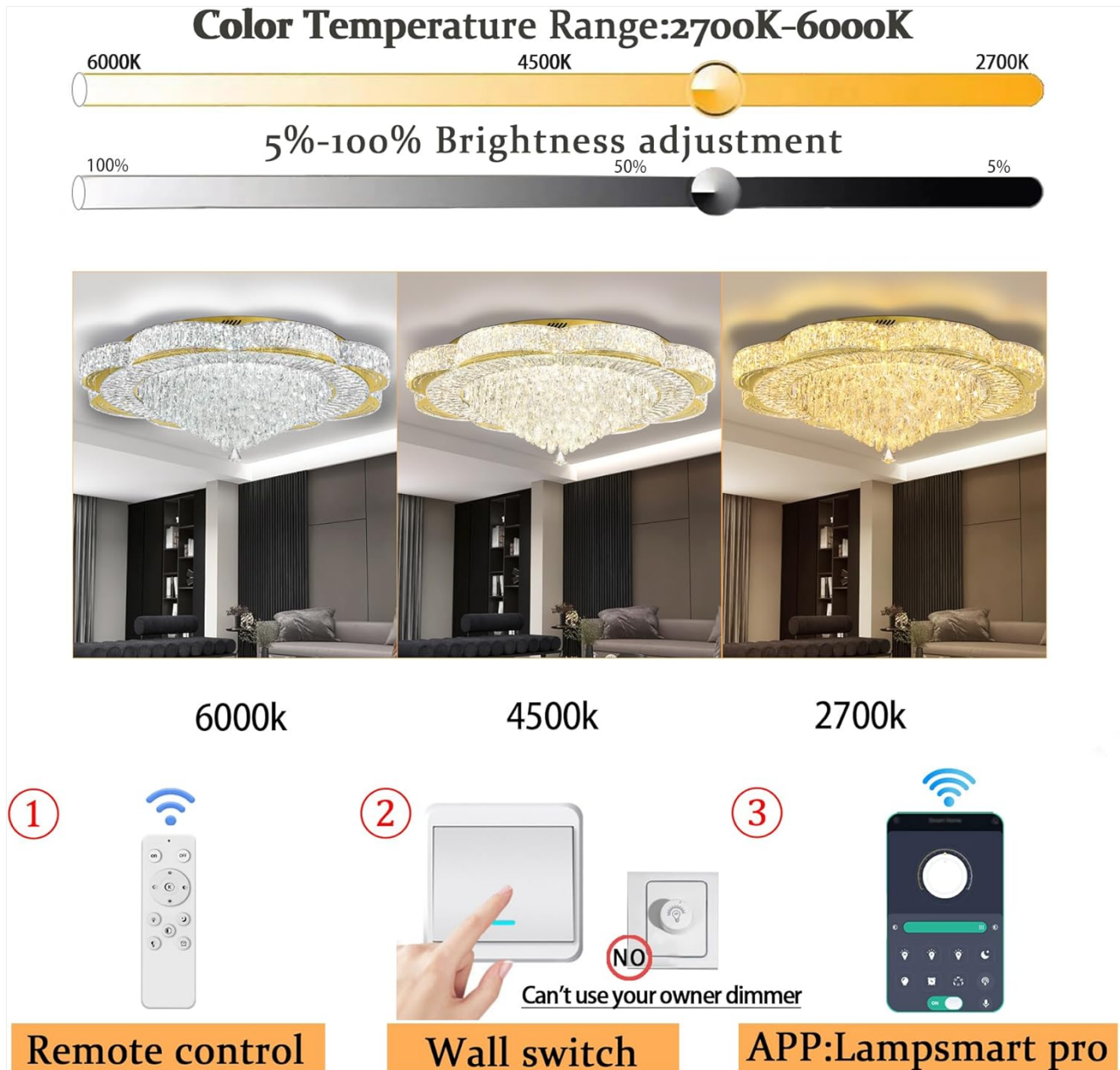
Figure 6.1: Color Temperature and Brightness Adjustment with Control Methods