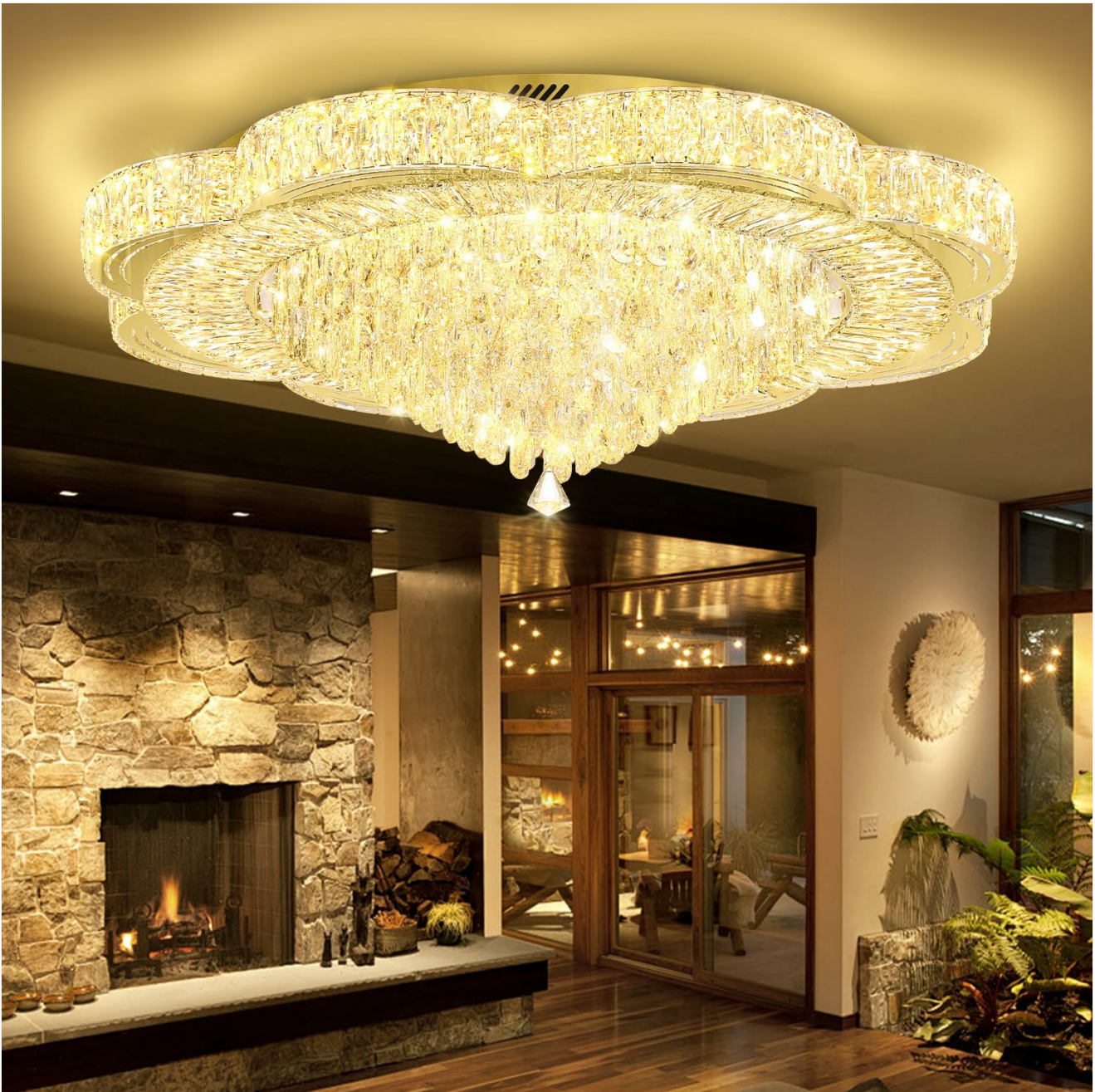
Figure 1.1: IDEQUY Modern Crystal Chandelier (40-inch, Gold)