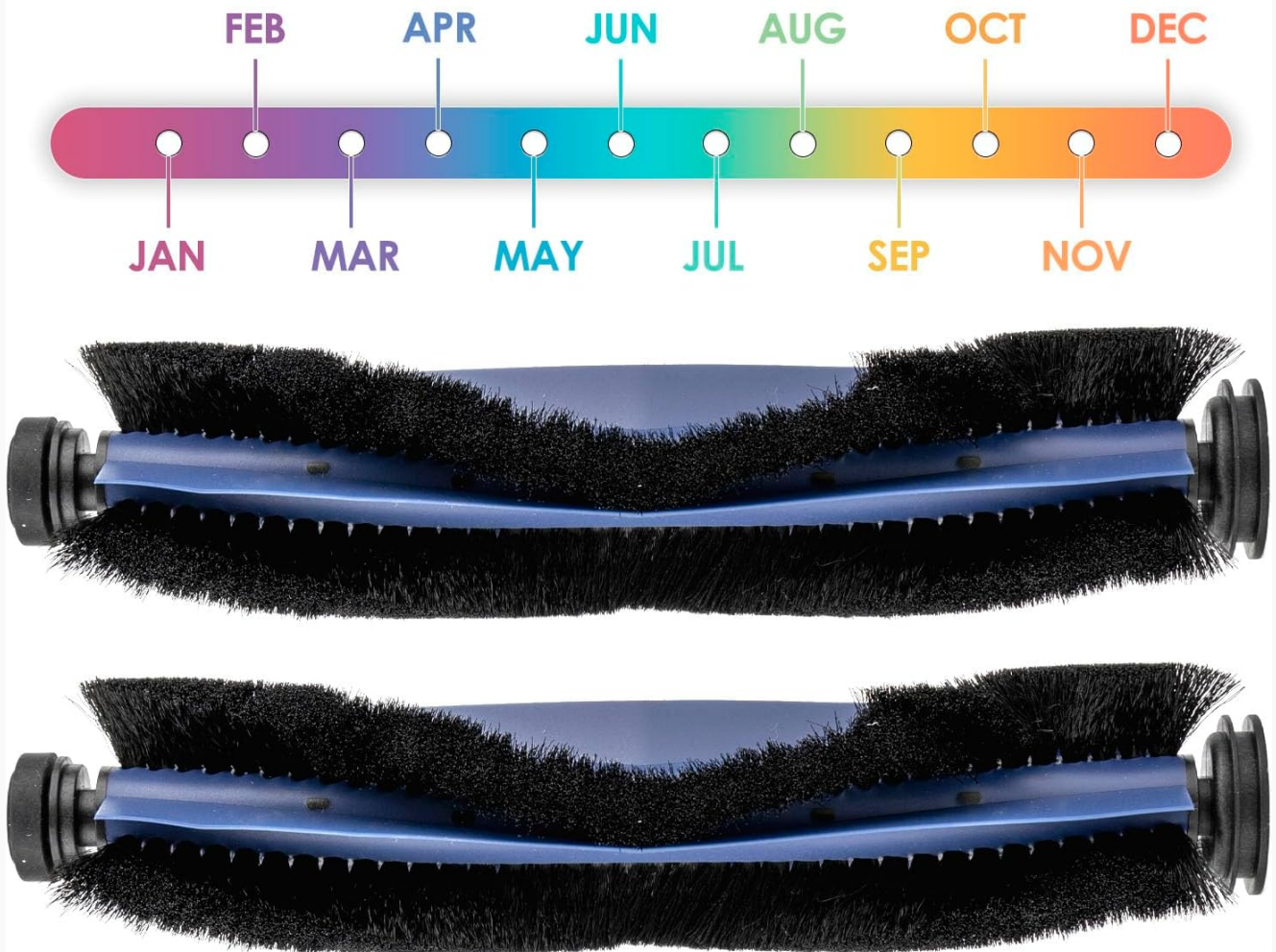
Image 5.1: A visual guide suggesting a typical replacement interval of 8-12 months for the roller brushes to maintain performance.