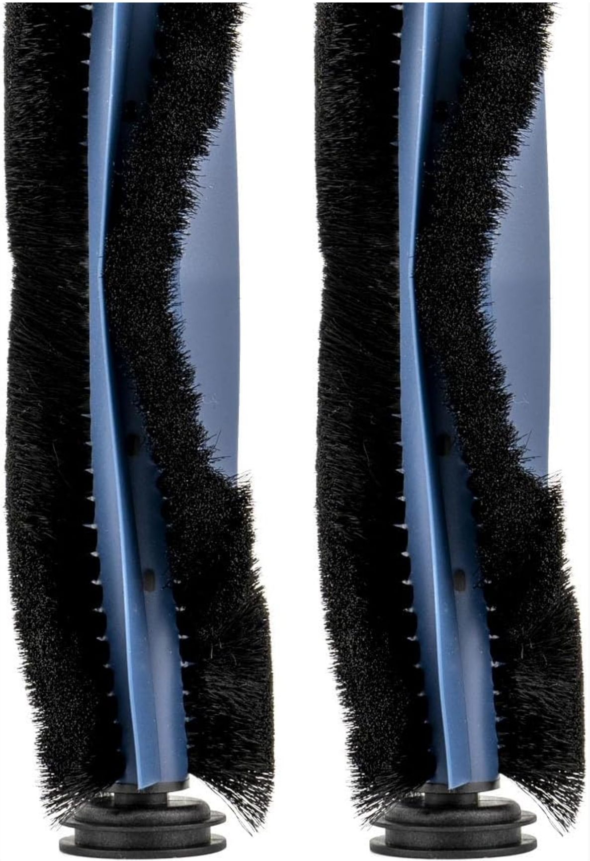
Image 1.1: Two CHAIN PEAK C20 Omni Roller Brushes. These brushes are designed to effectively clean various floor surfaces.