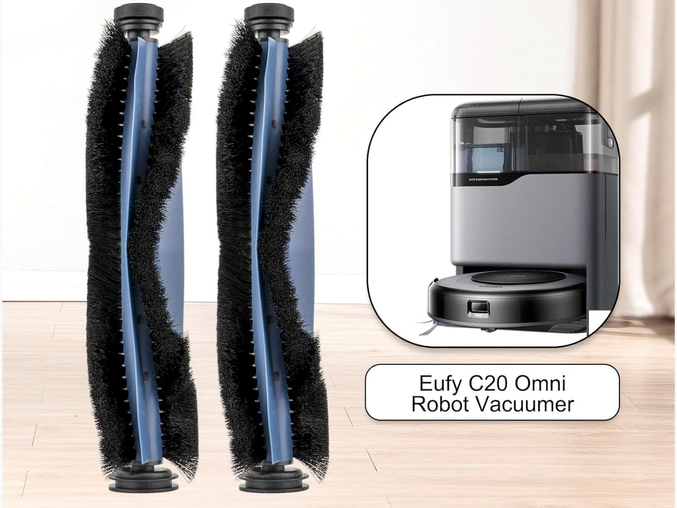
Image 3.1: The CHAIN PEAK C20 Omni Roller Brushes shown alongside the compatible Eufy C20 Omni Robot Vacuum, illustrating their intended use.

Compatible with Eufy C20 Omni Robot Vacuumer