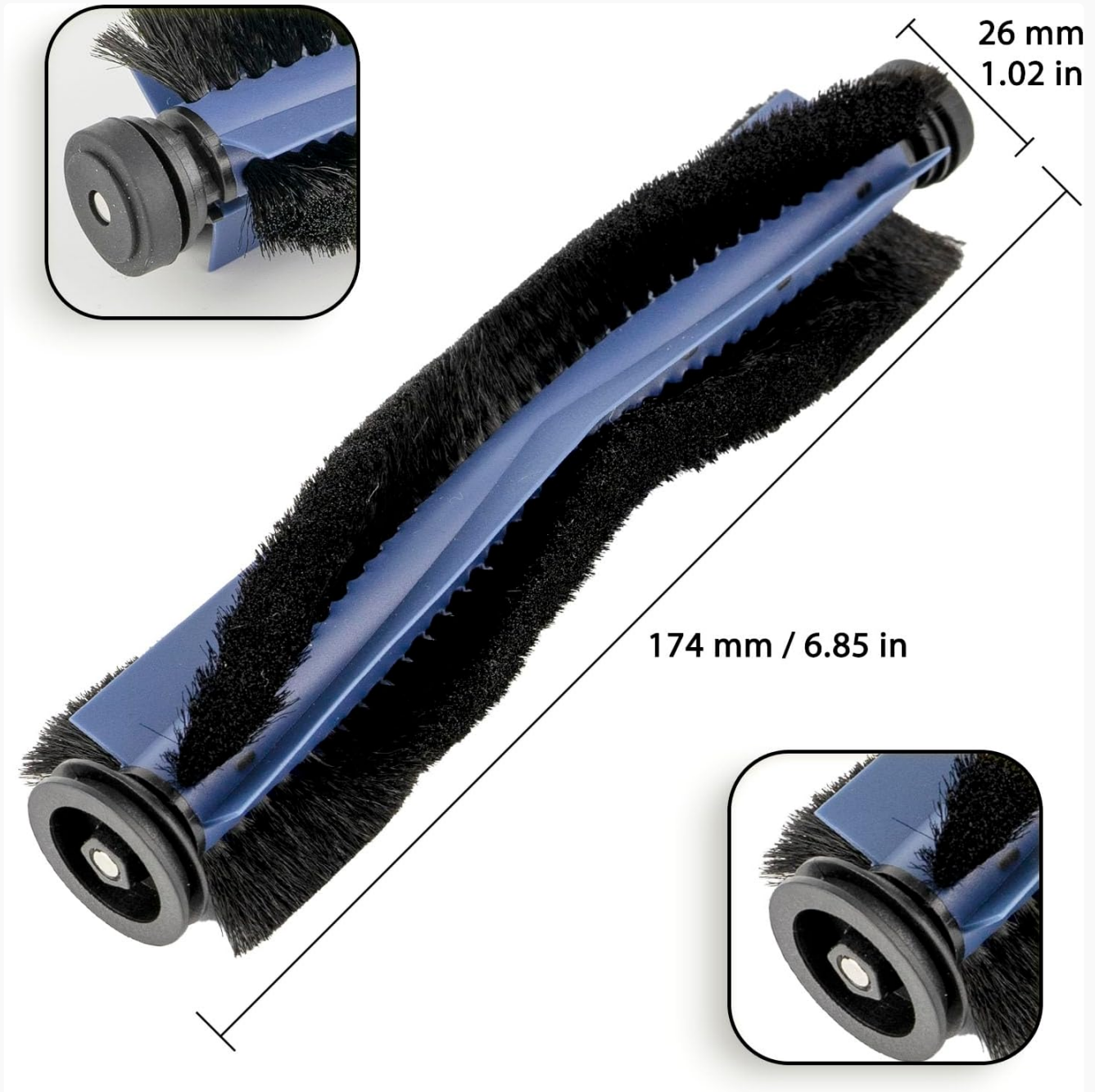
Image 7.1: Detailed view of a roller brush with approximate dimensions for reference.