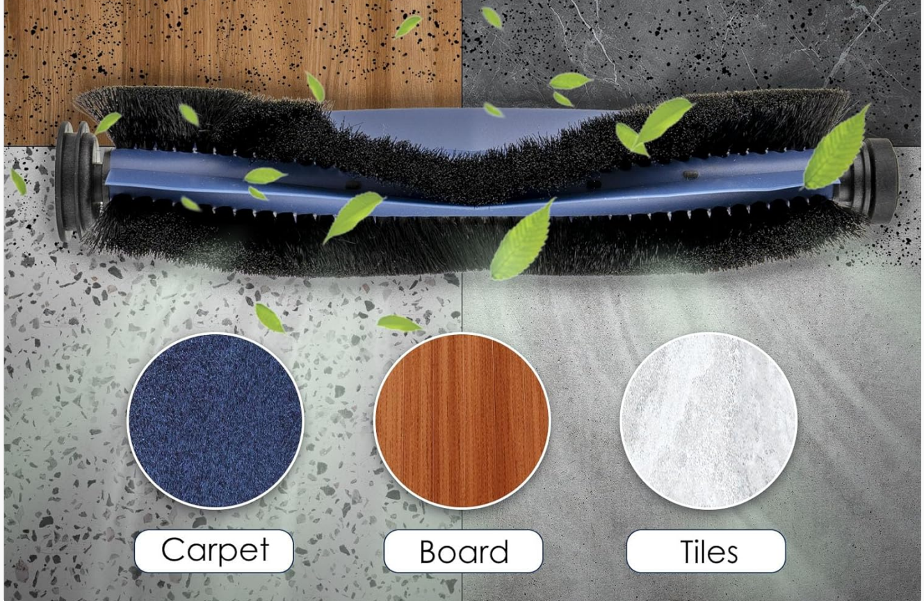
Image 2.1: A close-up view of the two roller brushes included in the package, highlighting their design.

Effectively absorbs pet hair, dirt, dust and debris for floor types - hardwood, carpet and tile