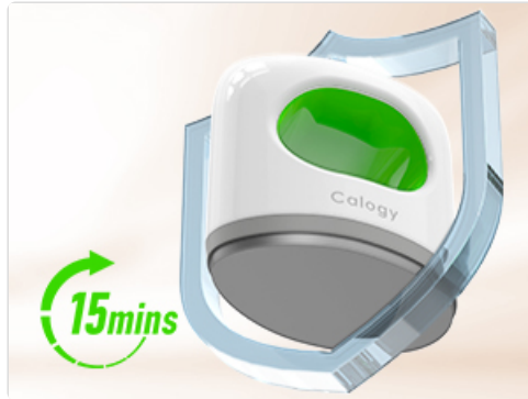
Image: Graphic illustrating the 15-minute auto-off safety feature.