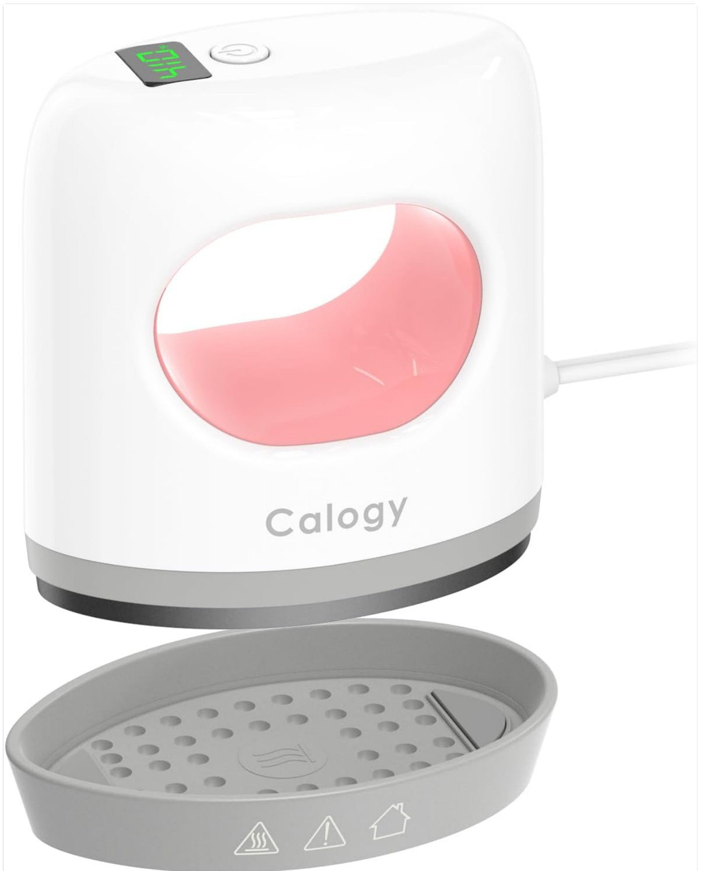
Image: The Calogy Super Mini Heat Press Machine, white and pink, resting on its grey heat-resistant base.