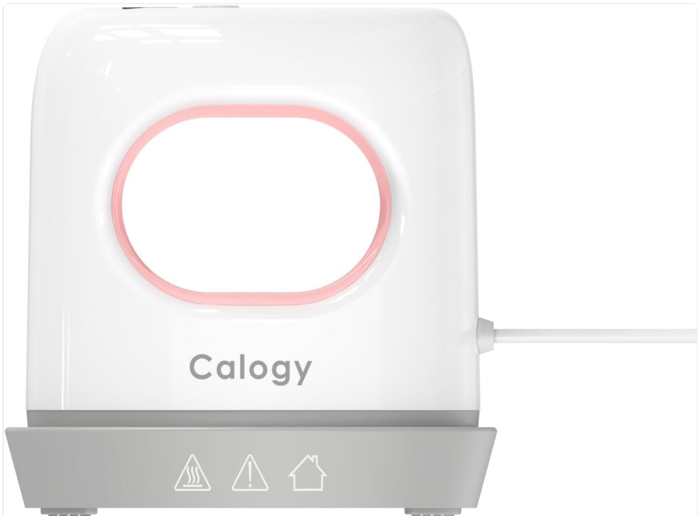
Image: The Calogy Mini Heat Press resting securely on its heat-resistant base, ready for use.