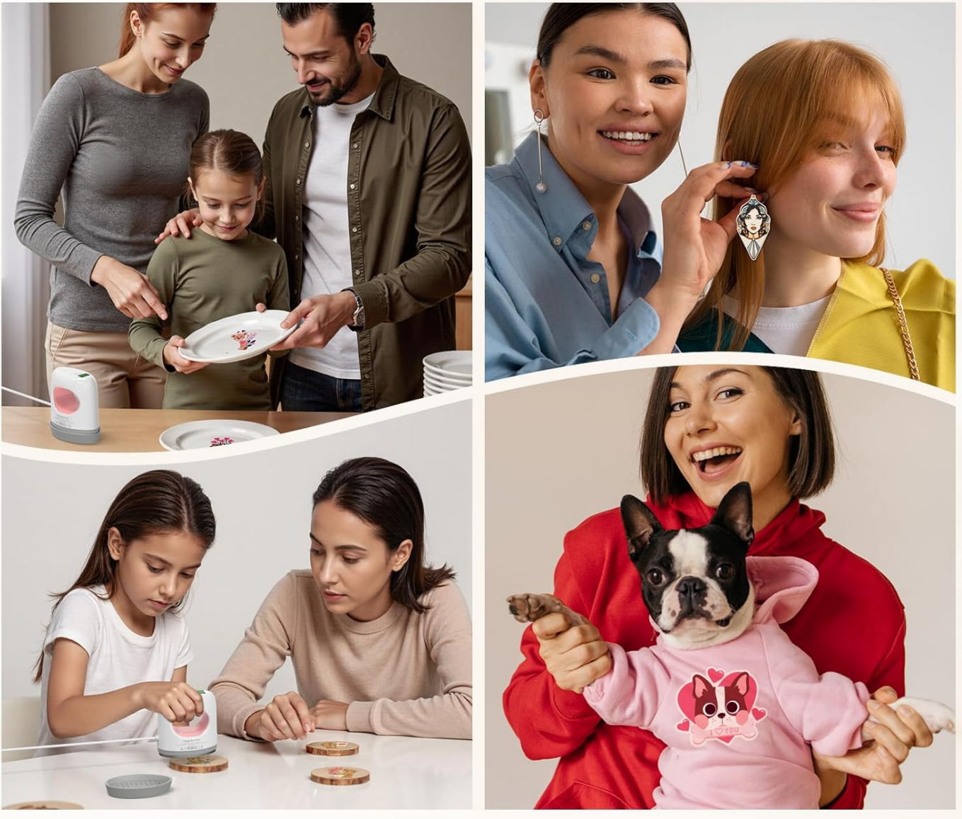
Image: A collage showcasing different DIY crafting projects, such as custom t-shirts, earrings, and stuffed animals, created using the mini heat press.

You can create personalized items for special people