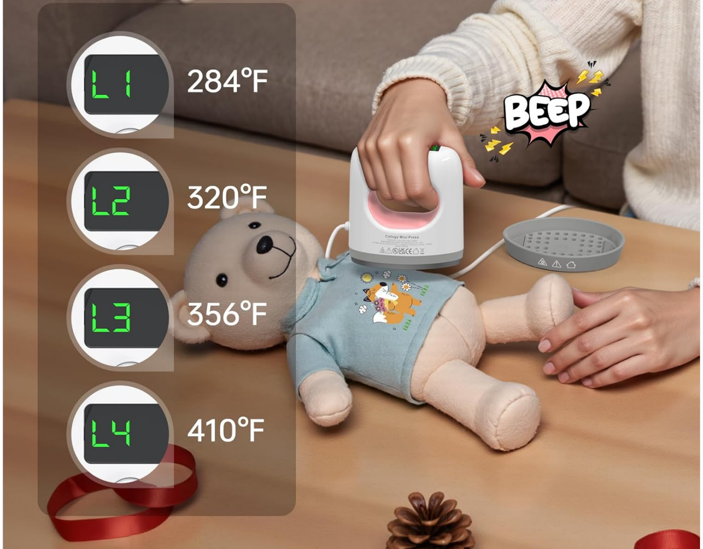
Image: A visual representation of the four temperature levels (L1-L4) and their corresponding Fahrenheit readings on the heat press display.

Can hold on the temp and will beep when reaches