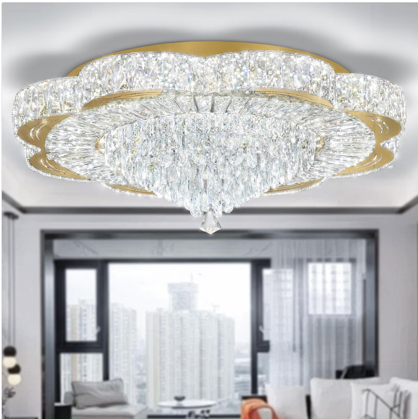
Figure 6: Visual representation of color temperature and brightness adjustment.

Both the remote control and the "LampSmart pro" app provide sliders or buttons to adjust the light's characteristics: