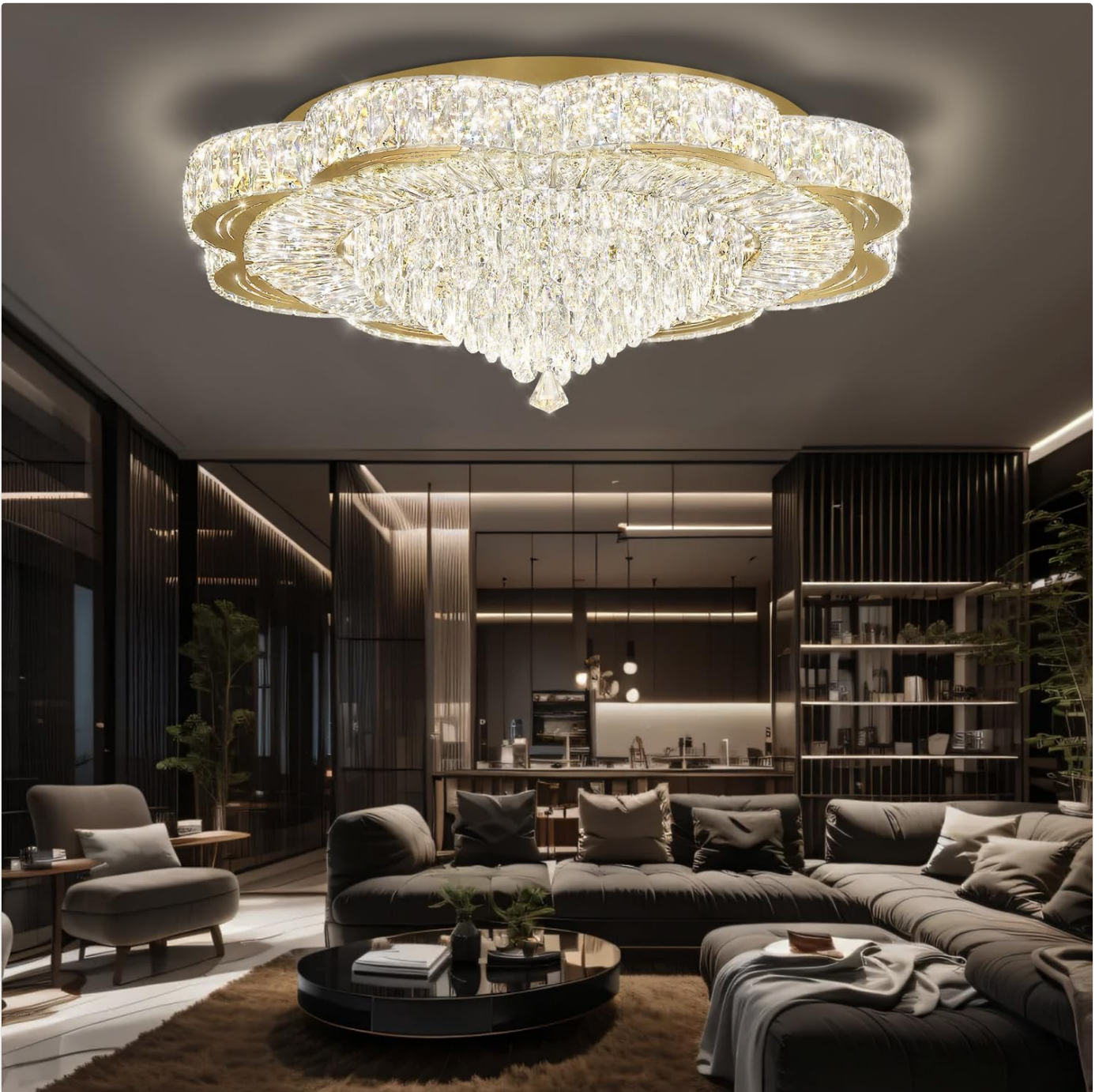
Figure 4: Fully assembled chandelier with all crystals in place.