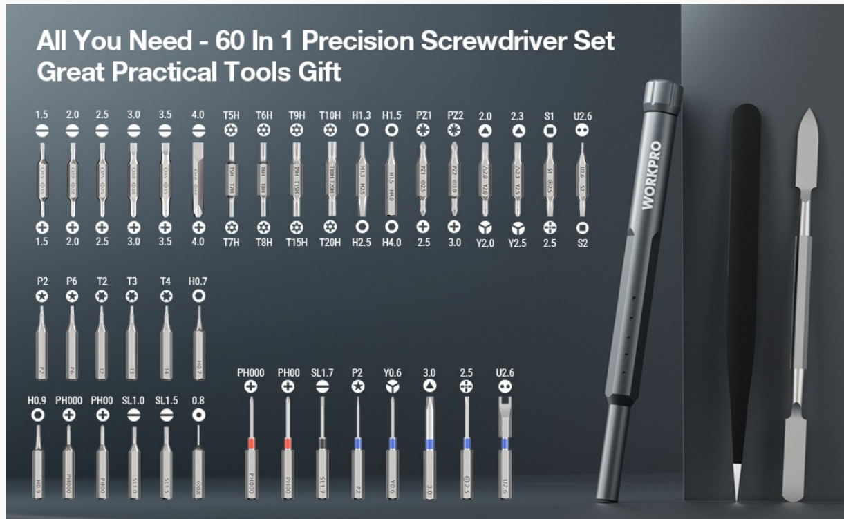
Image: A detailed view of all 60 components included in the precision screwdriver set, neatly arranged.