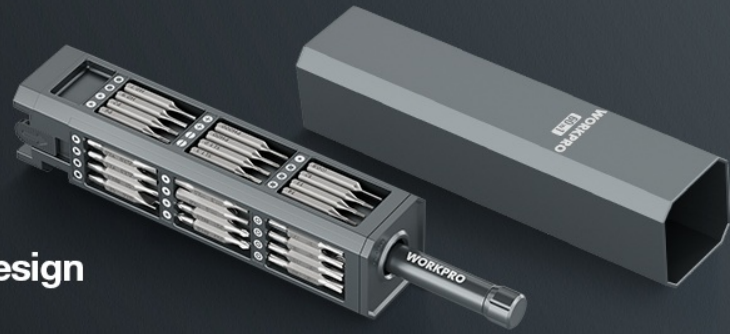
Image: An illustration highlighting the durability and strength of the CR-V steel bits.

Better Material Superior Structure More Sophisticated Design