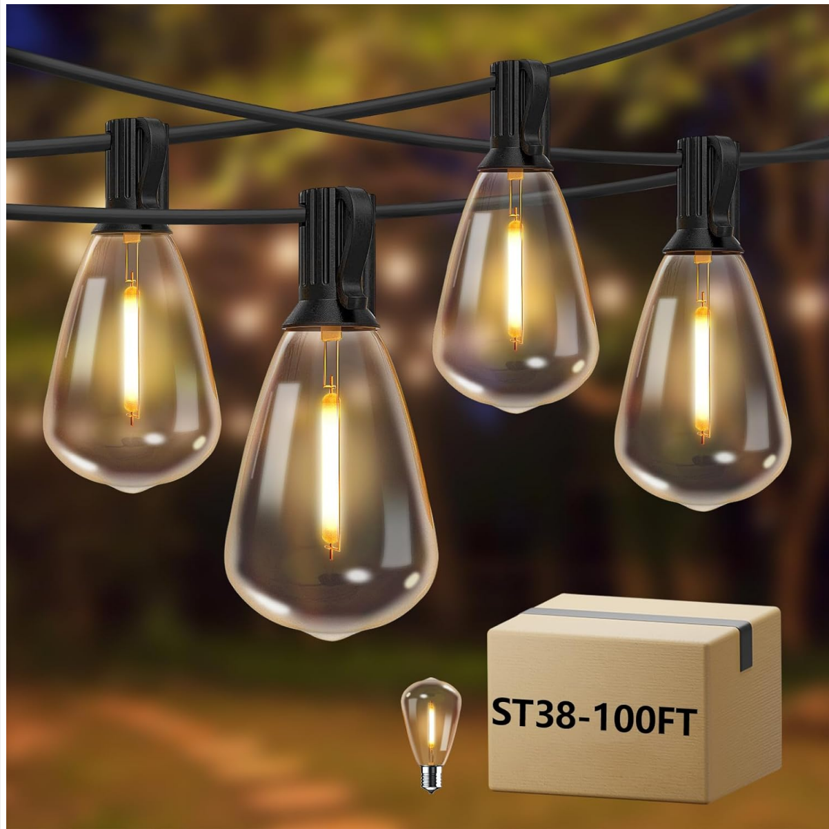
Image 4.1: An example of the DAYBETTER string lights installed and illuminating an outdoor patio area at night, demonstrating their aesthetic appeal and functional lighting.