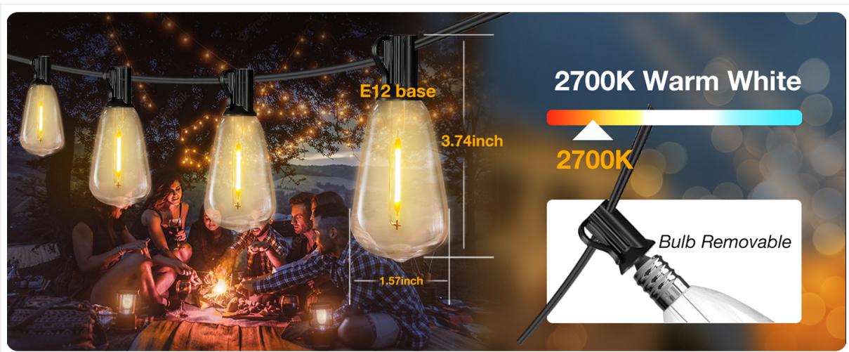
Image 6.1: A close-up view of the ST38 bulb and E12 base, illustrating that the bulb is removable for easy replacement. The image also highlights the 2700K Warm White color temperature.