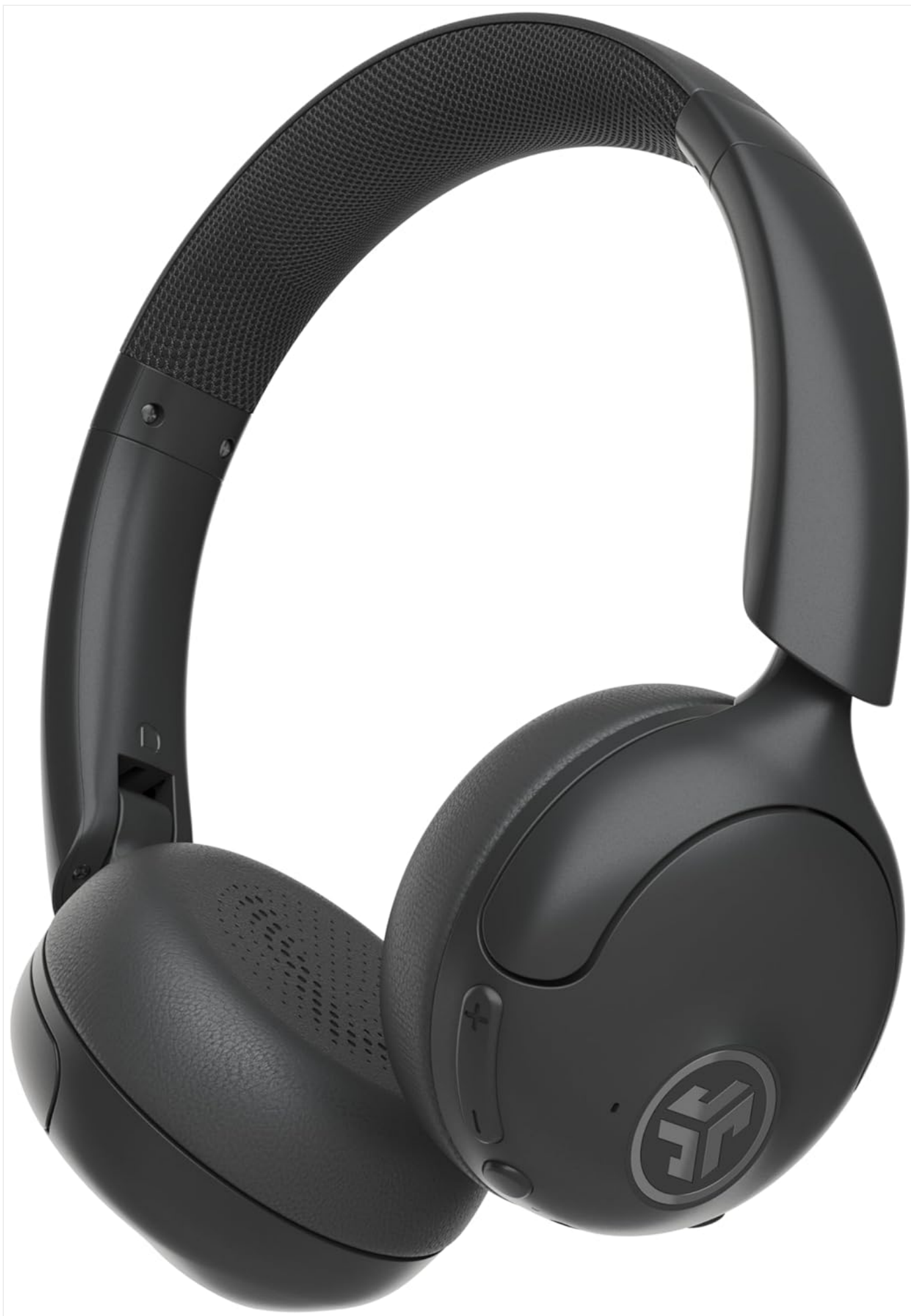
Image: A front-angle view of the JLab Go Lux ANC Wireless Headphones in Graphite color, showcasing the on-ear design and JLab logo on the earcups.