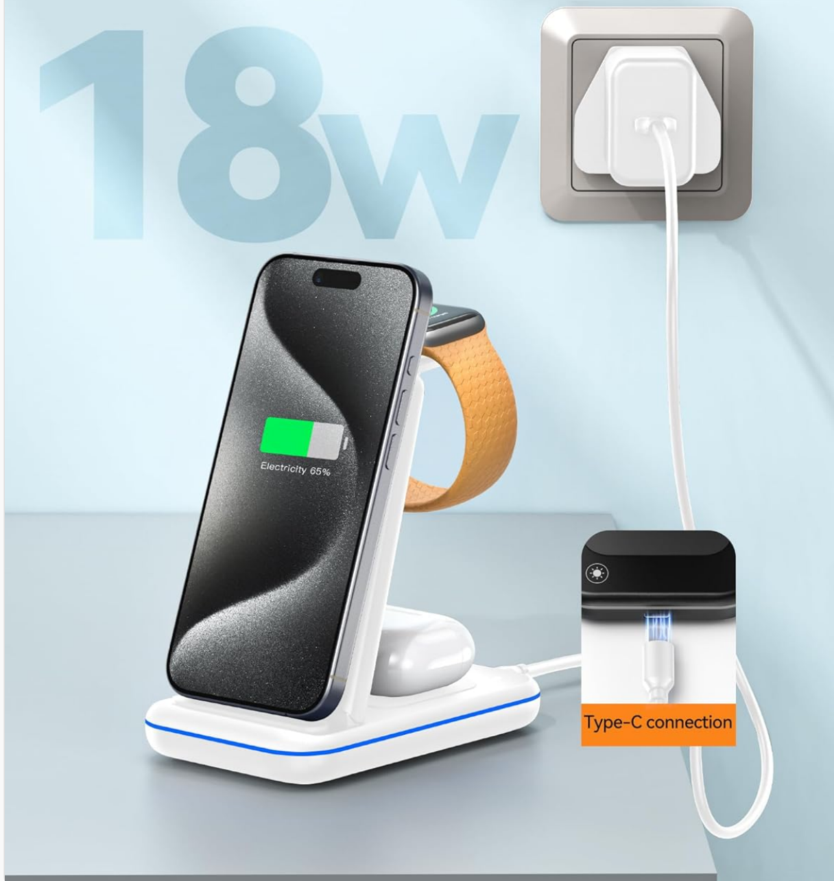
Figure 2: Connecting the TECKNET 3-in-1 Wireless Charger to a power source.