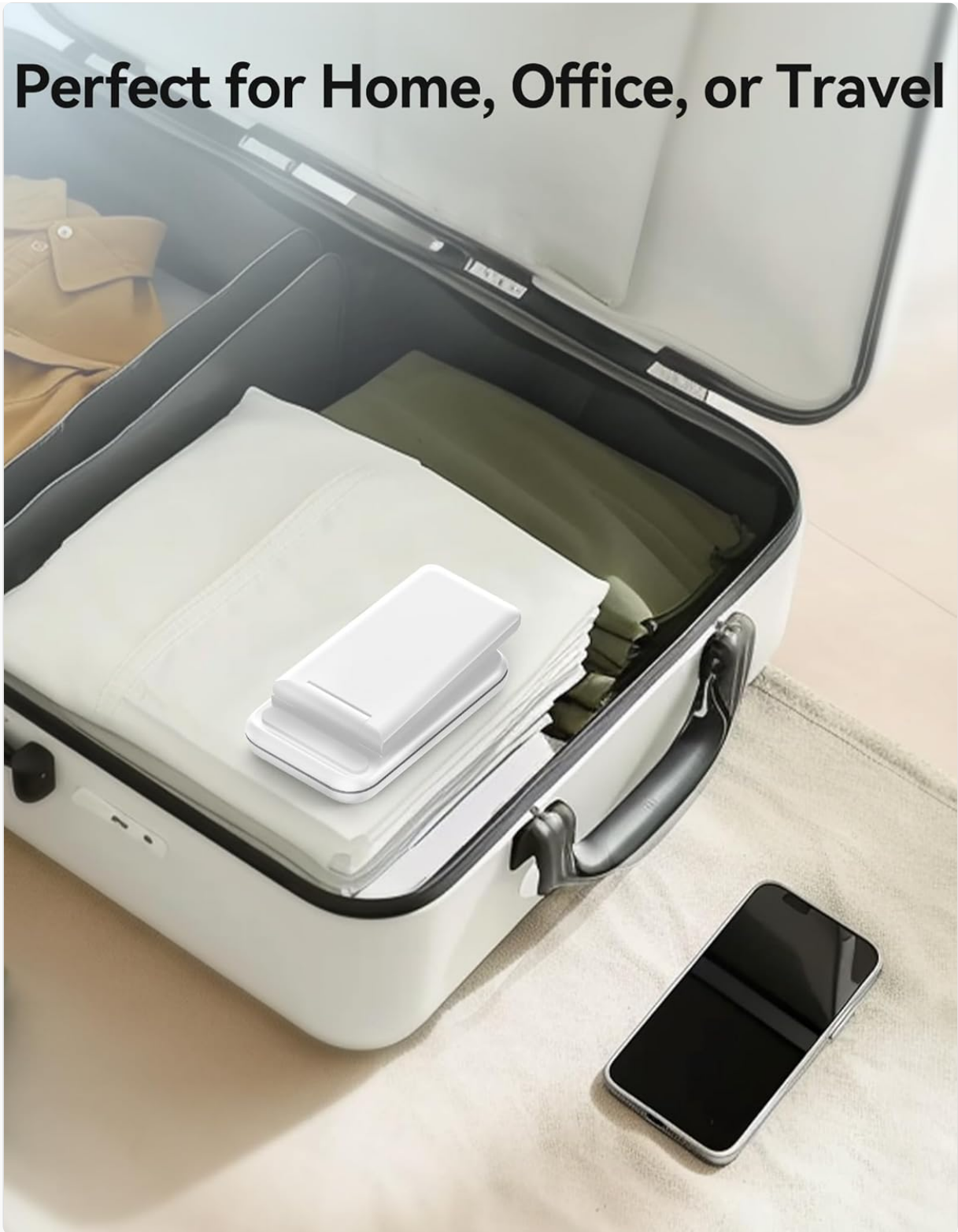
Figure 7: The foldable design enhances portability and storage.