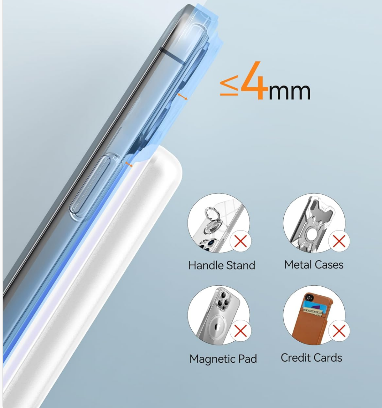
Figure 5: Case compatibility guidelines for the wireless charger.