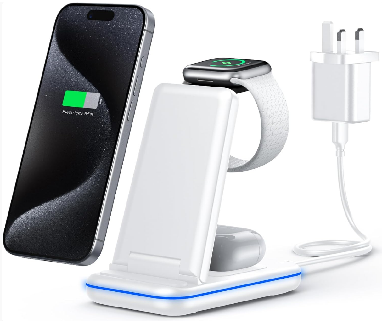
Figure 1: TECKNET 3-in-1 Wireless Charger in use, charging an iPhone, Apple Watch, and AirPods.