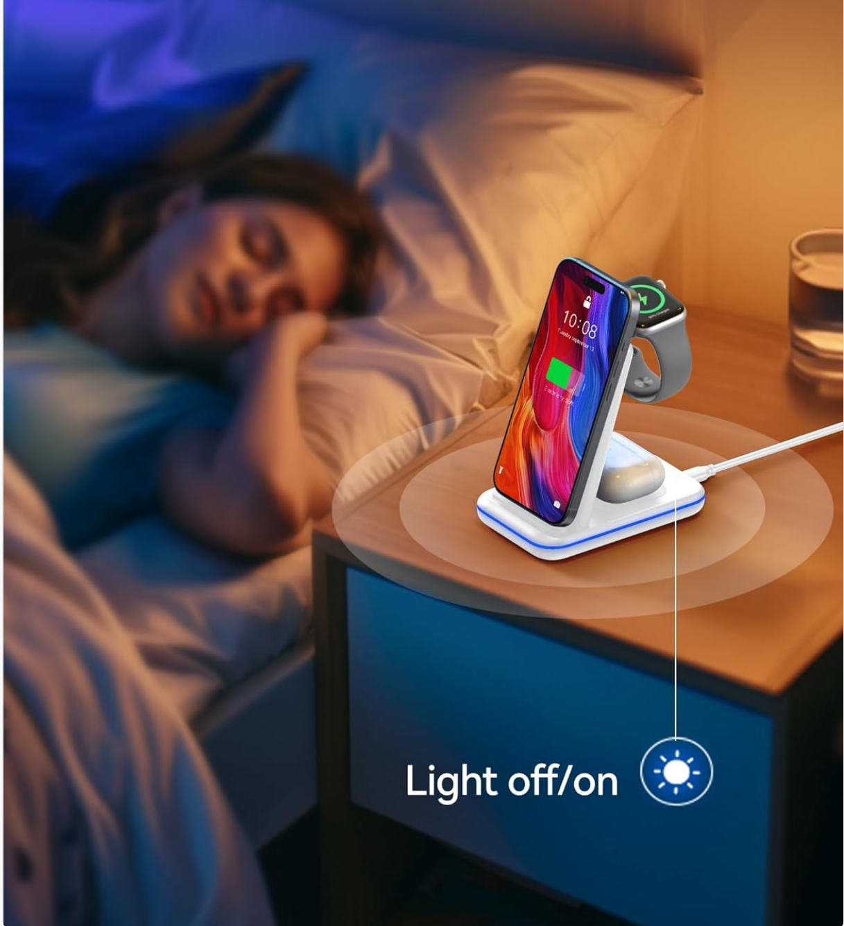
Figure 6: The LED indicator light can be toggled on or off for convenience.