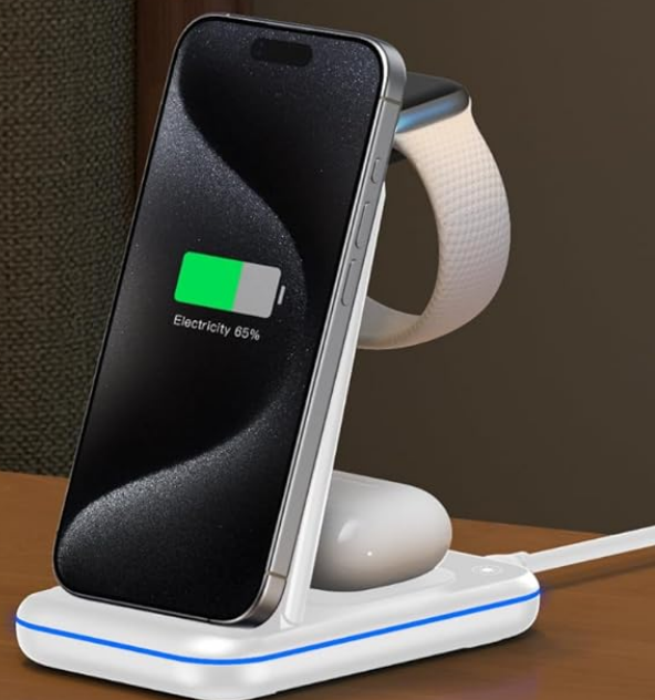
Figure 4: Universal compatibility of the TECKNET 3-in-1 Wireless Charger.