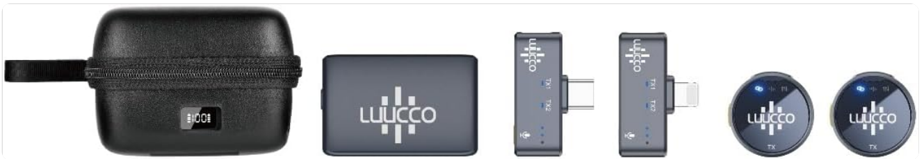
Image: A detailed view of the individual components of the LUUCCO AirWave K2 Combo, showing the charging case, receiver, and two transmitters.