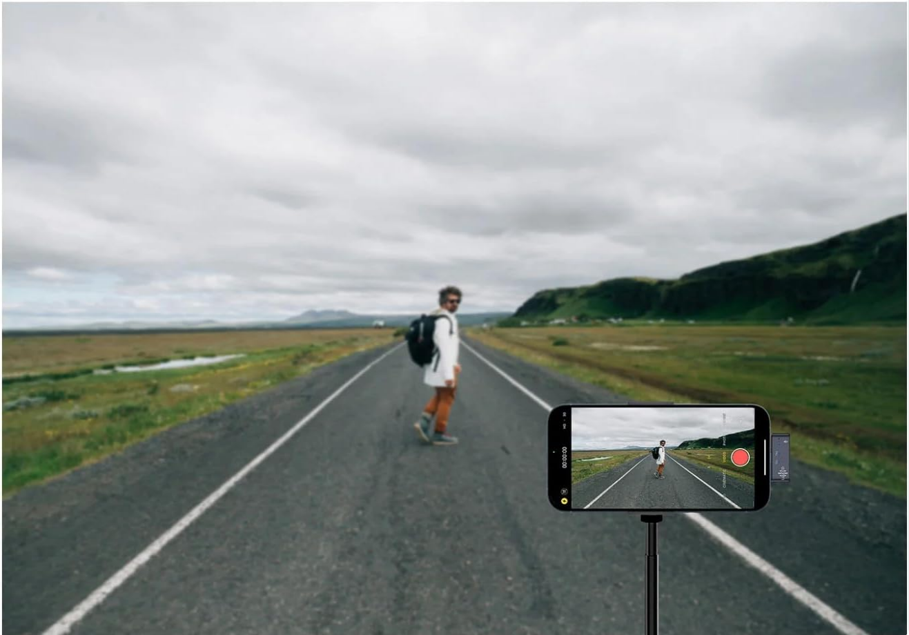
Image: Depicts the 100m wireless transmission capability of the LUUCCO AirWave K2, showing a person recording outdoors with a smartphone and the microphone.

2.4GHz spectrum to deliver a wireless transmission range of up to 100m (328').