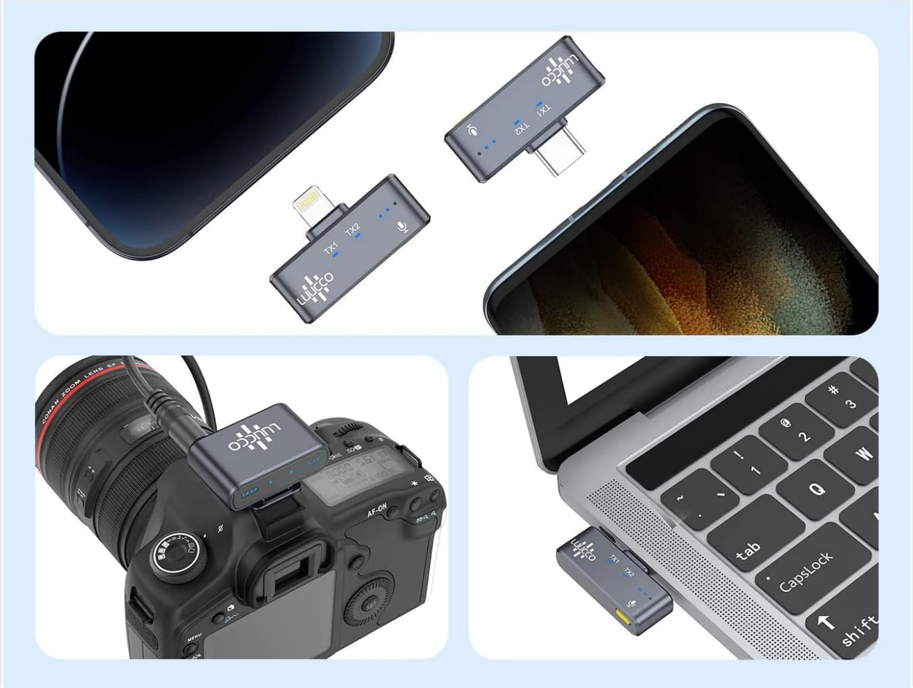
Image: Demonstrates the wide compatibility of the LUUCCO AirWave K2, showing its receivers connected to an iPhone, Android phone, camera, and laptop.

With different receivers, the Luucco AirWave can work with different devices, such as cameras, iOS/Android smartphones, and tablets, computers.