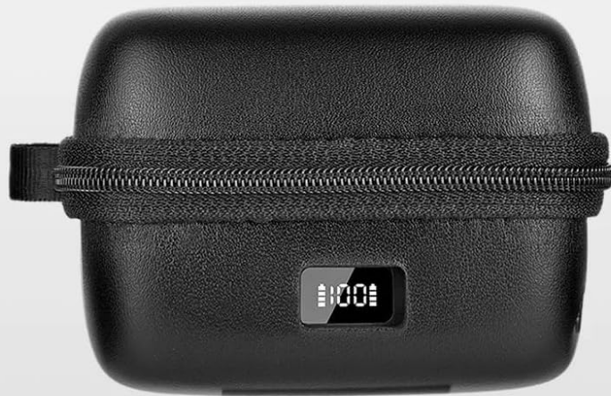
Image: The LUUCCO AirWave K2 charging case displaying its digital power percentage, highlighting its long battery life and quick charging capabilities.