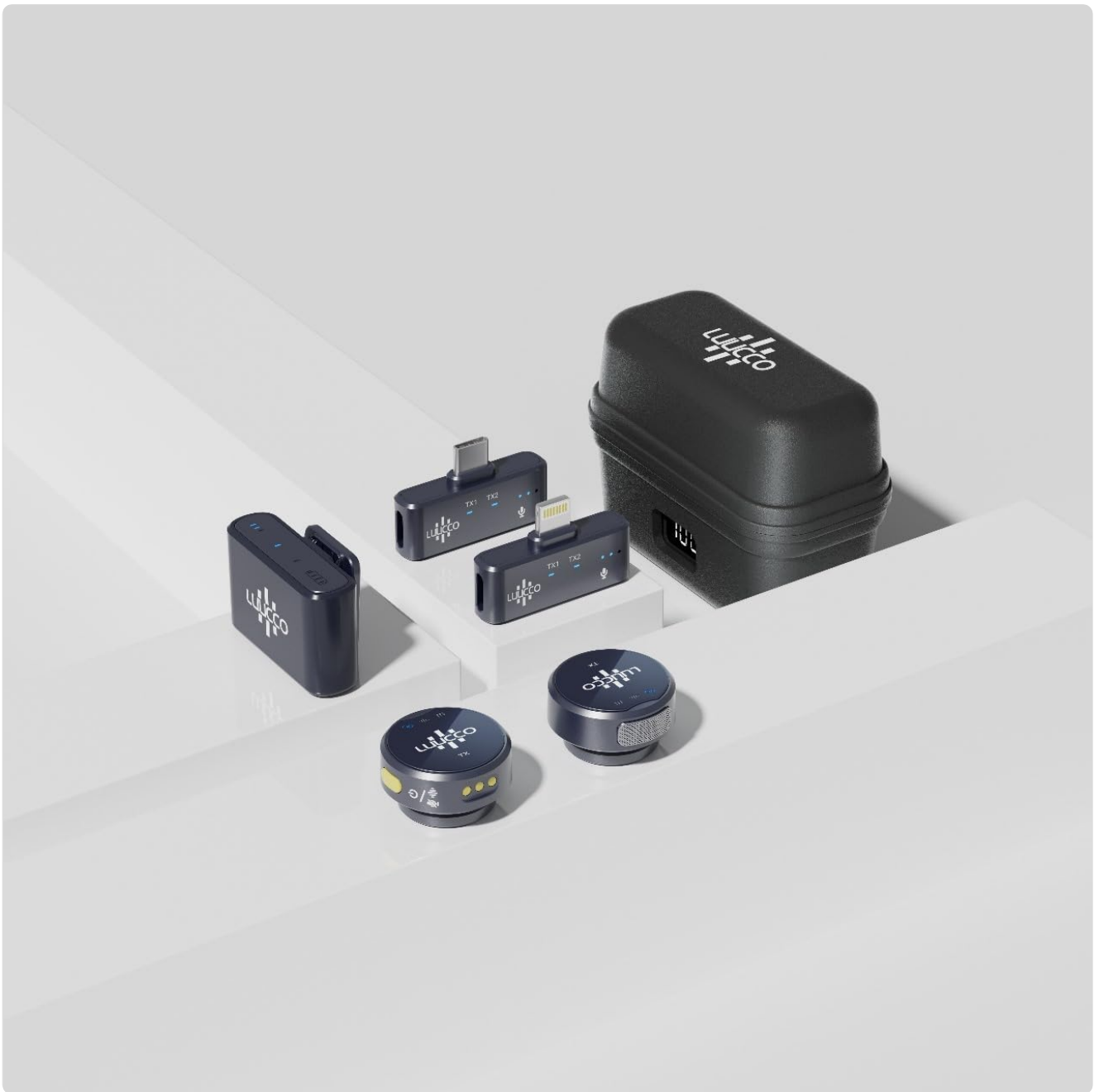
Image: The complete LUUCCO AirWave K2 Combo Wireless Microphone kit, including transmitters, receiver, and charging case.