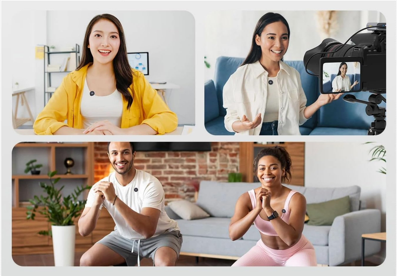
Image: Shows various usage scenarios for the LUUCCO AirWave K2, including interviews, podcasts, vlogs, and fitness recording, demonstrating its versatility for different content creation needs.

Easy to use two-subject for wireless mic solution, such as Interviews, Podcasts, Vlogs, and more.