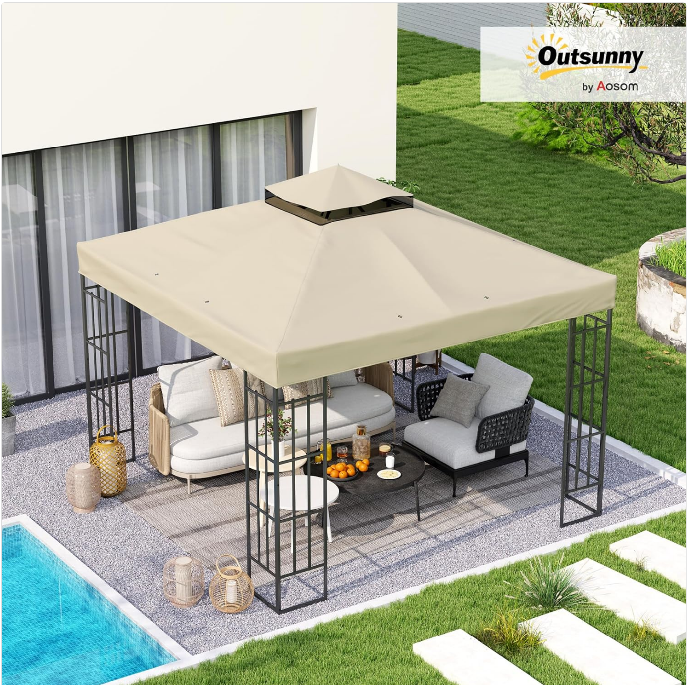
Image: A 10' x 10' gazebo with the cream replacement canopy cover installed, providing shade over an outdoor seating area.