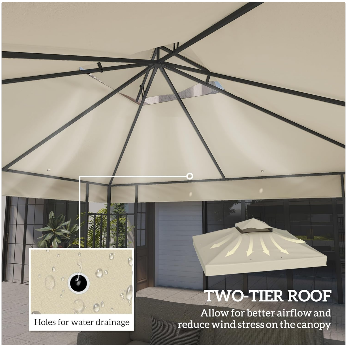
Image: An interior view of the gazebo canopy, showcasing the two-tier roof structure with mesh vents for ventilation and small holes for water drainage.