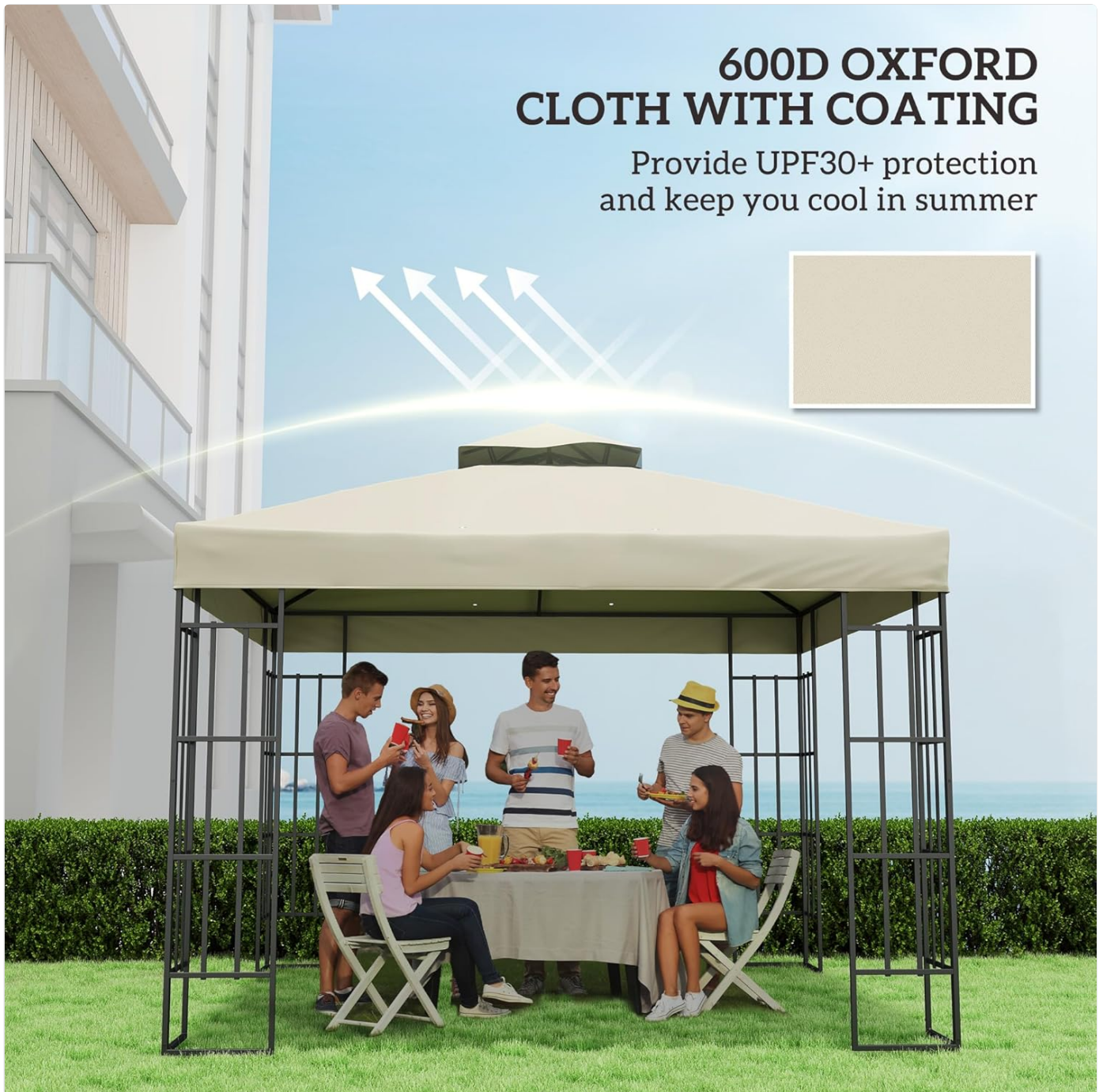
Image: A group of people gathered under a gazebo with the cream canopy, illustrating the shade and protection provided by the 600D Oxford cloth with coating.

Provide UPF30+ protection and keep you cool in summer