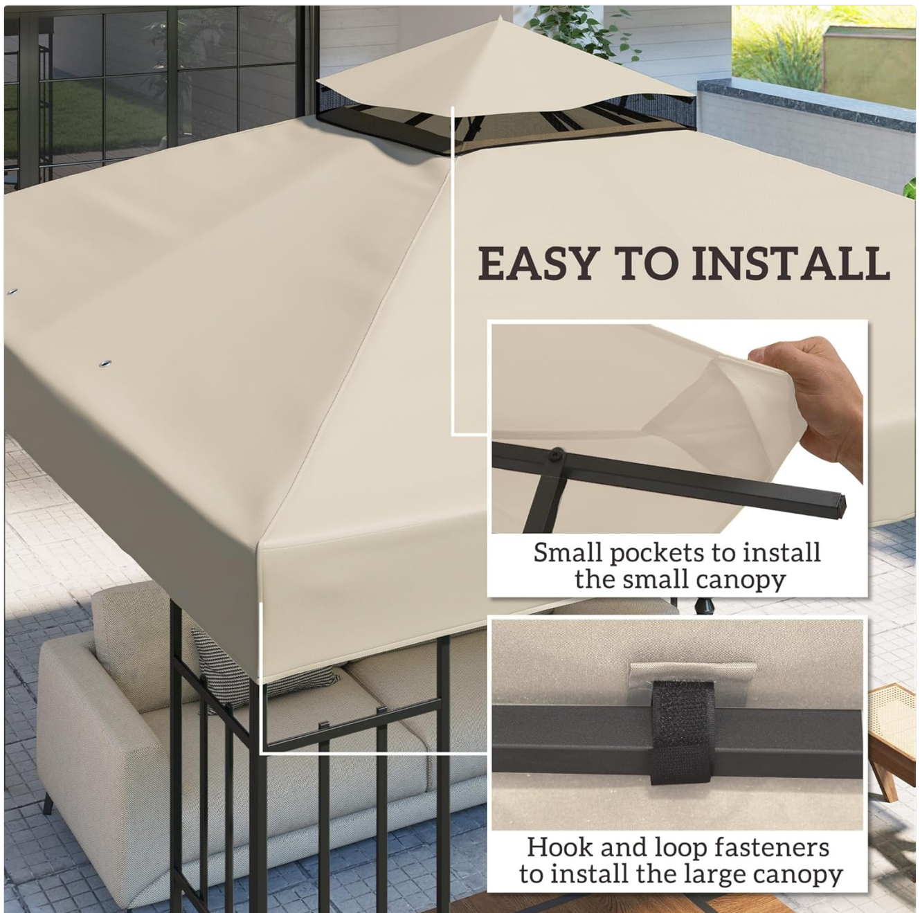
Image: A close-up view demonstrating the installation of the small canopy top, highlighting the corner pockets that slide over the frame.