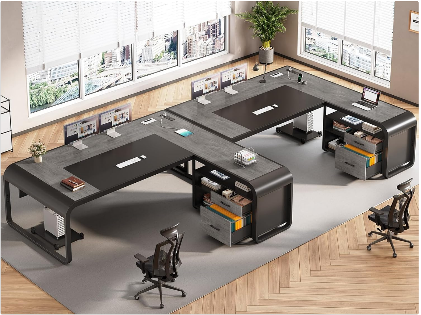
Figure 7: Adjustable foot pads at the base of the desk legs, allowing for stability on uneven surfaces.