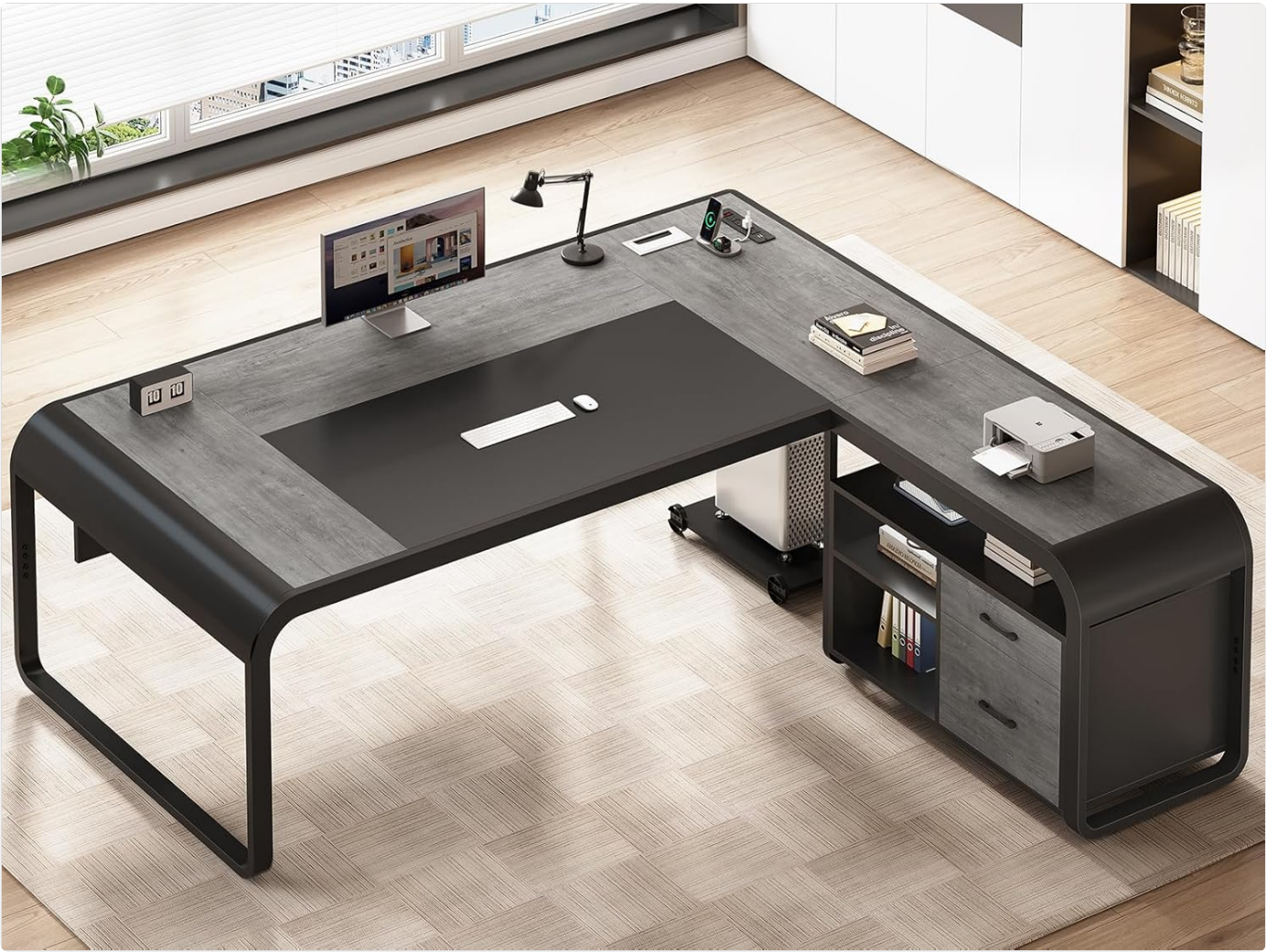
Figure 1: SEDETA 63 Inch Executive Desk in a typical office setup.