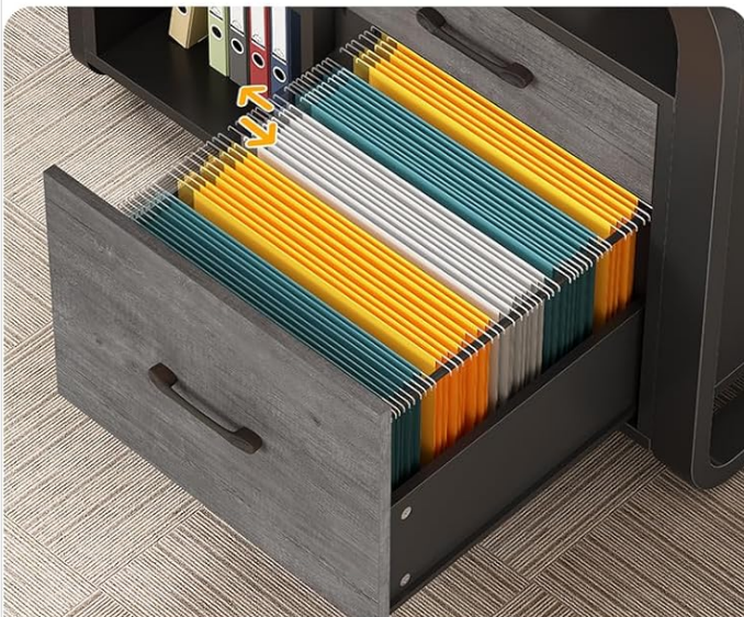
Letter Size/A4 Size