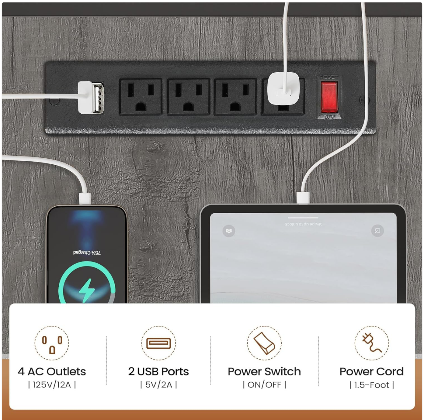
Figure 5: The integrated power strip and the mobile CPU stand, enhancing the desk's functionality.