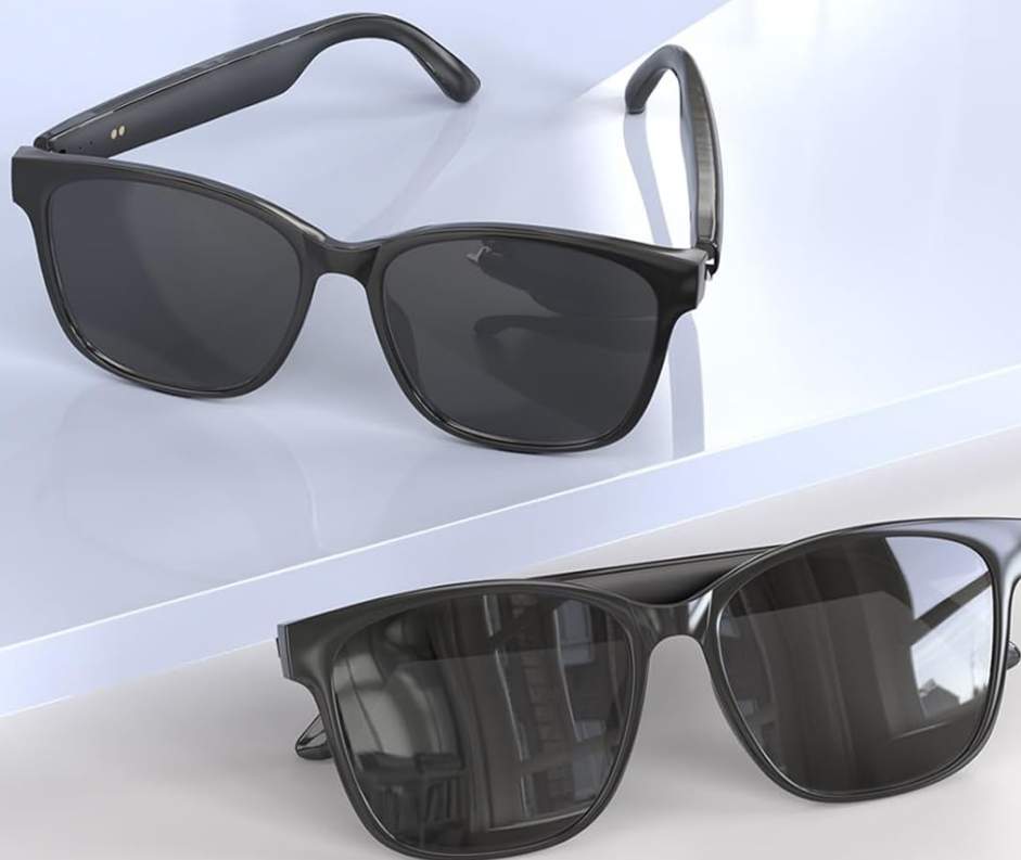
Image: Two pairs of Hy C8 PRO Smart Glasses, one viewed from the front and slightly above, and another from the side, highlighting their