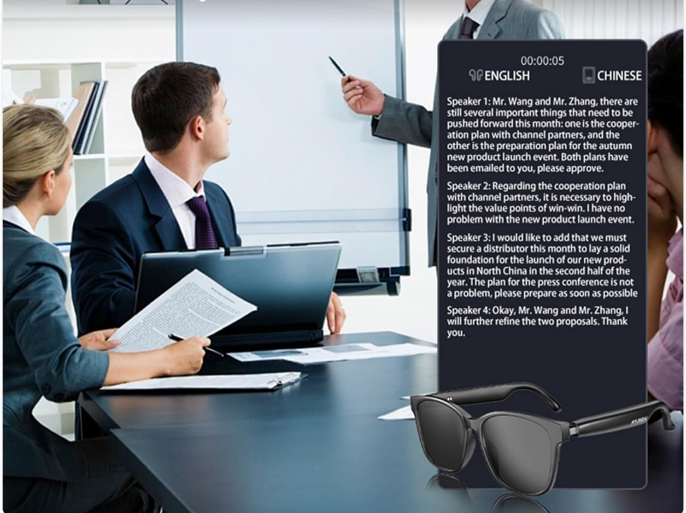
Image: A depiction of the on-site meeting recording feature, showing individuals in a meeting setting with the smart glasses in the foreground, and a phone screen displaying a recording interface with English and Chinese language options.

You can start live recording on the APP.