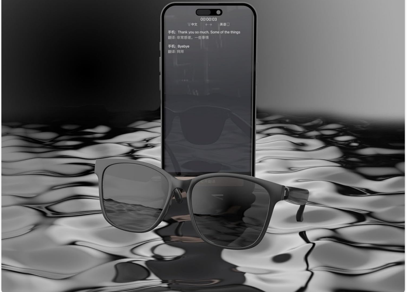
Image: The smart glasses positioned in front of a smartphone displaying a communication interface, illustrating the capability for efficient communication and real-time translation, with text showing a conversation in different languages.