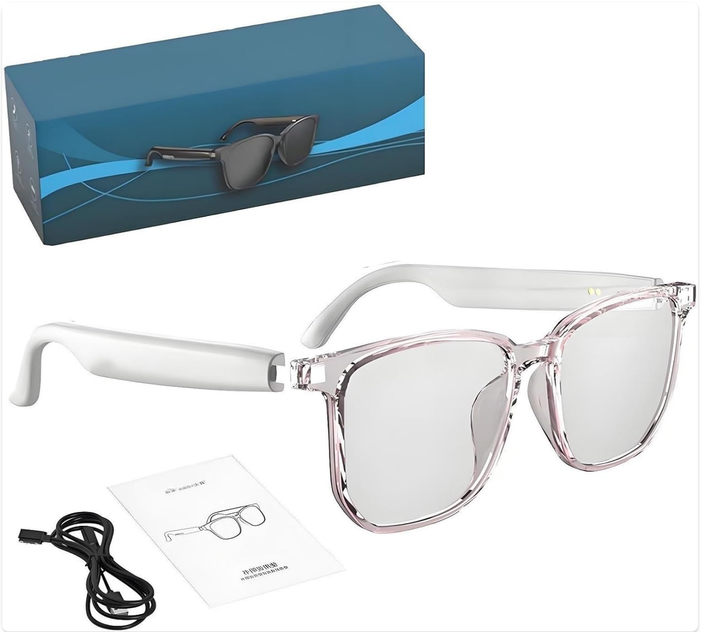
Image: The Hy C8 PRO Smart Glasses, shown with their retail packaging, a charging cable, and a small instruction leaflet. The glasses feature a clear frame with white temples, indicating their smart functionality.