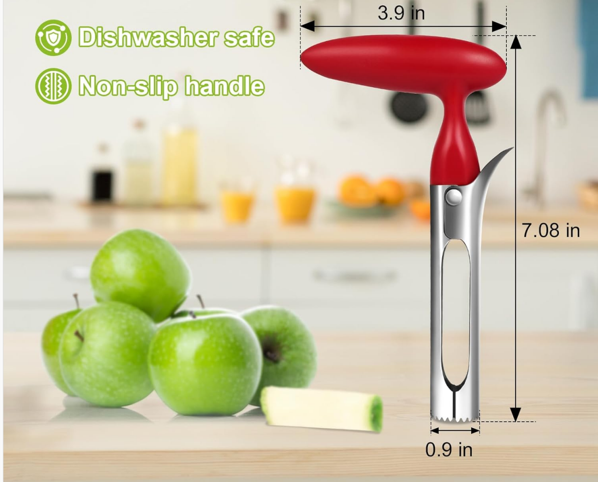
Image: The LIVSGNISTA Apple Corer Tool displayed with its key dimensions (length and width) and highlighting features like dishwasher safety and non-slip handle.