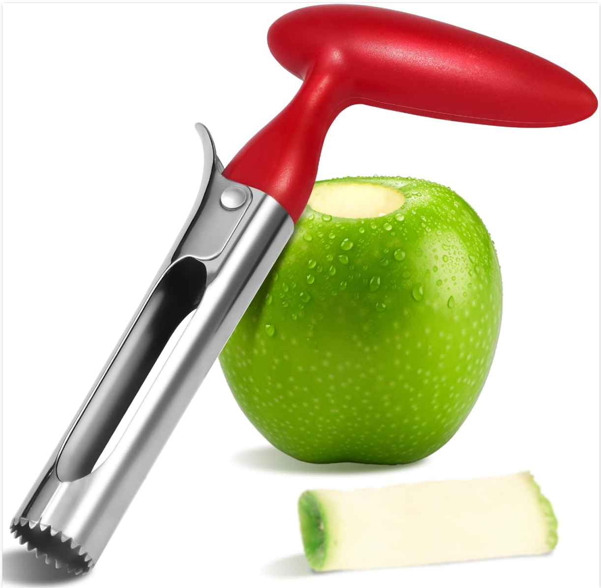
Image: The LIVSGNISTA Apple Corer Tool positioned next to a freshly cored green apple, with the removed core segment lying beside it.