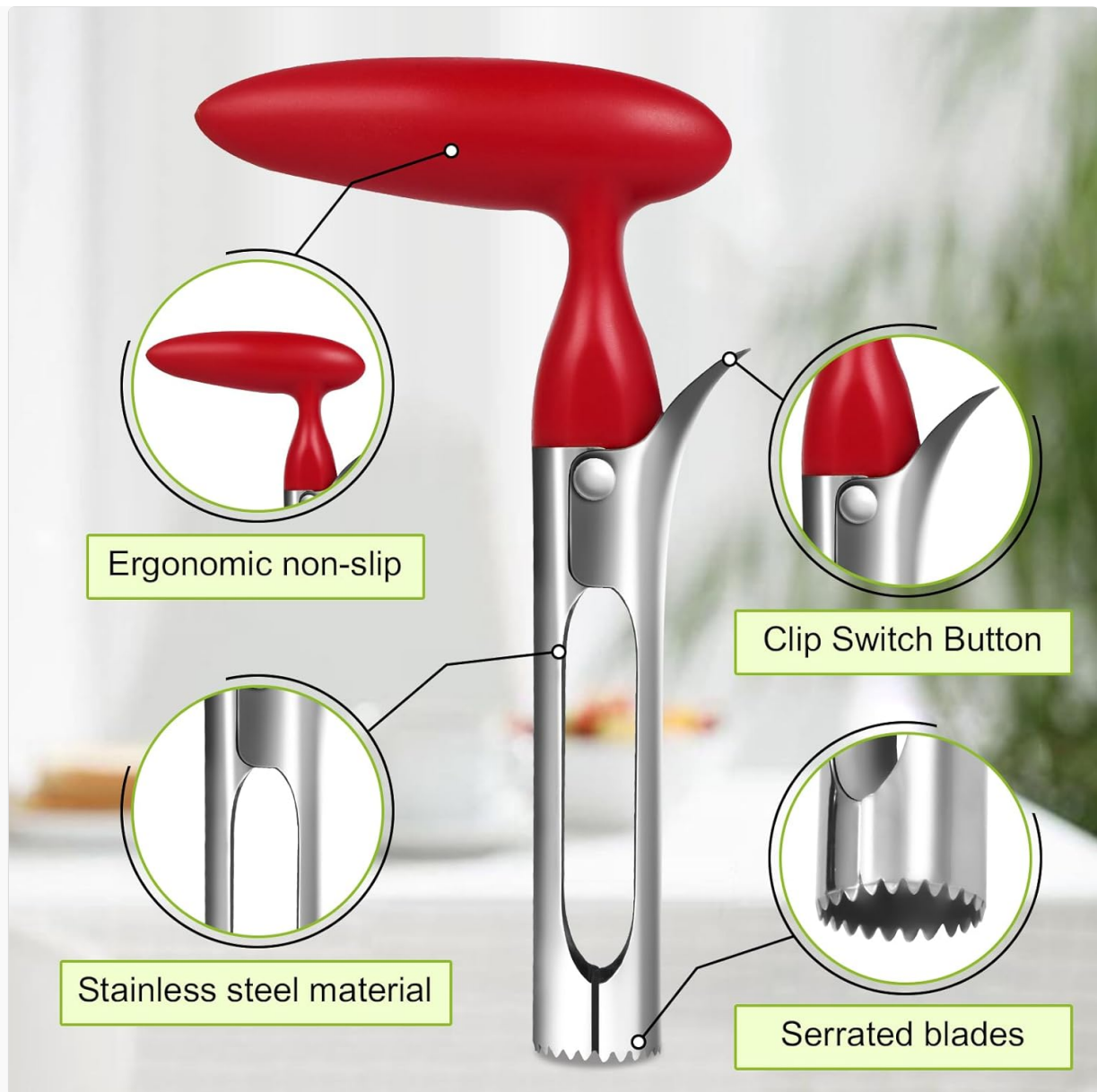
Image: Close-up view of the LIVSGNISTA Apple Corer Tool, pointing out its ergonomic non-slip handle, clip switch button, stainless steel material, and serrated blades.