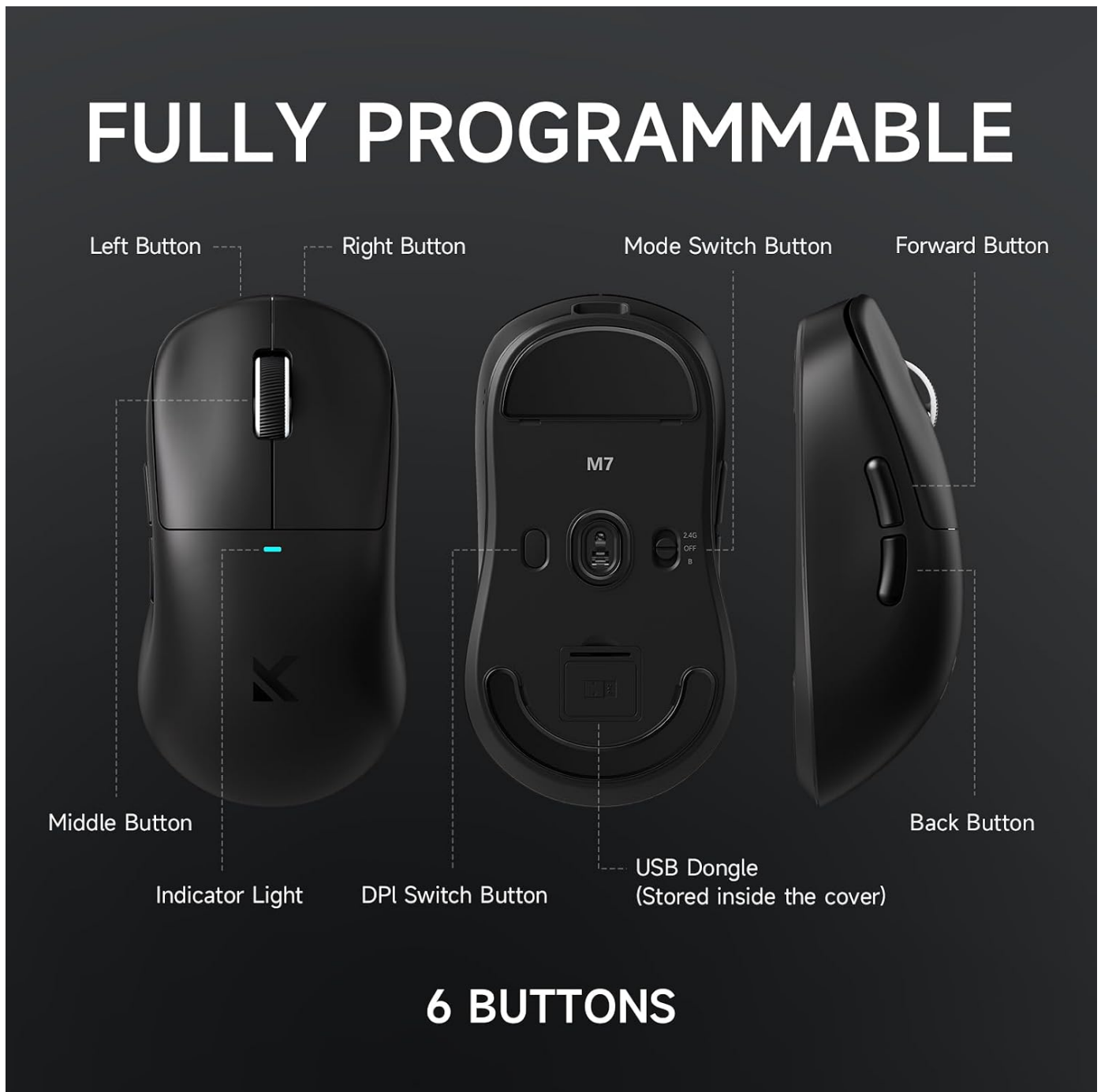
Figure 2.1: Overview of MCHOSE M7 Ultra buttons and components, including the USB dongle stored inside the mouse.

Video 2.1: MCHOSE M7 mouse Unboxing and Close-up. This video demonstrates the unboxing process and highlights the components included with the mouse.