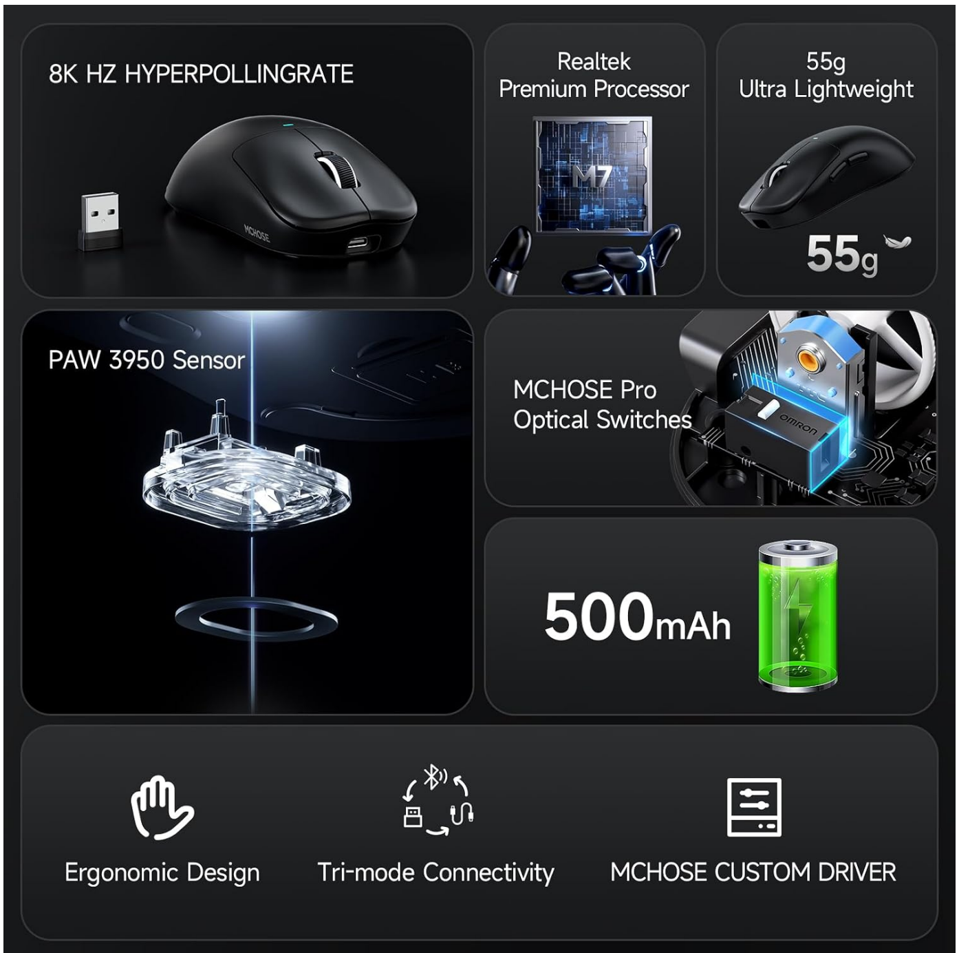
Figure 3.4: The MCHOSE Custom Driver provides a HUB software for comprehensive customization of your mouse settings.