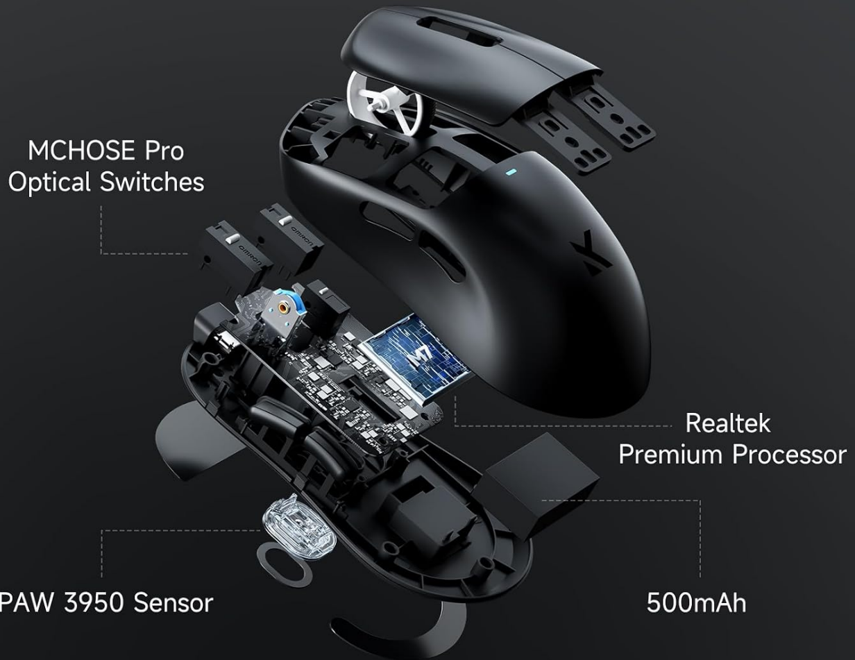
Figure 3.2: The cutting-edge PAW 3950 Optical Sensor provides unmatched responsiveness and precision.