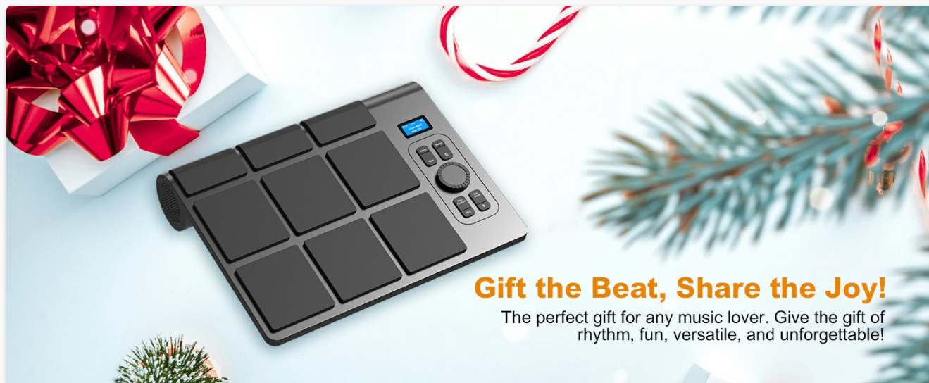
Image 6.1: Control panel and LCD screen for sound selection and settings.