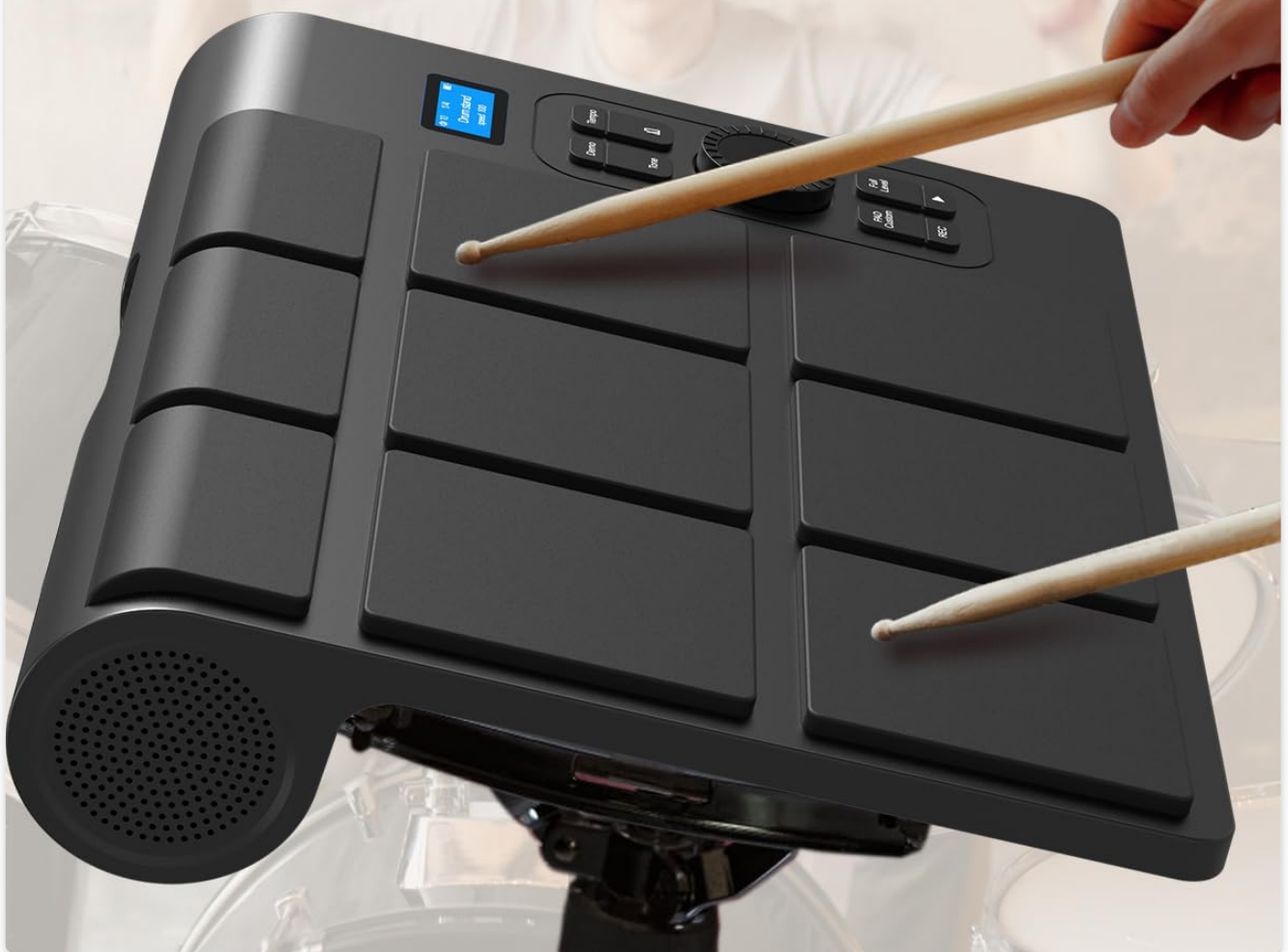
Image 5.1: The TD02 features a rechargeable battery and dual speakers.

Can connect external devices as speakers