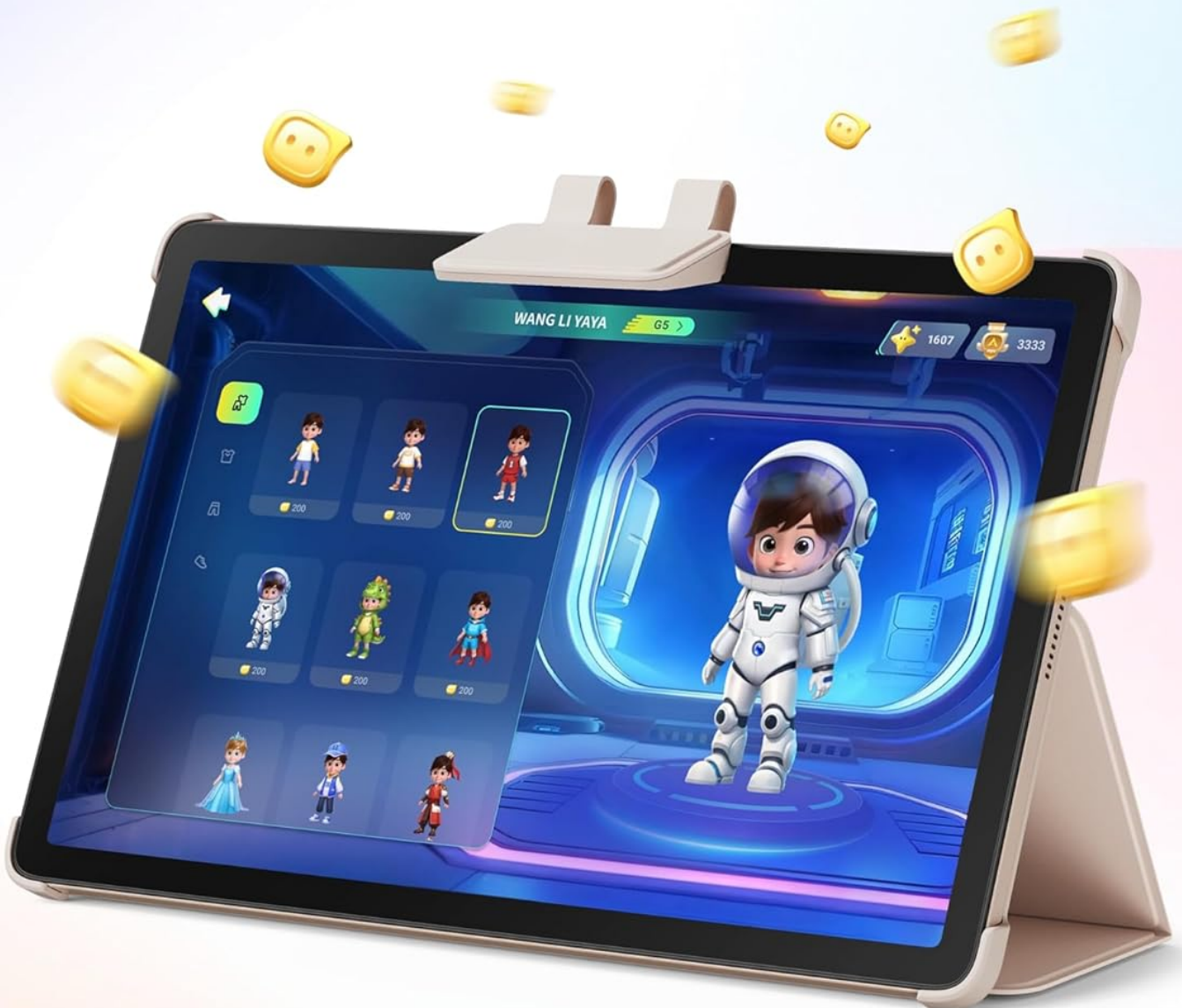
Image: The tablet screen displaying a gamified learning interface. A child's avatar in an astronaut suit is shown, with options to customize characters and earn rewards, surrounded by floating gold coin icons.

Earn rewards and unlock fun achievements for every learning milestone!