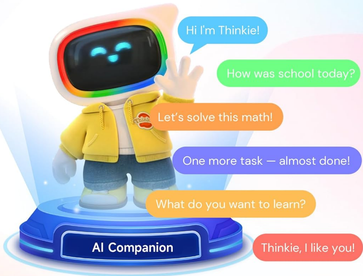
Image: The Thinkie AI character, a friendly robot, with conversation bubbles displaying phrases like "Hi I'm Thinkie!", "How was school today?", "Let's solve this math!", "One more task - almost done!", "What do you want to learn?", and "Thinkie, I like you!".