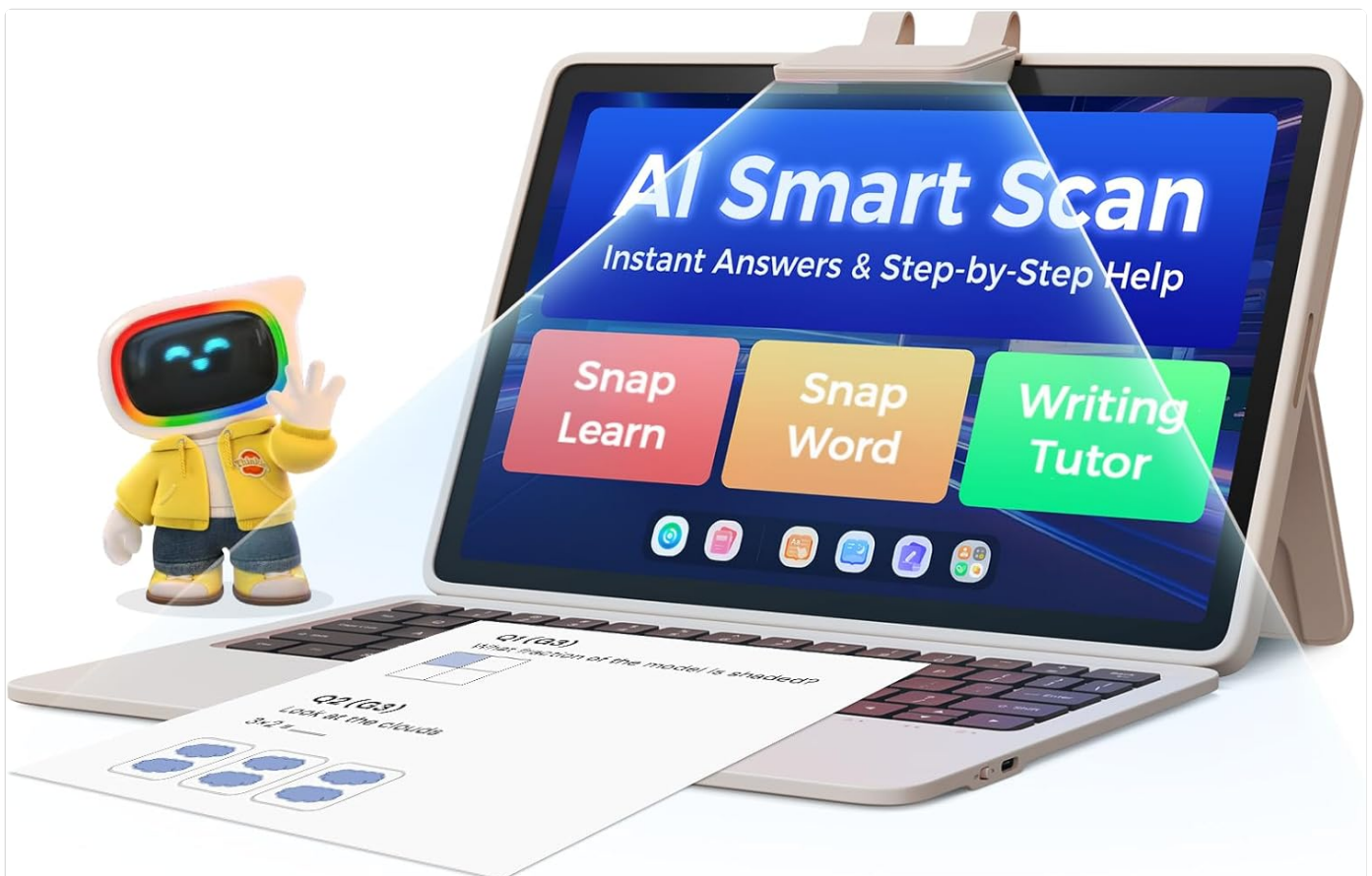
Image: The AI Kids Tablet T100 with its detachable keyboard, demonstrating the AI Smart Scan feature. A document is placed in front of the tablet, and a light beam from the tablet's top edge scans it, displaying "AI Smart Scan" on the screen with options like "Snap Learn,"

The Think Academy AI Kids Tablet T100 is an advanced educational device designed for children from Pre-K to Grade 6. It features an AI-powered tutor, a vast library of educational content, and a gamified learning system to make education engaging and effective. This model includes a detachable keyboard for enhanced functionality, supporting a comprehensive learning experience across subjects like ELA, Math, ABC, Word, Read, Phonics, and STEM.