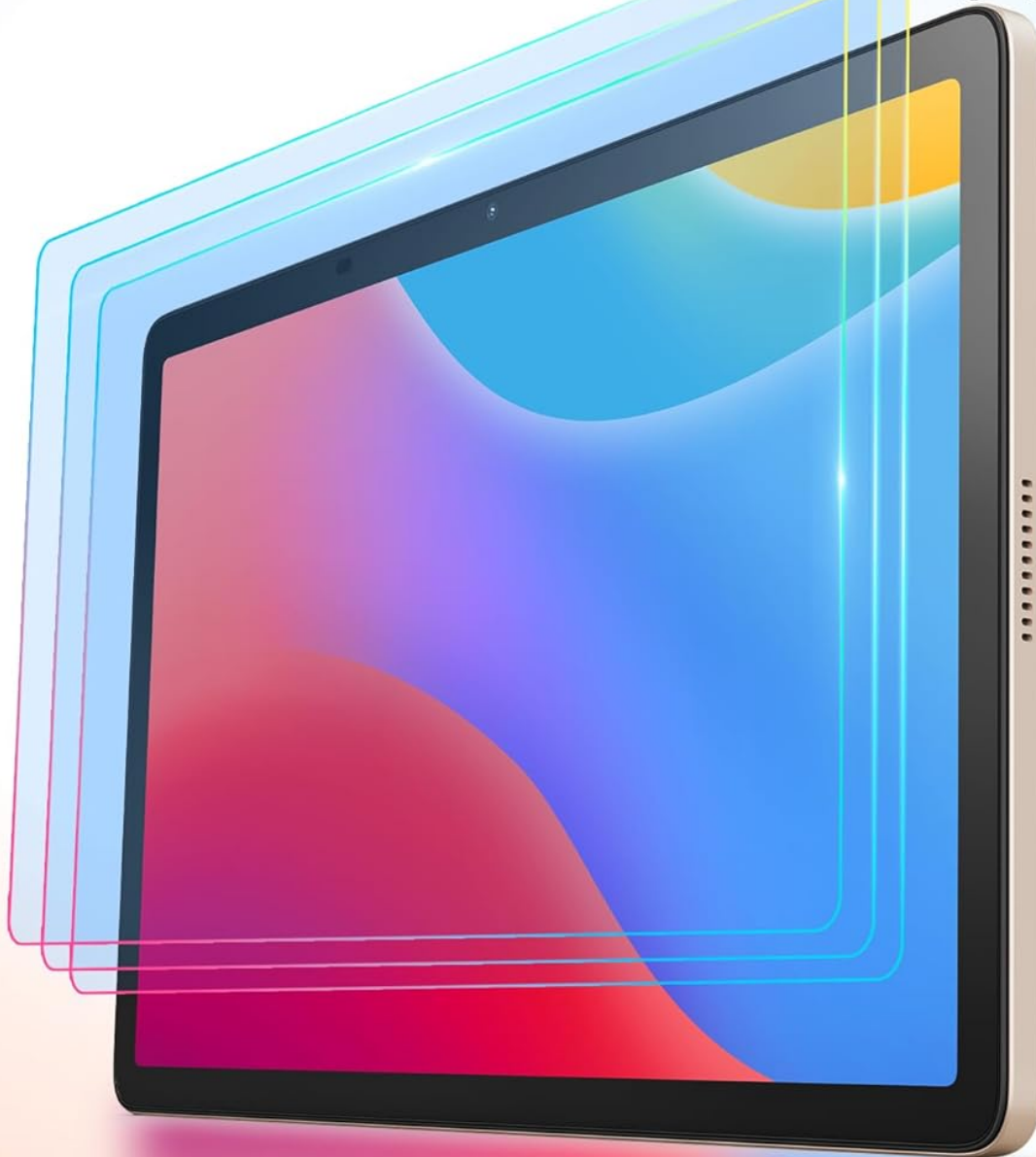
Image: A visual representation of the tablet's 11-inch eye-care screen, highlighting its features: LCD Display, TÜV Certified, DC Dimming, Flicker-Free, Anti-Glare, and Anti-Fingerprint layers.