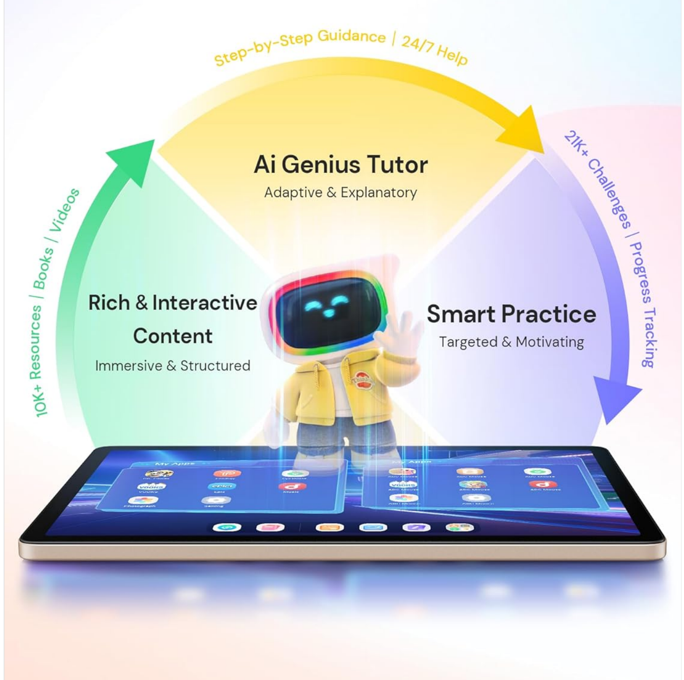
Image: A diagram titled "Reimagining Learning From Tomorrow For Today" showing a central AI character. Arrows point to "AI Genius Tutor" (Adaptive & Explanatory, Step-by-Step Guidance, 24/7 Help), "Rich & Interactive Content" (Immersive & Structured, 10K+ Resources, Books, Videos), and "Smart Practice" (Targeted & Motivating, 21K+ Challenges, Progress Tracking).